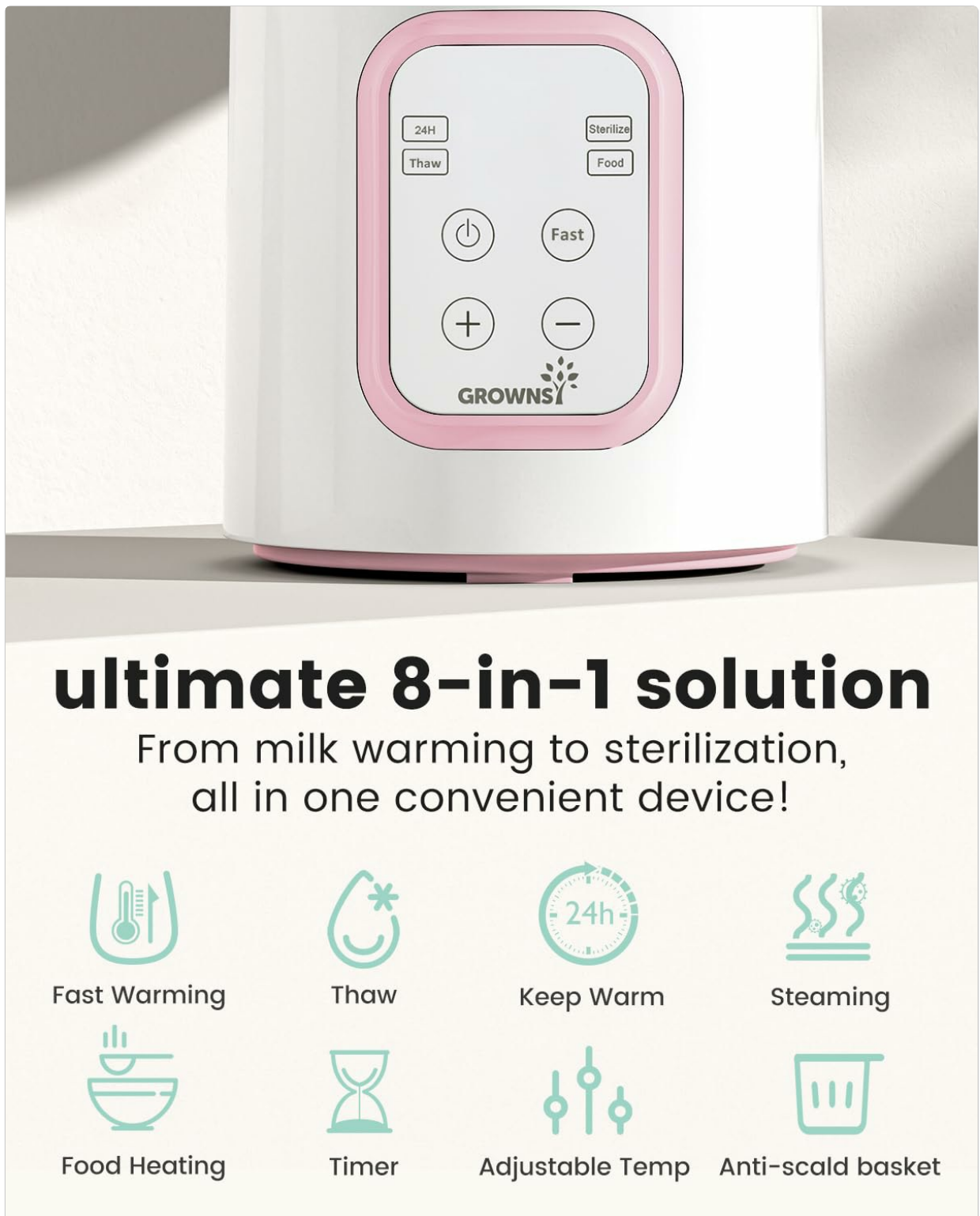
Figure 2: Control Panel Detail

A close-up view of the control panel, showing buttons for Power, Fast Warming, 24H Keep Warm, Food Heating, Sterilize, and temperature/time adjustment buttons (+/-).