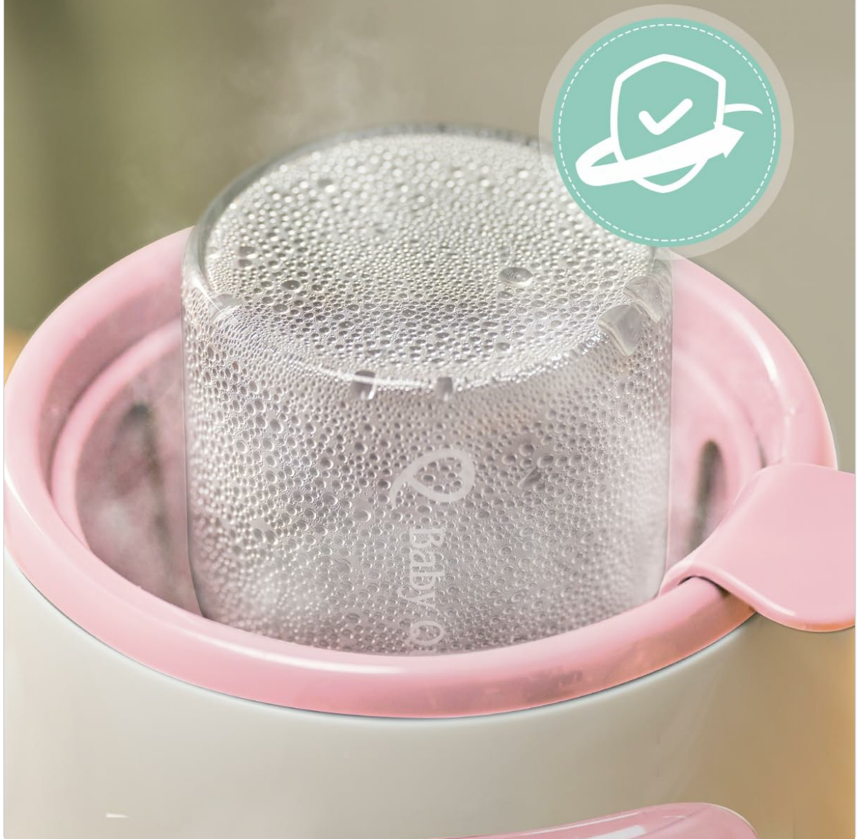
Figure 7: Steam Sterilization

High-Temperature Disinfection Kills 99.99% of Germs