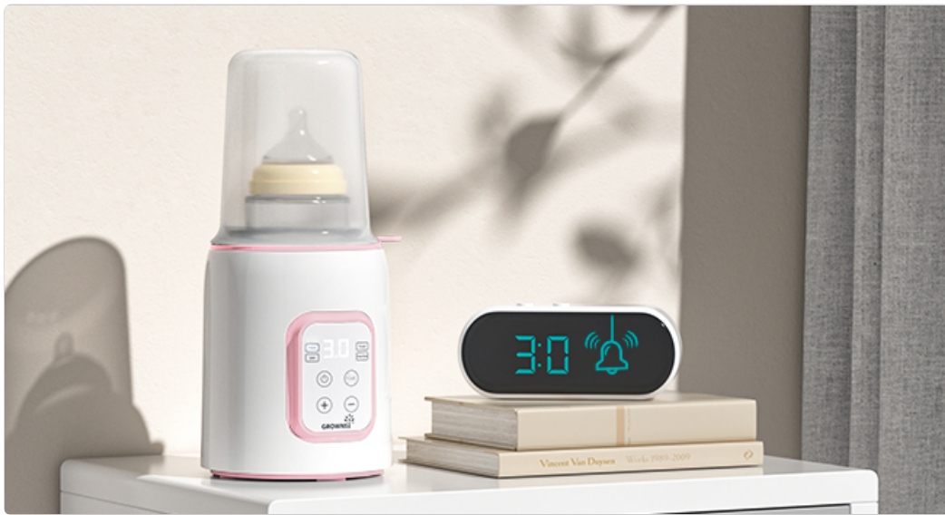
Figure 3: Night Feeding Convenience

This mode quickly heats milk or formula to a ready-to-feed temperature. Ideal for urgent feeding needs.