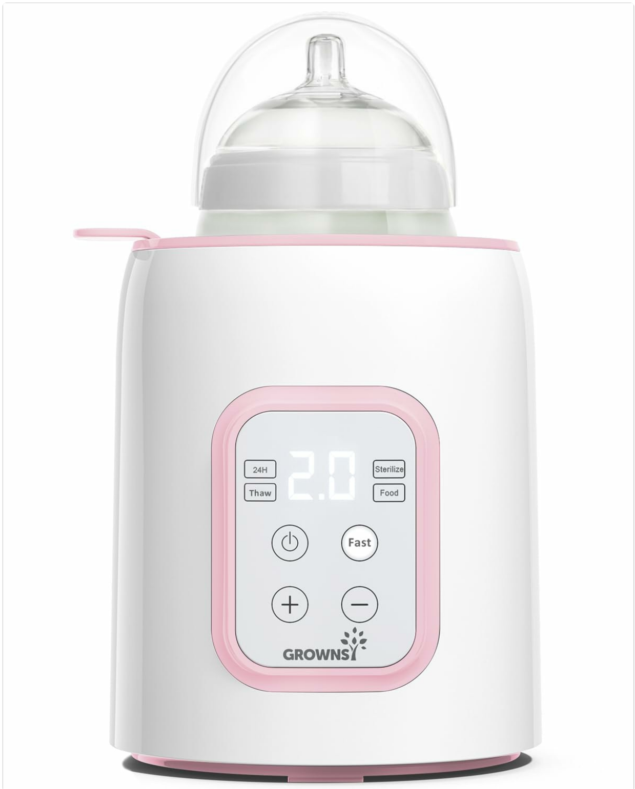
Figure 1: GROWNSY N1T Baby Bottle Warmer Overview

This image displays the main unit of the GROWNSY N1T Baby Bottle Warmer, featuring its compact design, transparent lid, and intuitive control panel. A baby bottle is shown inside the warmer.