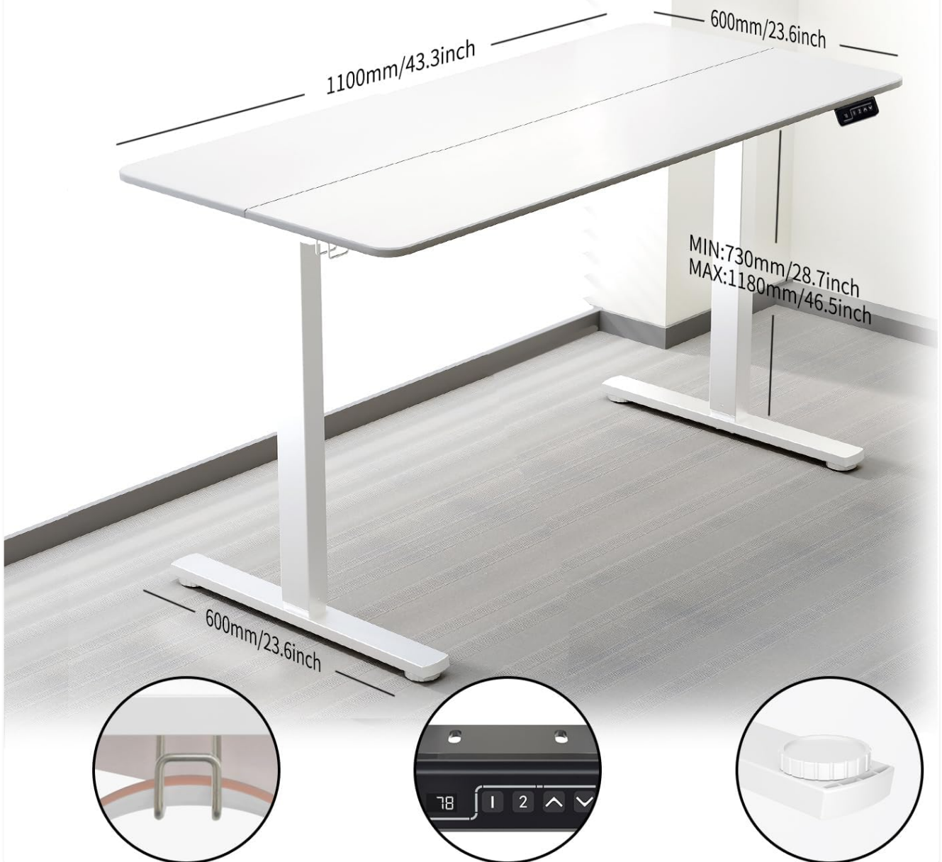
Figure 3: Desk dimensions and height range.