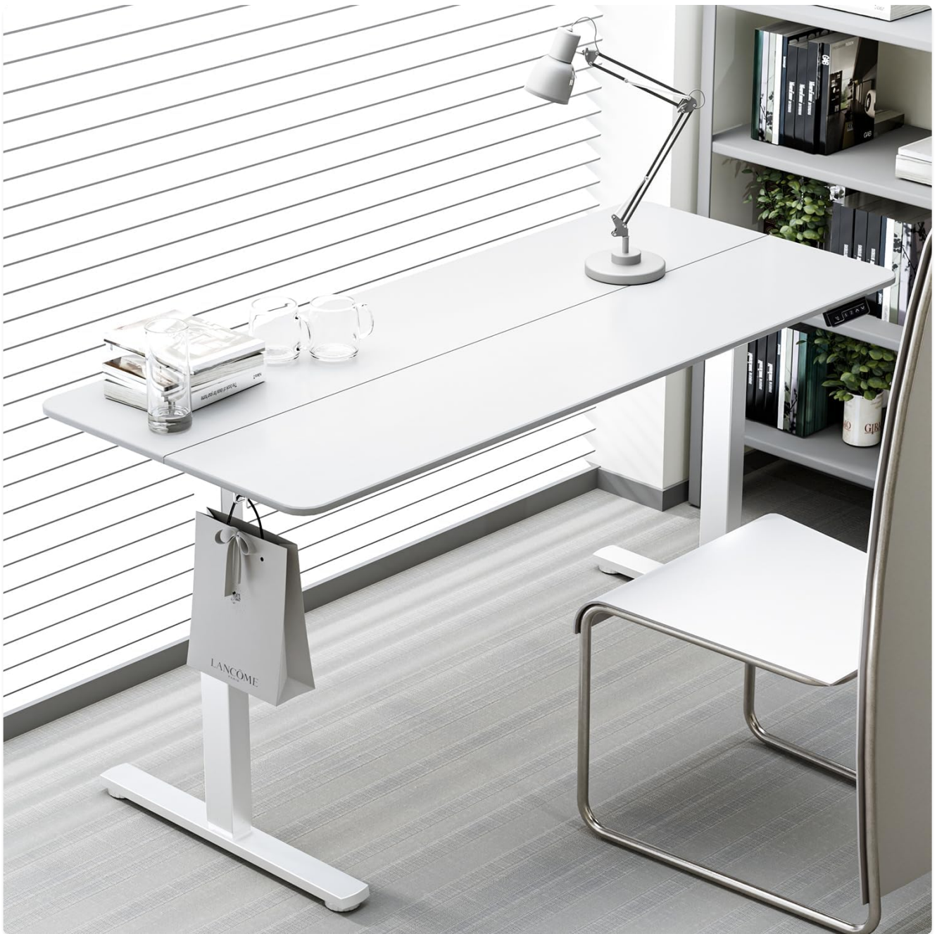
Figure 1: ERGOMAKER 43 inch Electric Standing Desk in a modern office setting.