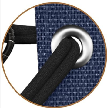
Double Bungee Cords