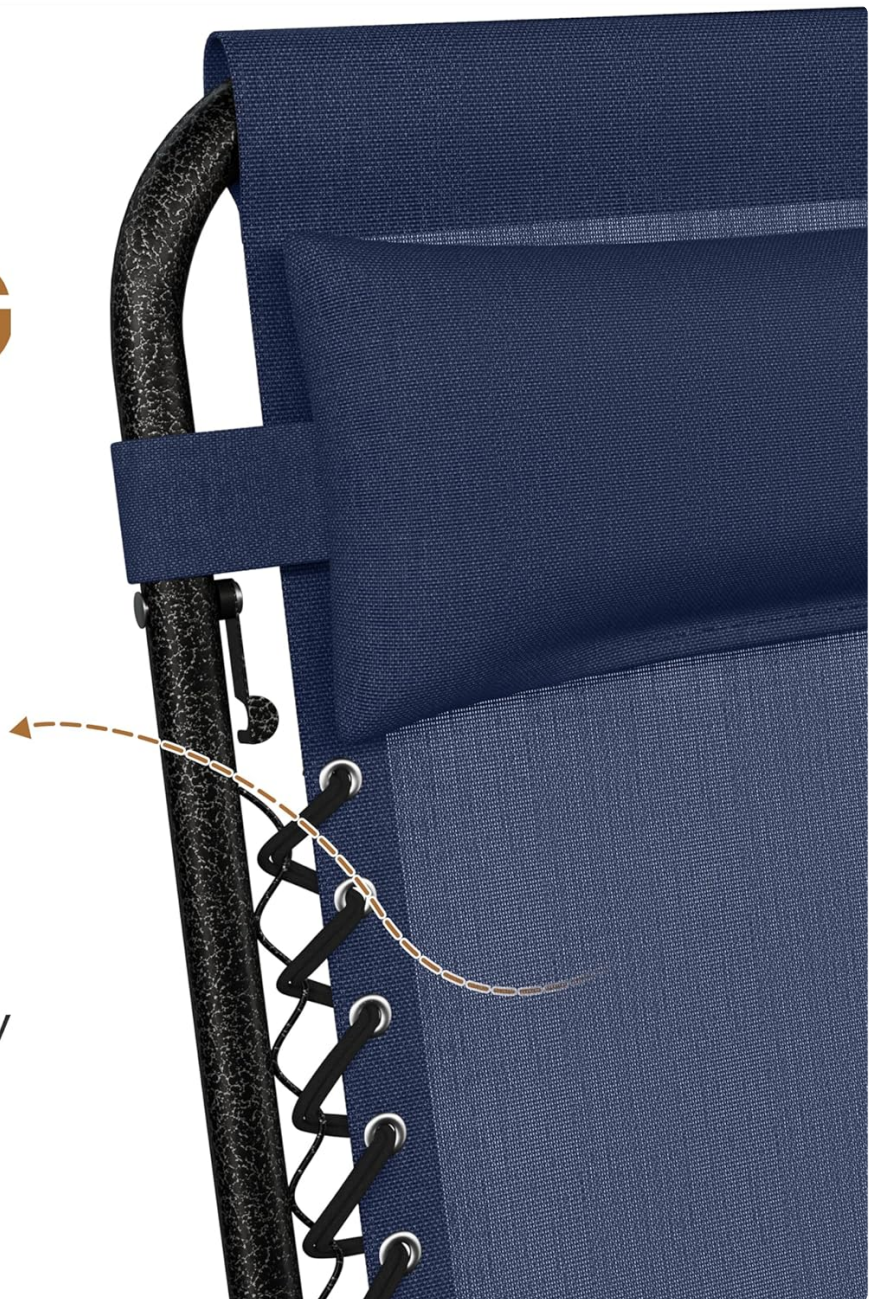
Image 5.1: The chair's foldable structure and portable carry strap for easy transport.

Breathable, Lightweight, Highly durable, Easy-cleaning