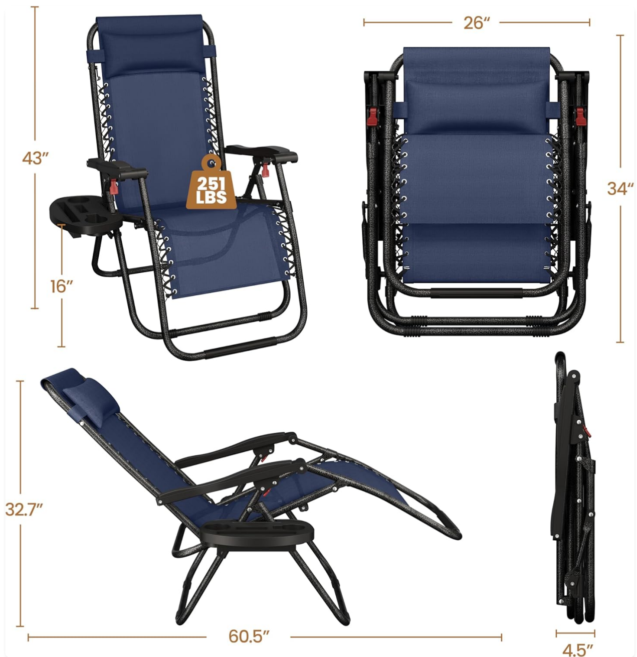
Image 7.1: Detailed dimensions and weight capacity of the recliner chair.