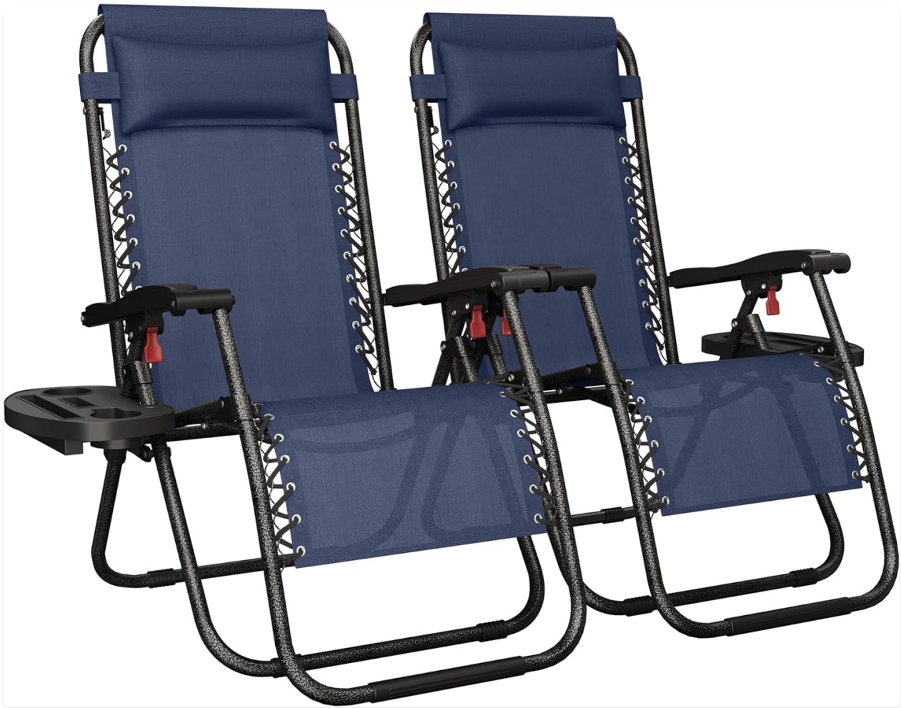
Image 1.1: Two Yaheetech Zero Gravity Recliner Chairs in navy blue, shown with attached cup holder trays.