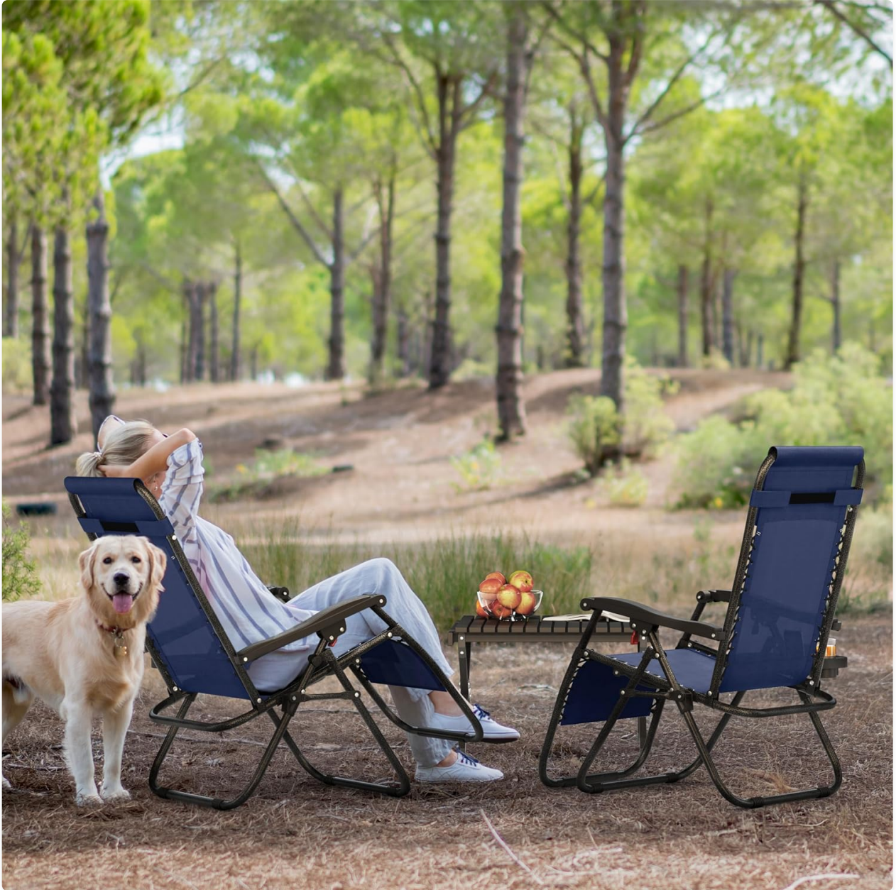
Image 3.1: A person demonstrating the unfolding process of the recliner chair.

Your browser does not support the video tag.