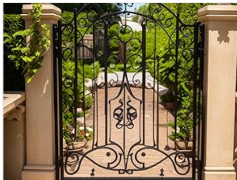
Image 3.2: The padlock in use on a metal gate, highlighting its suitability for outdoor security.