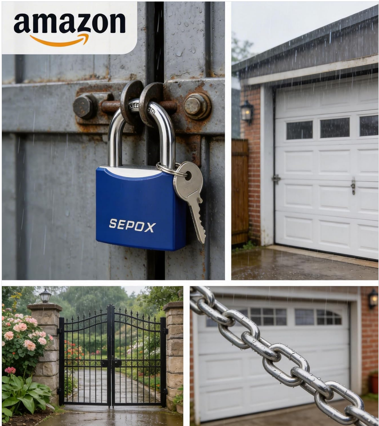
Image 4.1: The padlock exposed to rain, illustrating its waterproof design.