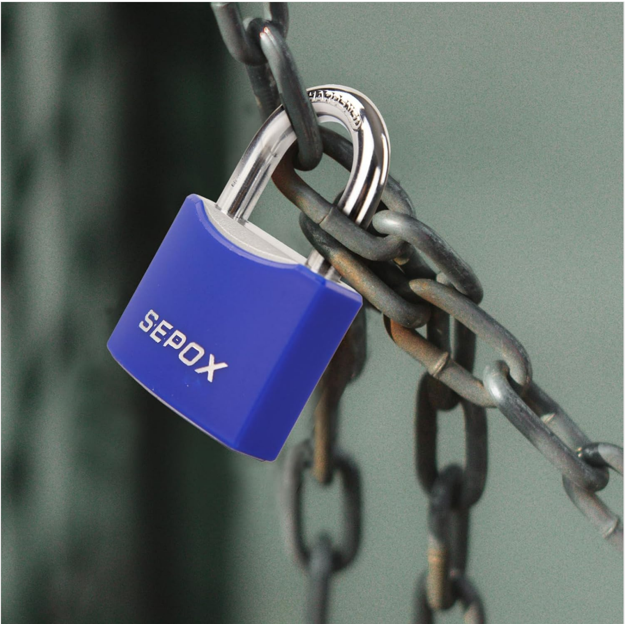
Image 3.1: The SEPOX padlock securing a heavy chain, demonstrating typical usage.