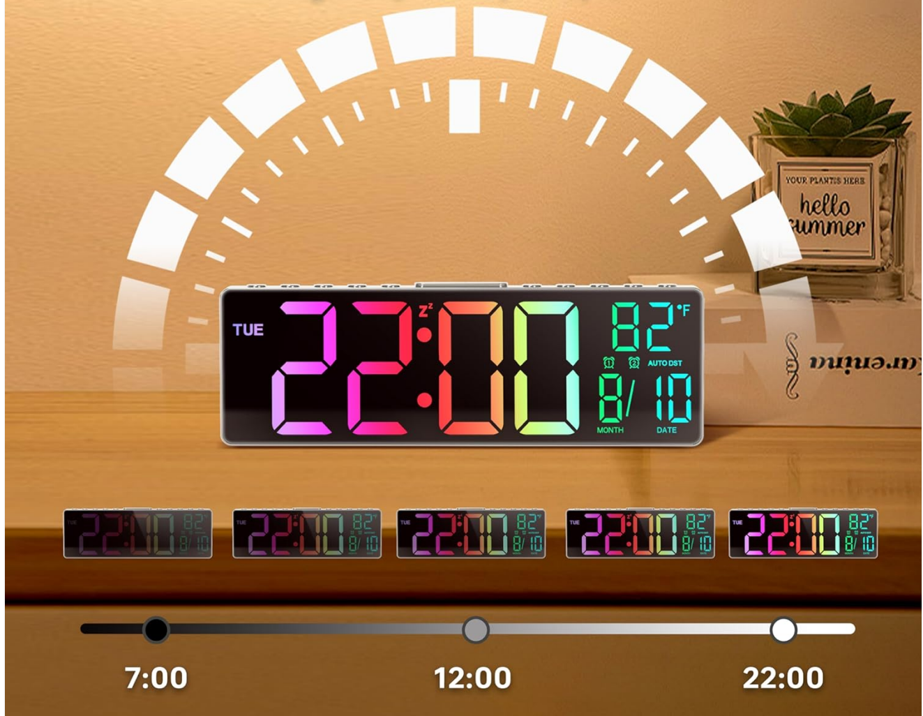
Figure 6: The JALL Digital Alarm Clock illustrating its auto-dimming capability, which adjusts display brightness based on ambient light conditions to protect your eyes.

Auto adjust brightness according to the environment light to protect your eyes