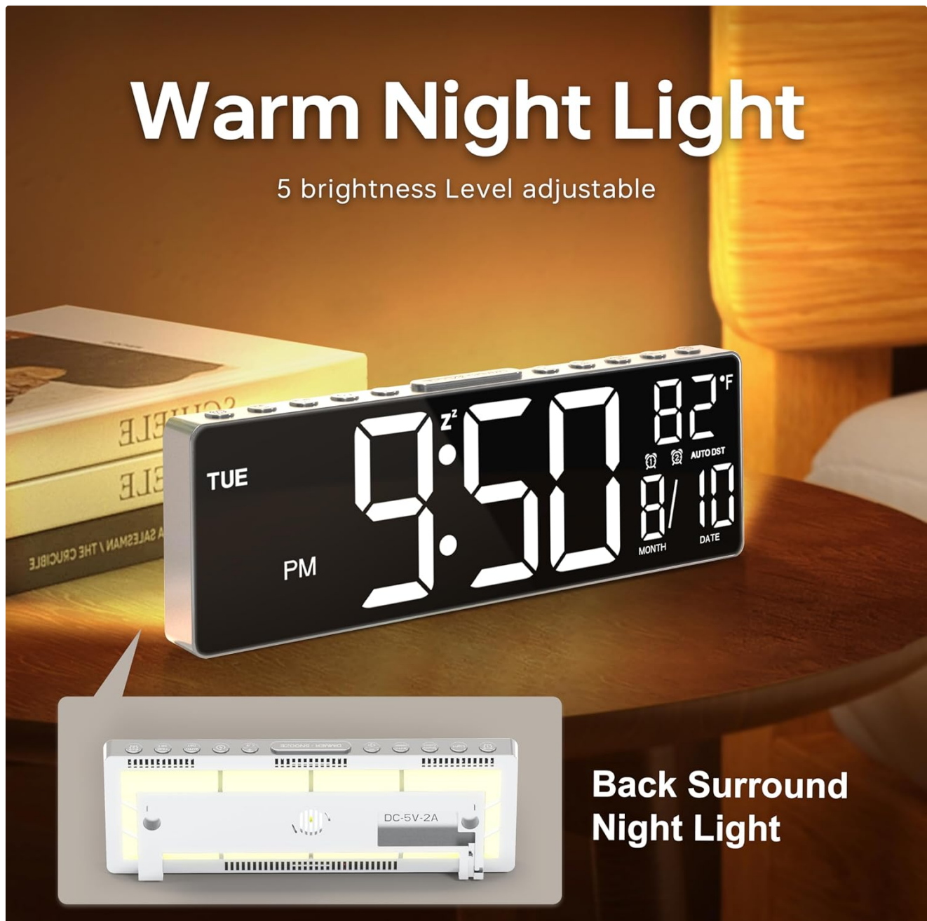
Figure 5: The JALL Digital Alarm Clock with its warm night light feature active, providing a soft ambient glow from the back surround.