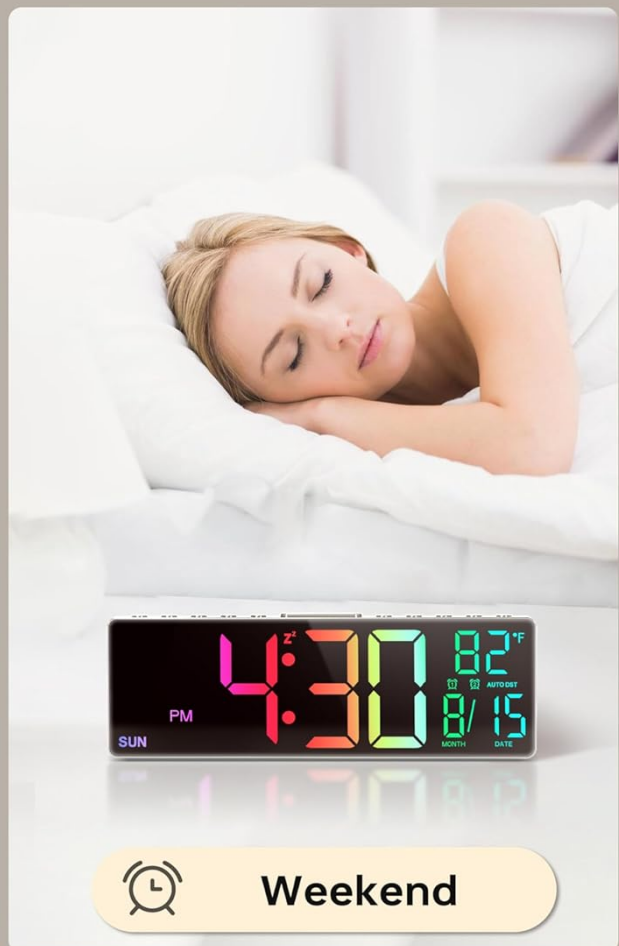
Figure 4: The JALL Digital Alarm Clock illustrating its dual alarm capability, allowing for separate alarm settings for weekdays and weekends.