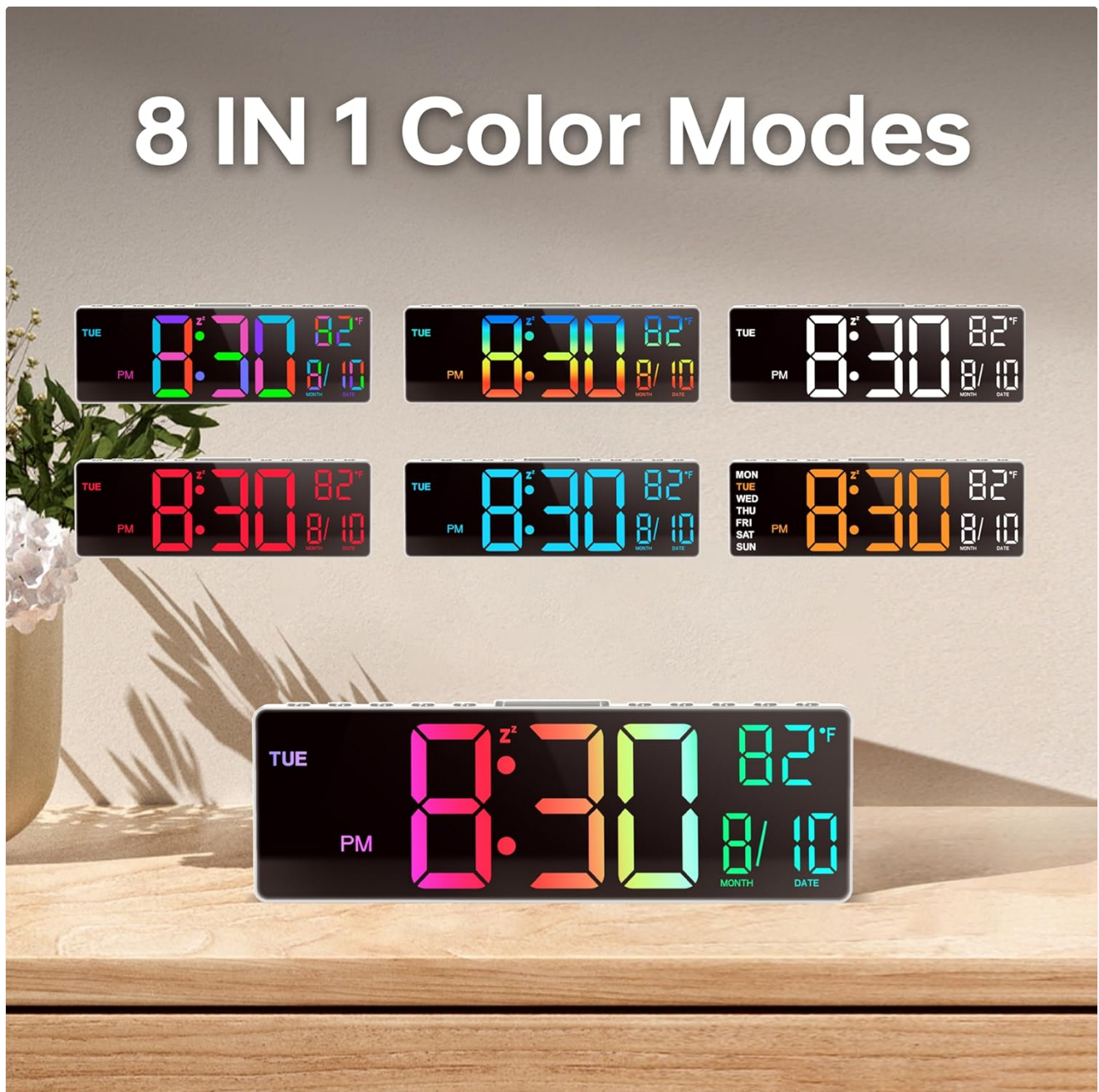
Figure 2: The JALL Digital Alarm Clock showcasing its 8-in-1 color modes, allowing users to customize the display color to their preference or enjoy a dynamic color-changing effect.