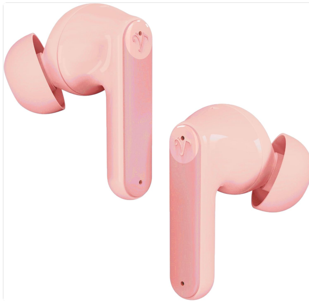
Image: A side view of both rose-colored Soundwave A1 earbuds, highlighting their ergonomic design and the stem extending from the main body.