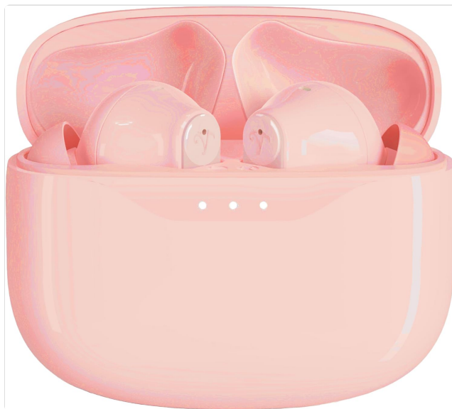
Image: The rose-colored Soundwave A1 earbuds are shown inside their open charging case, revealing the individual earbud slots and the charging contacts.