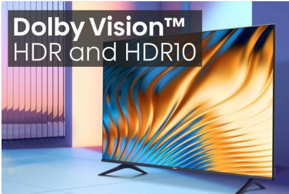
Image: Graphic promoting "Dolby Vision HDR and HDR10" with a dynamic, colorful abstract image on a TV screen.