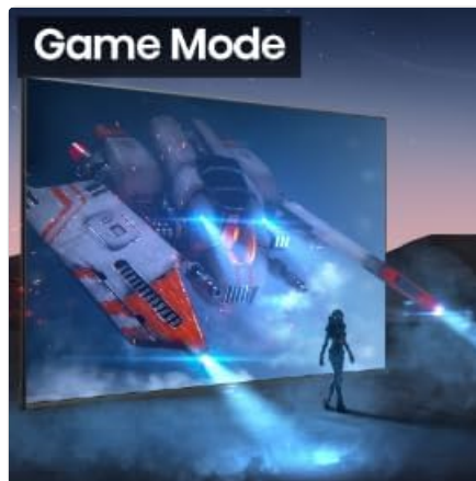
Image: Graphic illustrating "Game Mode" with a scene from a video game featuring a spaceship and character.