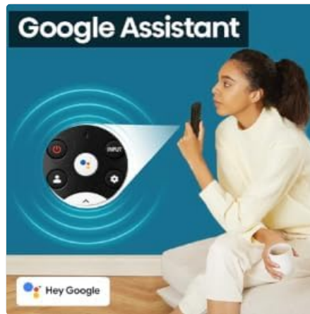
Image: Graphic showing a person using the remote control to activate Google Assistant, with a visual representation of sound waves emanating from the remote.

Your TV is compatible with Google Assistant. Press the Google Assistant button on your remote to use voice commands. You can ask Google to search for content, stream shows, open games, control smart home devices, and get answers to questions.