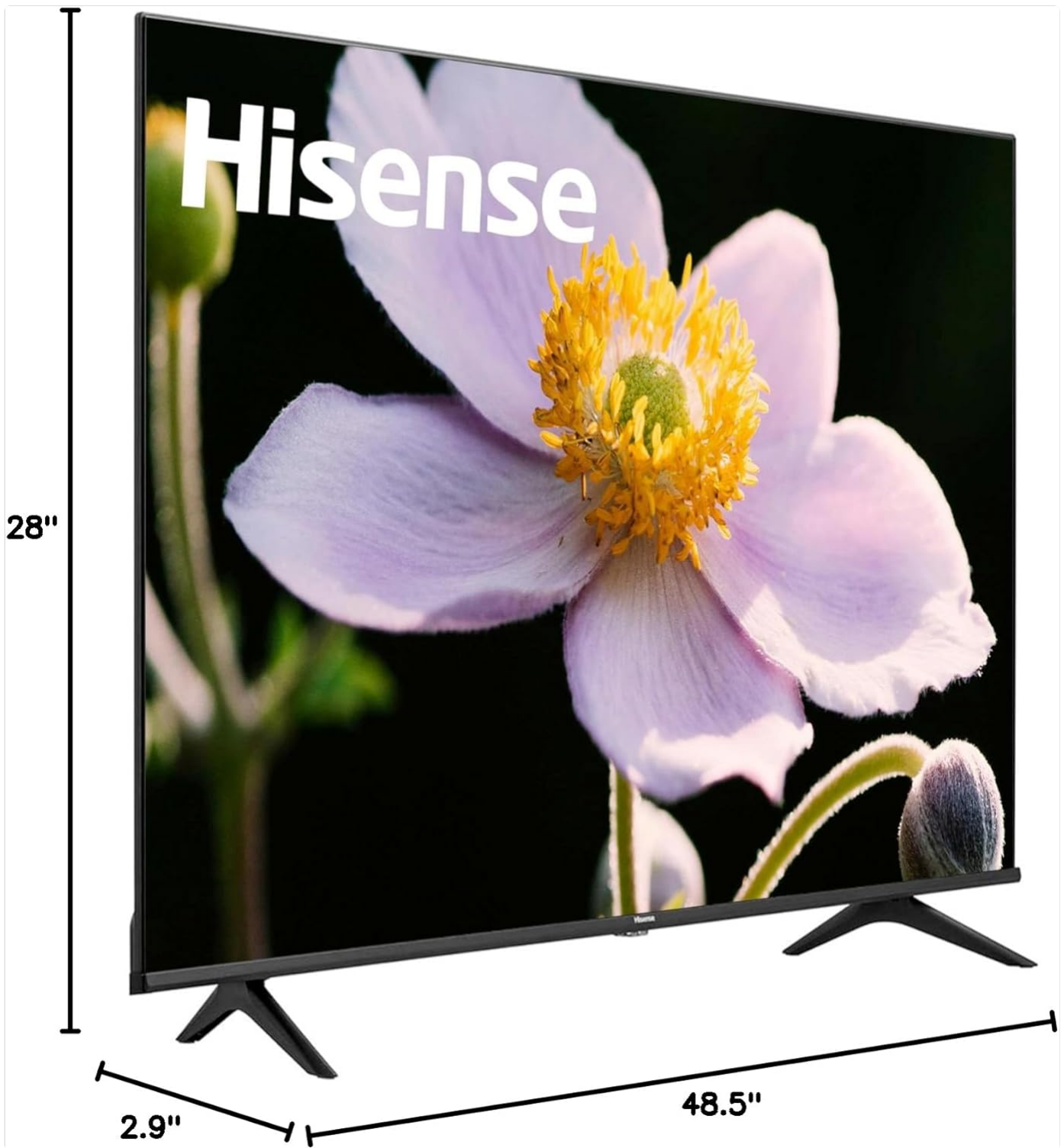
Image: Diagram showing the dimensions of the Hisense 55-inch TV, including height, width, and depth.