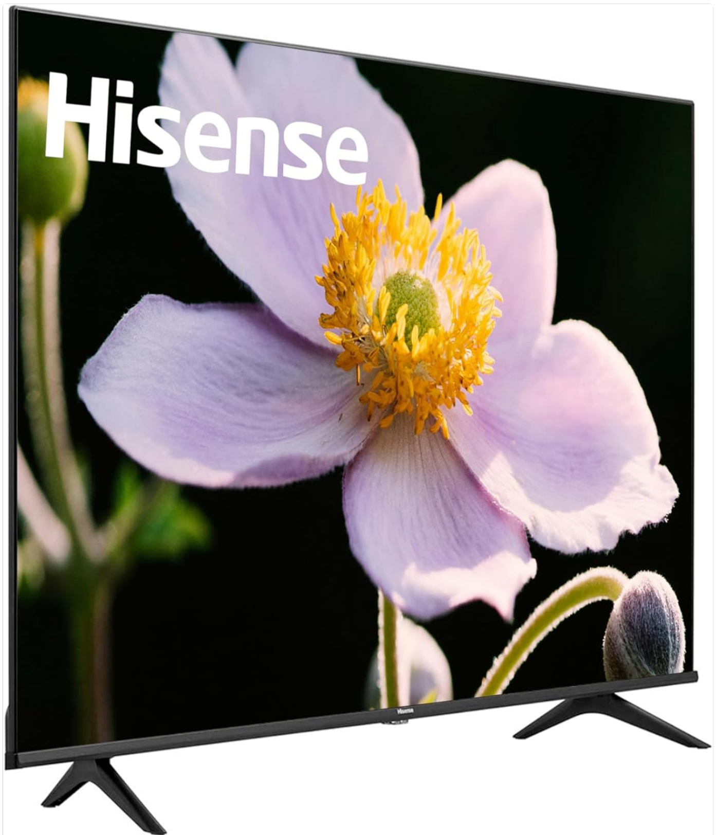
Image: Angled view of the Hisense TV, showing the attached stand legs.