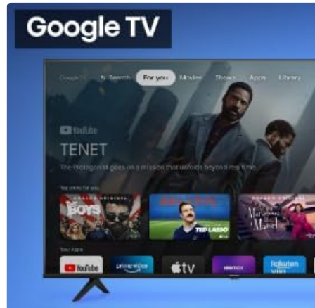
Image: Screenshot of the Google TV interface, showing various streaming app icons and content recommendations.

Your Hisense A6 Series TV comes with Google TV built-in, providing a personalized entertainment experience.