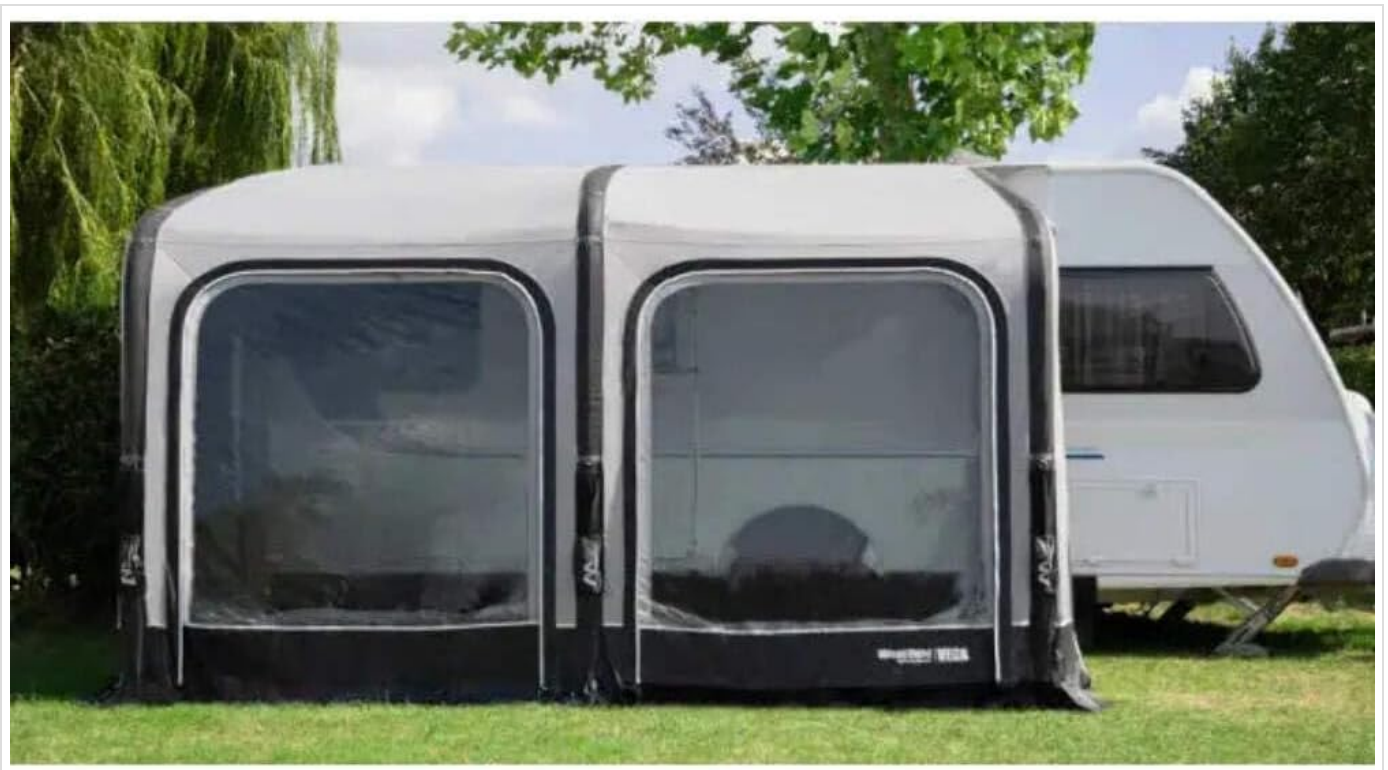
Image: Westfield Vega 375 2.0 awning attached to a caravan, demonstrating a typical setup.