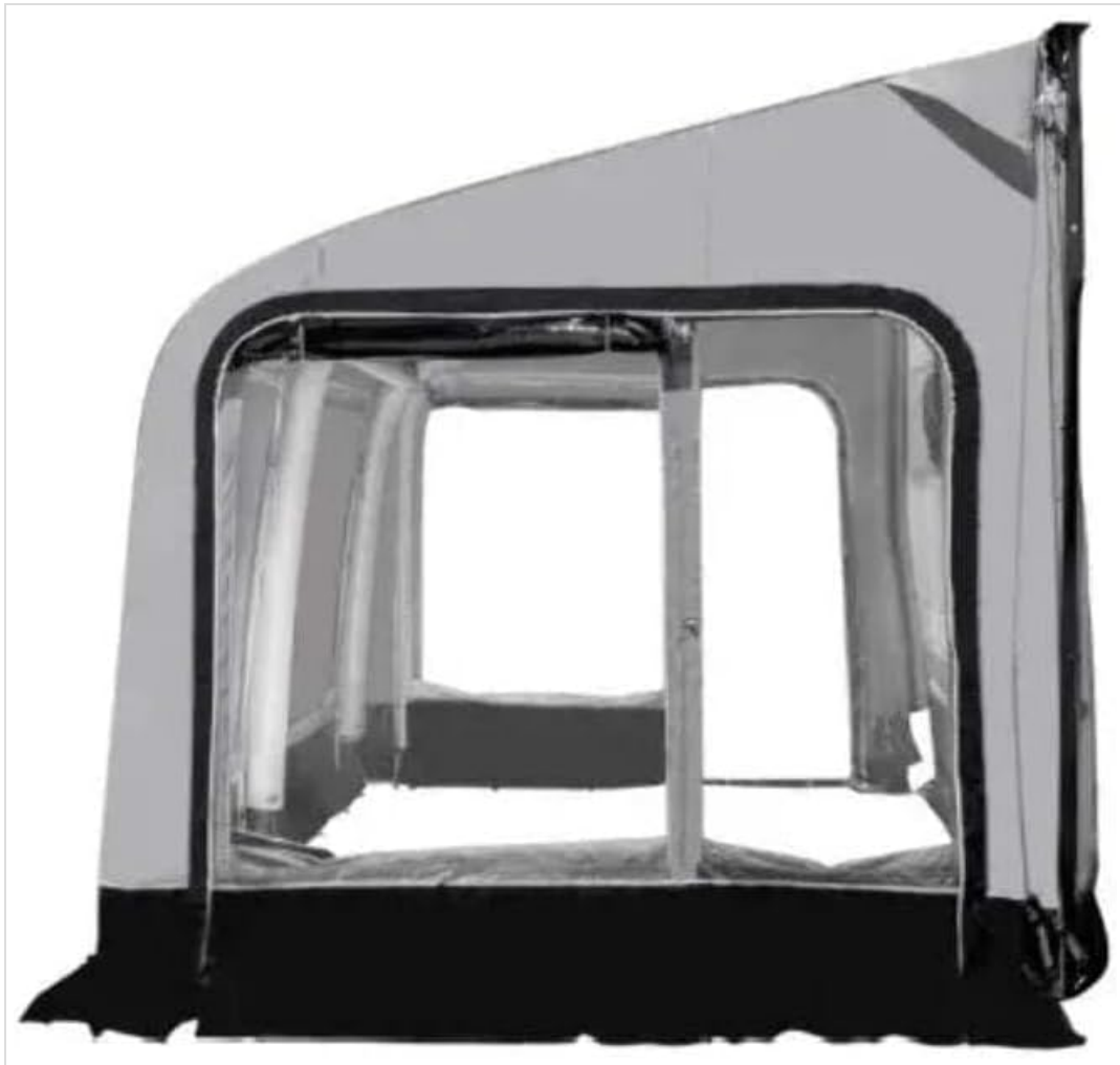
Image: Interior view of the Westfield Vega 375 2.0 awning, showcasing the spaciousness and large windows.