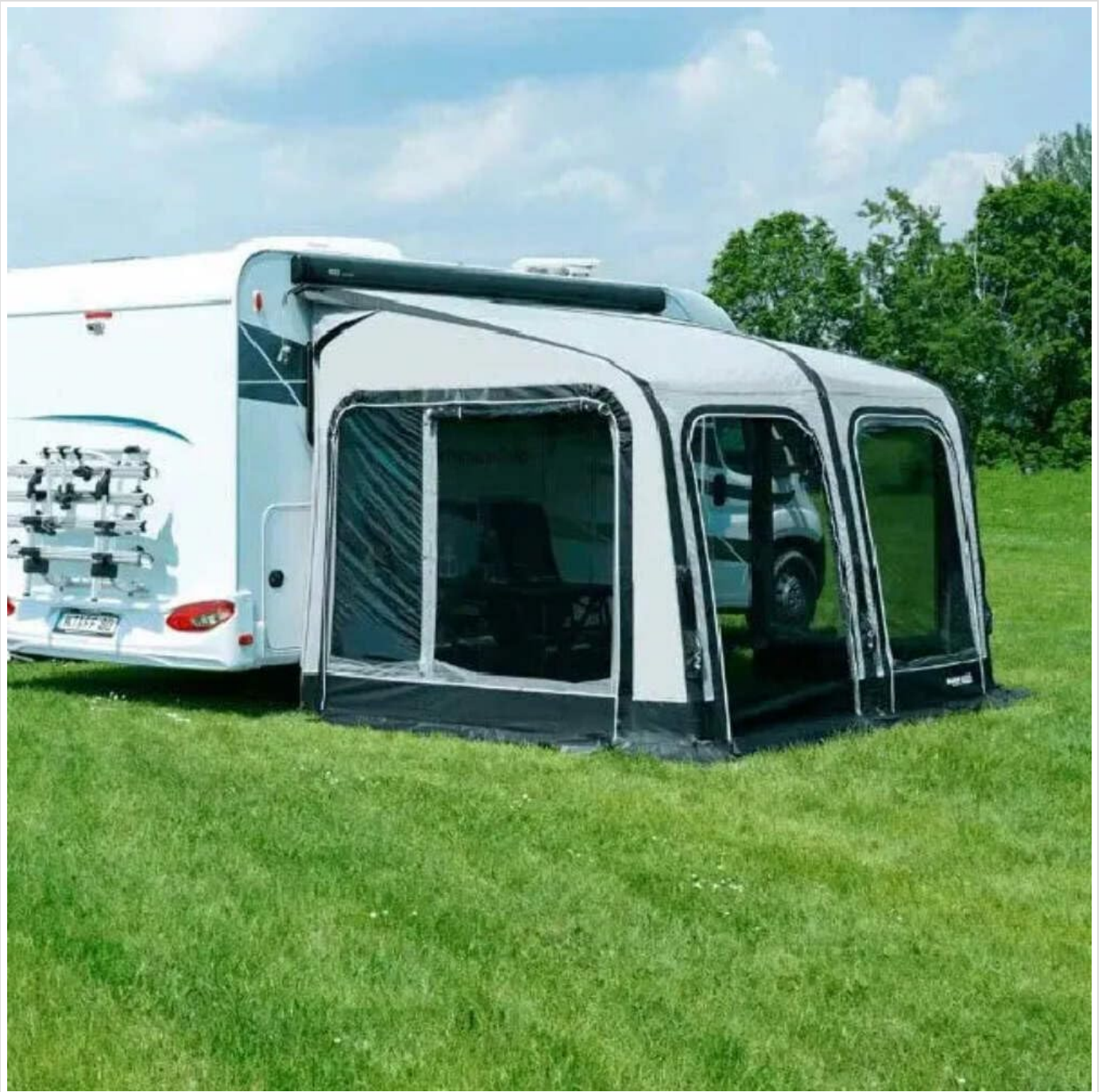
Image: Westfield Vega 375 2.0 awning with front panels open, demonstrating the integrated mosquito nets for ventilation.