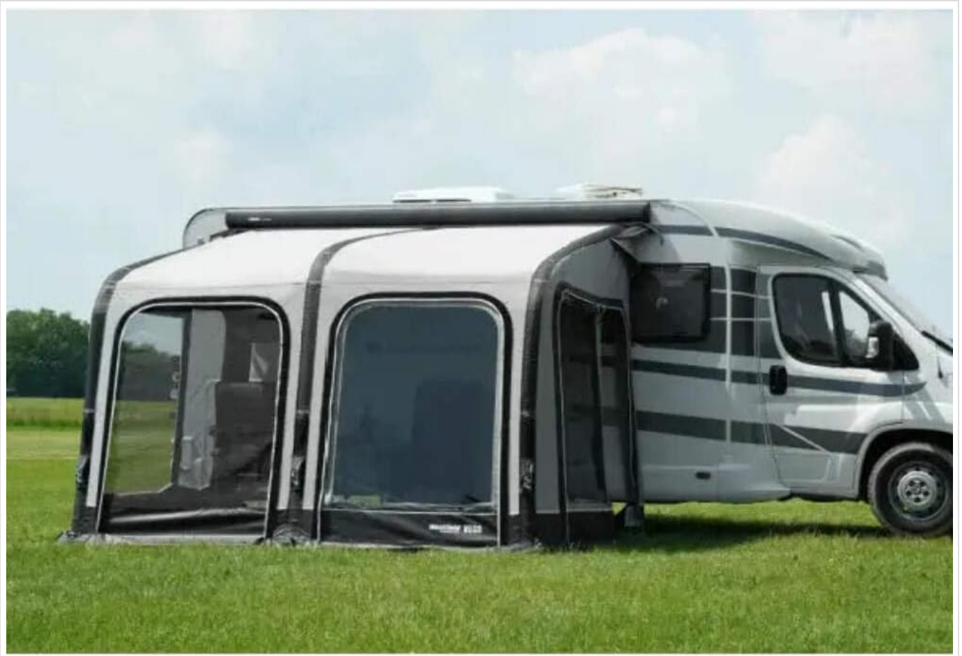
Image: Westfield Vega 375 2.0 awning attached to a motorhome, highlighting its spacious design and compatibility.