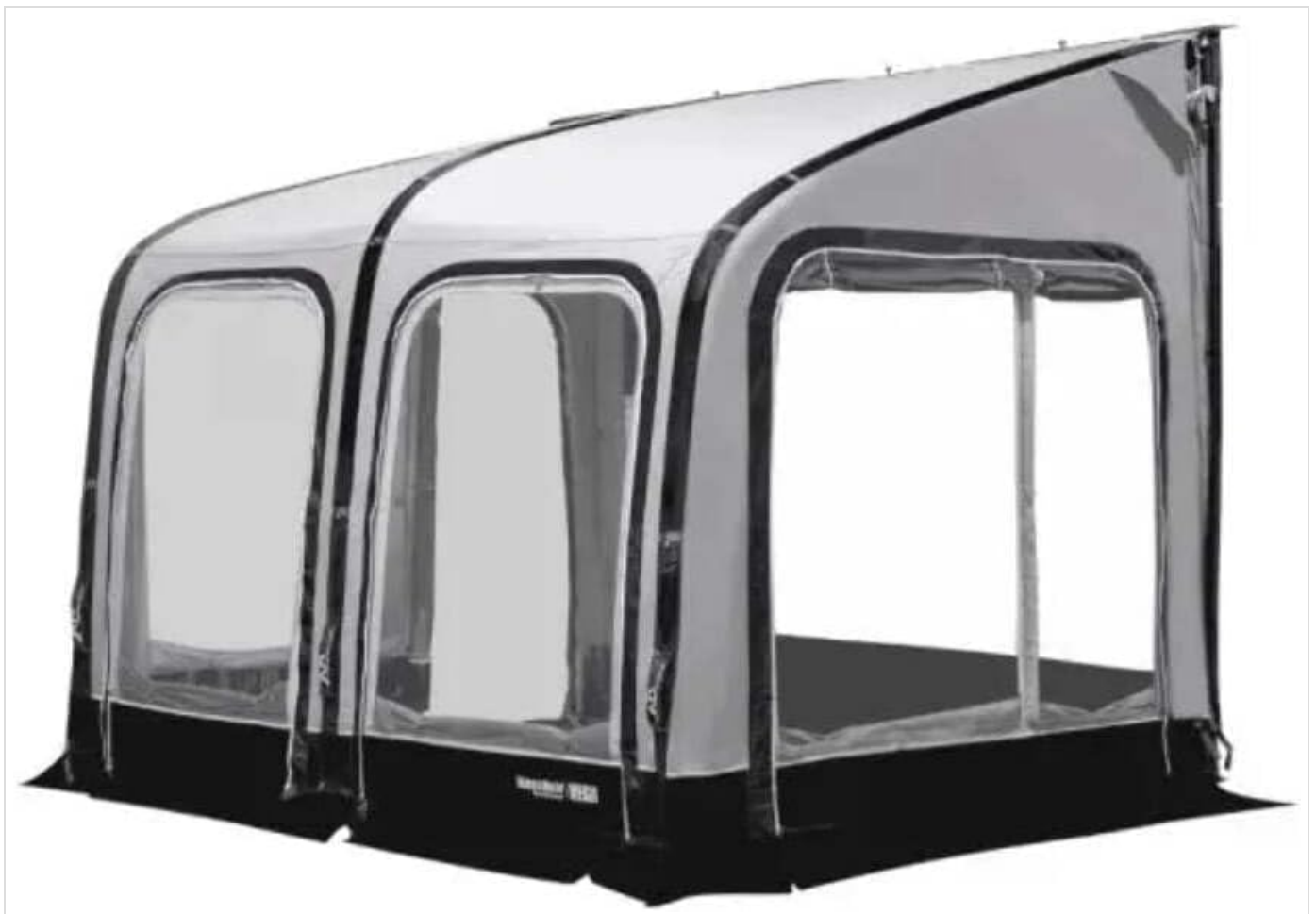
Image: The Westfield Vega 375 2.0 awning structure, showing the inflatable air frame before full attachment.