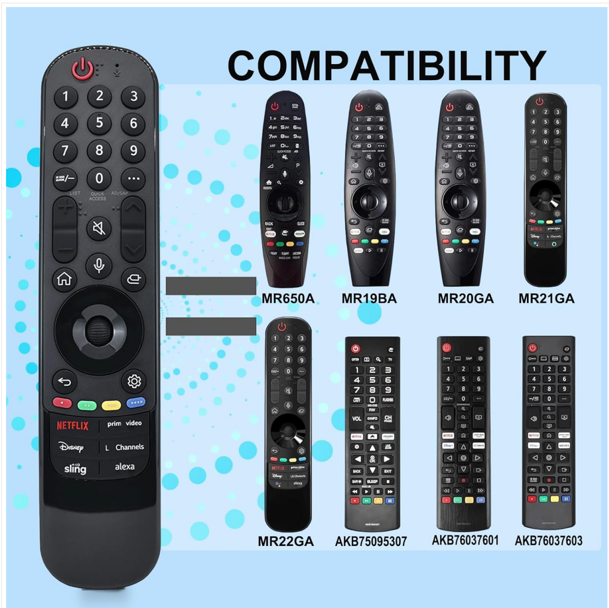
Image 3.1: Visual representation of the MR23GA remote control's compatibility with several LG Magic Remote models.