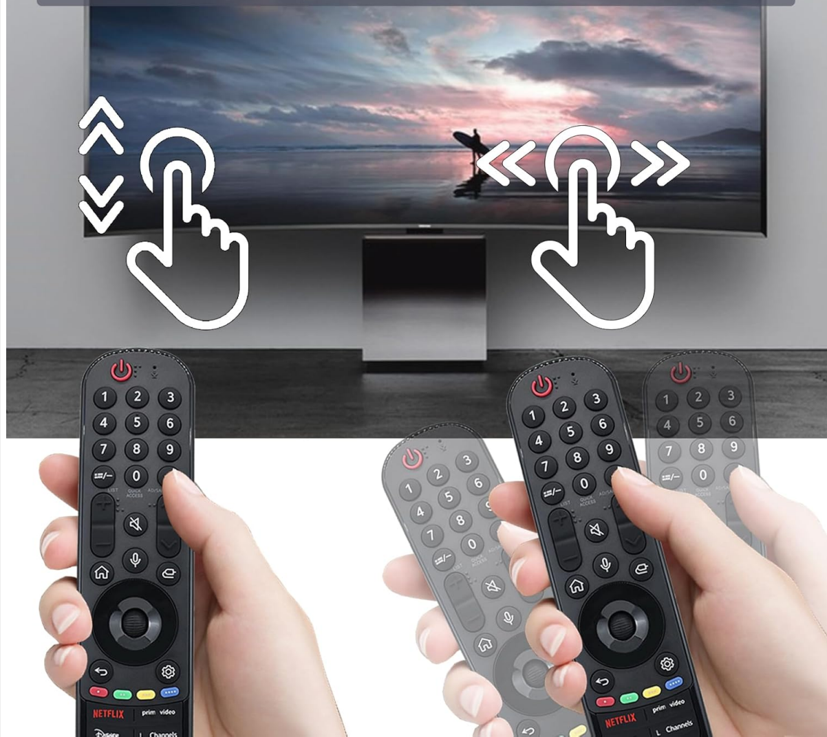
Image 5.2: Depiction of the cursor, click, and scroll functions of the remote control on a TV screen.