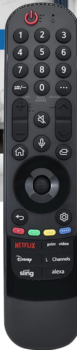
Image 5.3: Close-up of the MR23GA remote control highlighting the six dedicated shortcut buttons for various streaming services and functions.