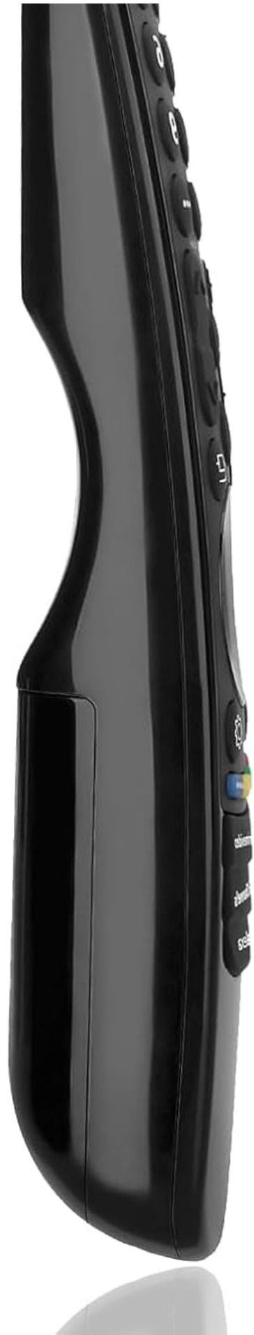
Image 2.1: Front and side view of the MR23GA Magic Remote Control, showcasing its ergonomic design and button layout.