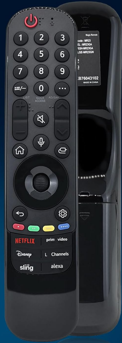
Image 2.2: The MR23GA remote control highlighting its sensitive and durable build, TV control capabilities, quick response, and simple setup.