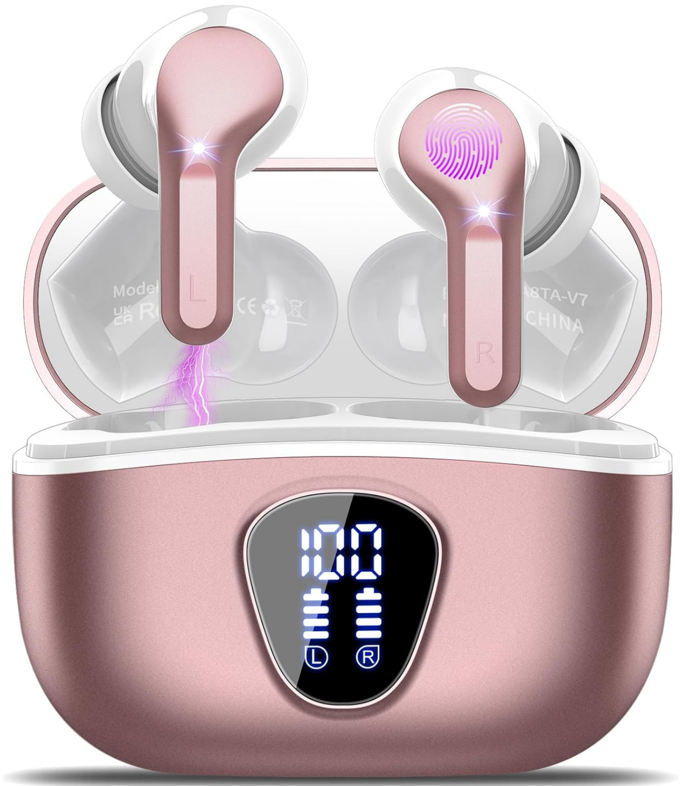
Image: The BESNOOW I53 Wireless Earbuds in their rose gold charging case, displaying the LED battery indicator.