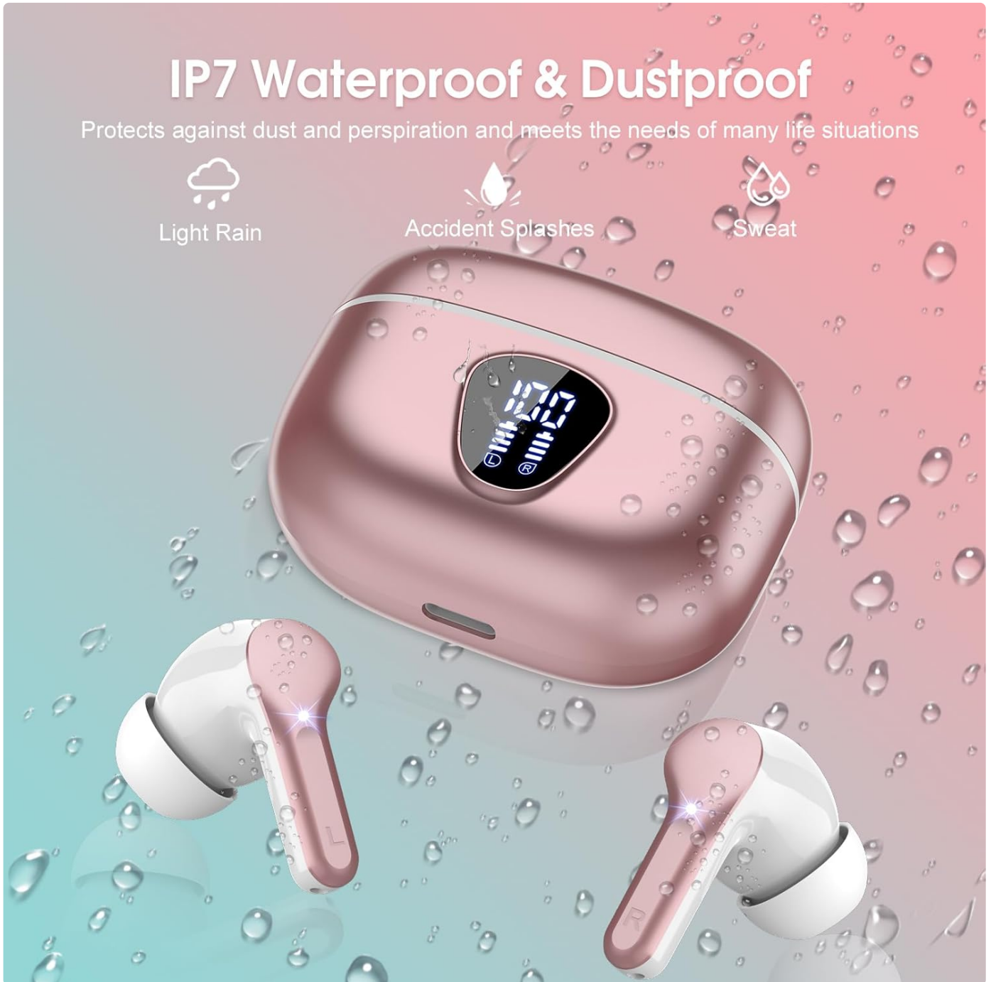
Image: The BESNOOW I53 earbuds and charging case shown with water droplets, illustrating their IP7 waterproof and dustproof capabilities against light rain, splashes, and sweat.