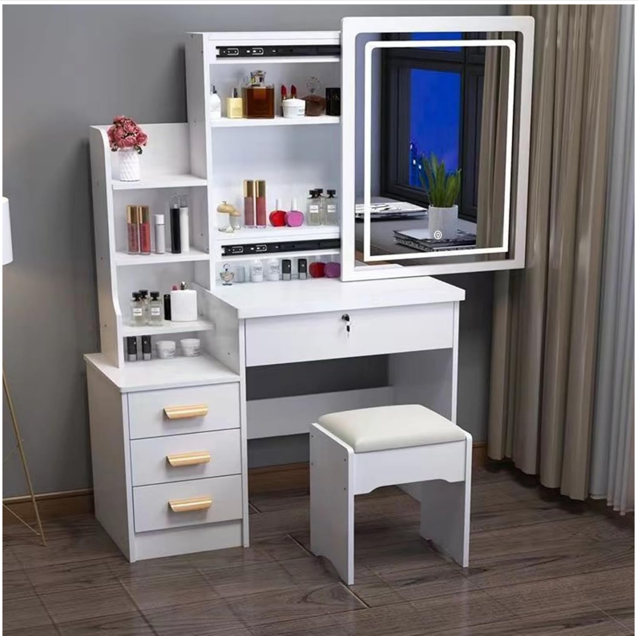
Figure 3: Vanity Desk with Sliding Mirror and Storage.