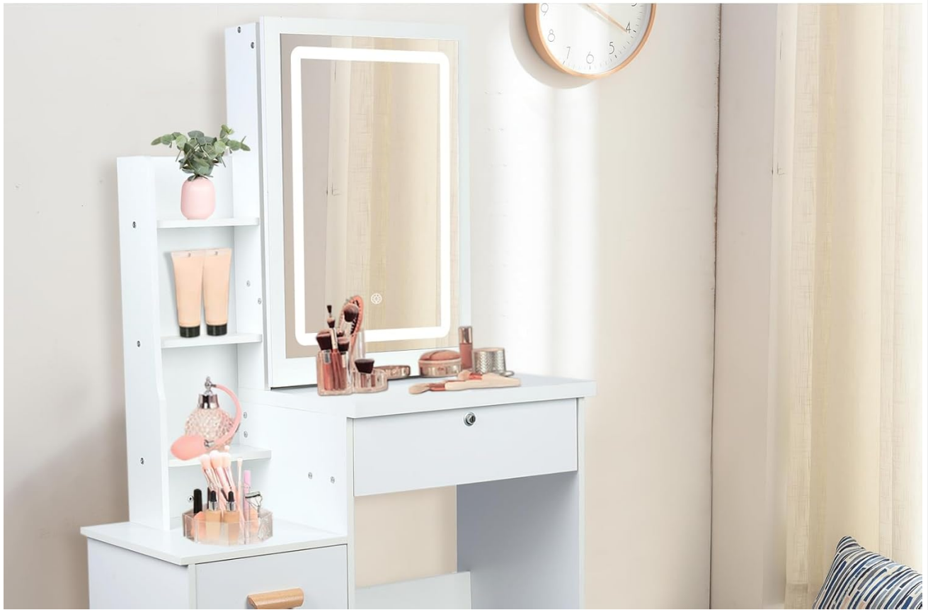
Figure 4: LED Mirror with 3 Color Temperature Options.