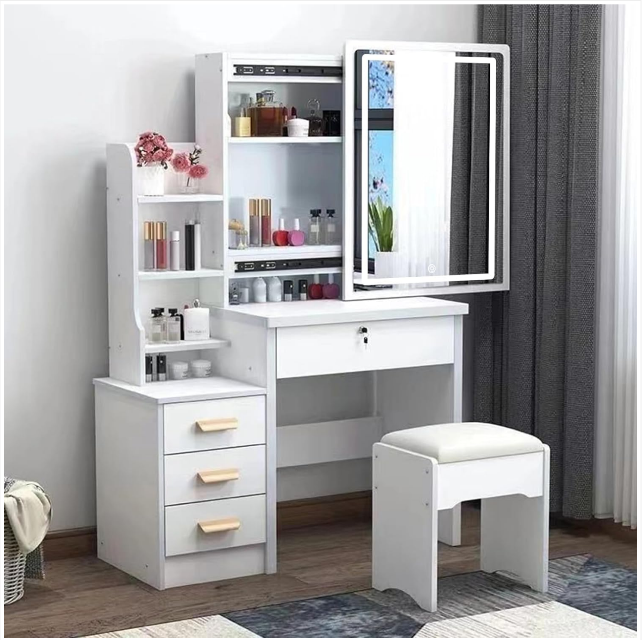
Figure 2: Assembled Vanity Desk with LED Lighted Mirror.