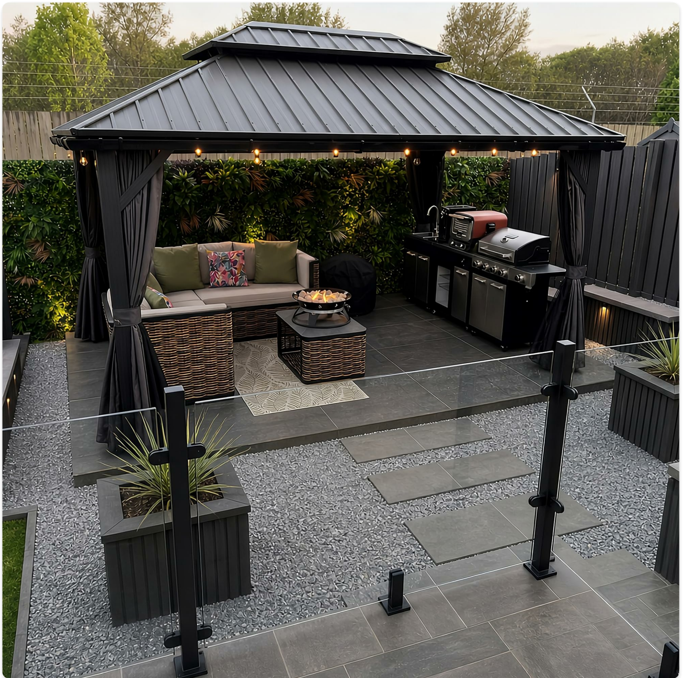
Image: The PURPLE LEAF 10' x 14' Outdoor Gazebo, showcasing its dual-layer roof and curtains, set up in a patio environment.