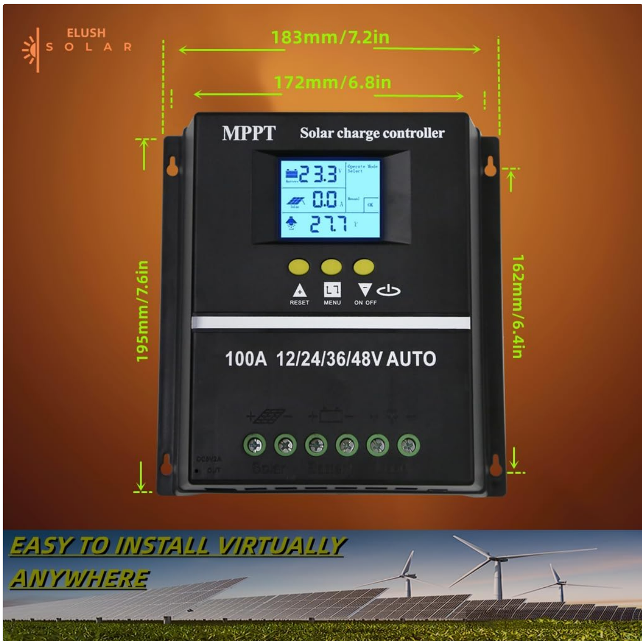
Figure 4.2: Product dimensions for installation planning.