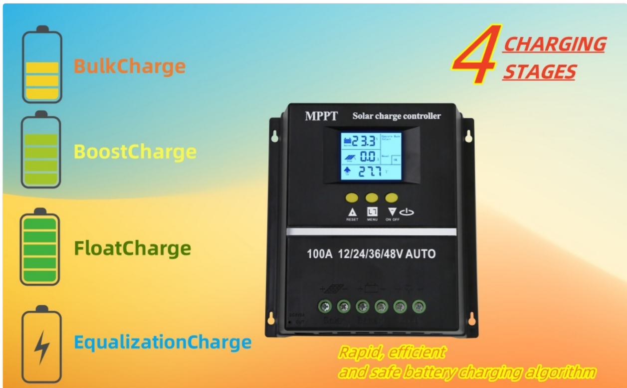
Figure 8.1: Detailed specifications of the 100A model.