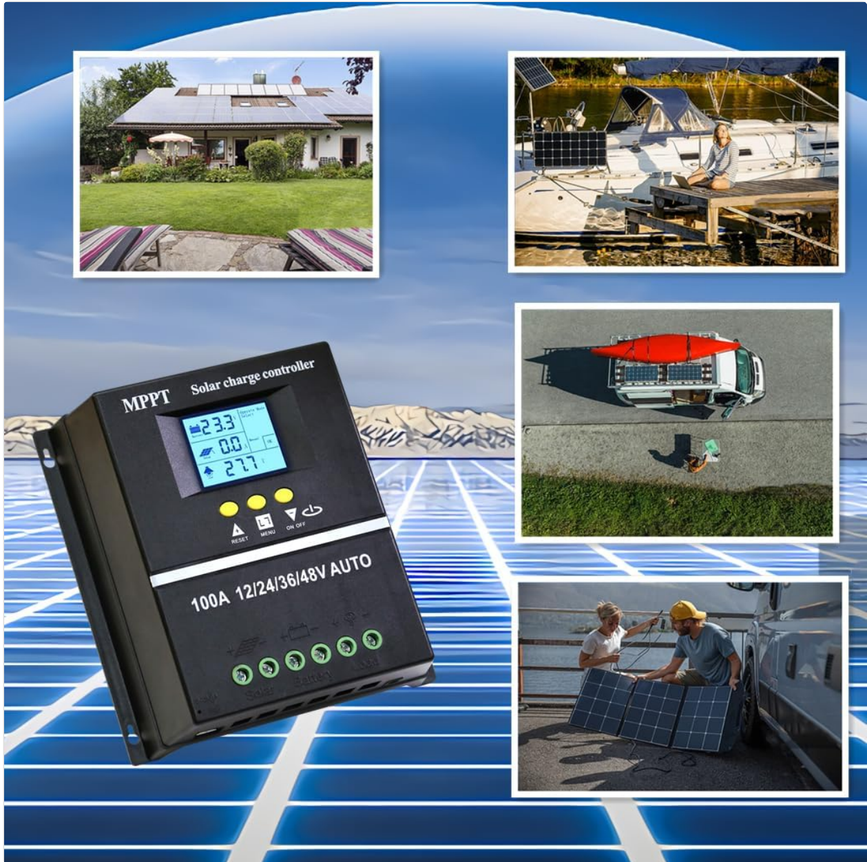
Figure 5.3: Diverse application scenarios for the solar charge controller.