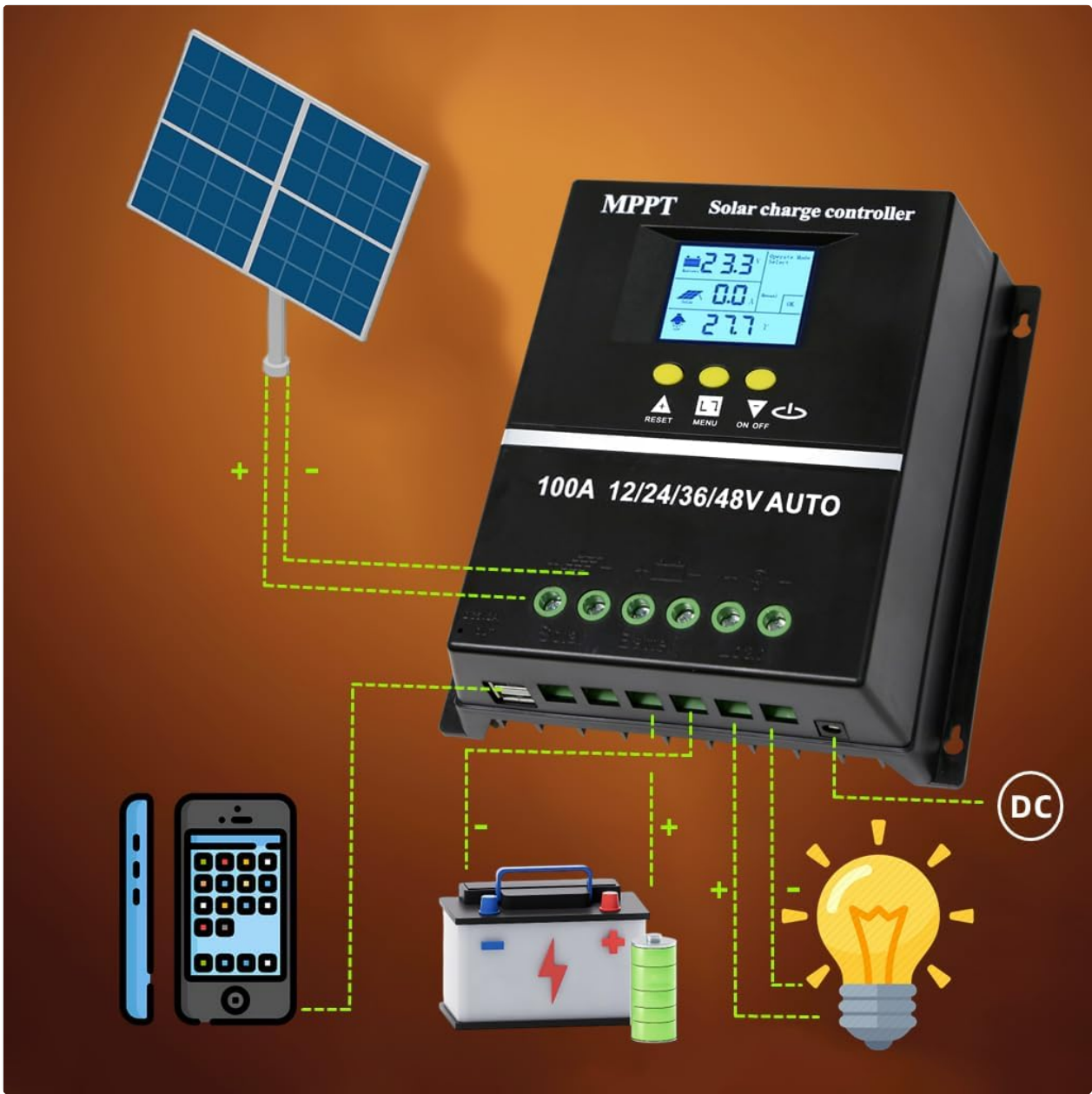
Figure 4.1: Typical connection diagram for the solar charge controller.