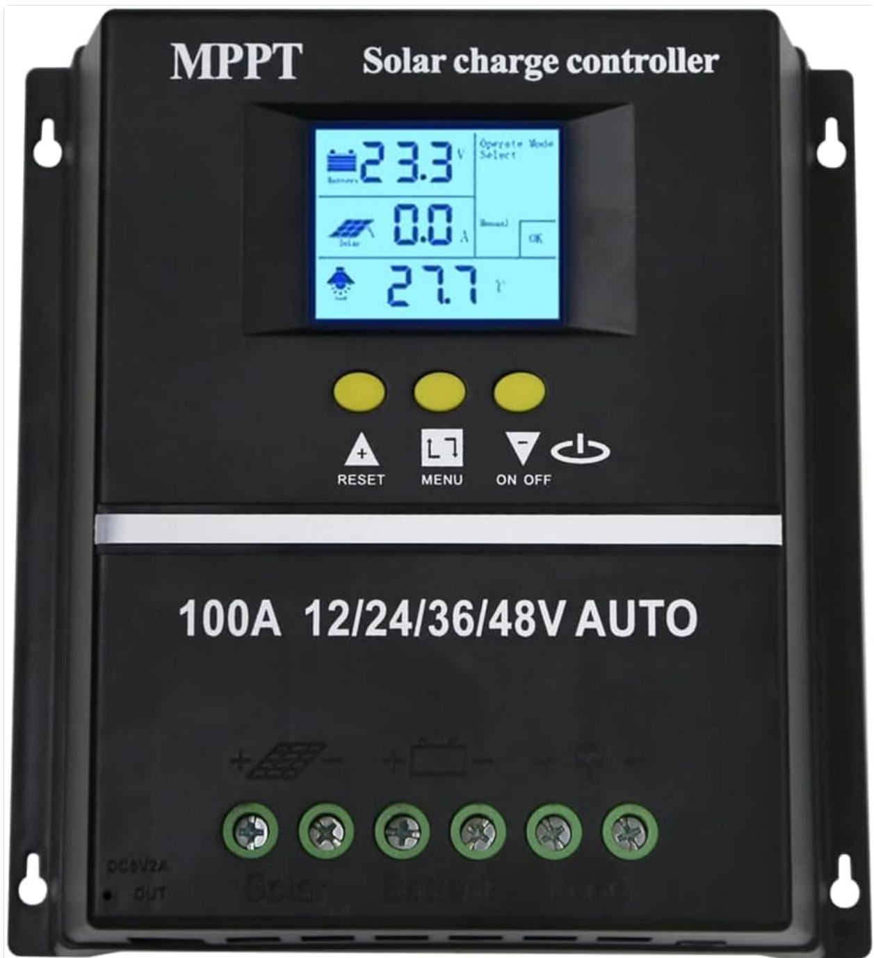
Figure 1.1: Front view of the ELUSH 100A MPPT Solar Charge Controller.