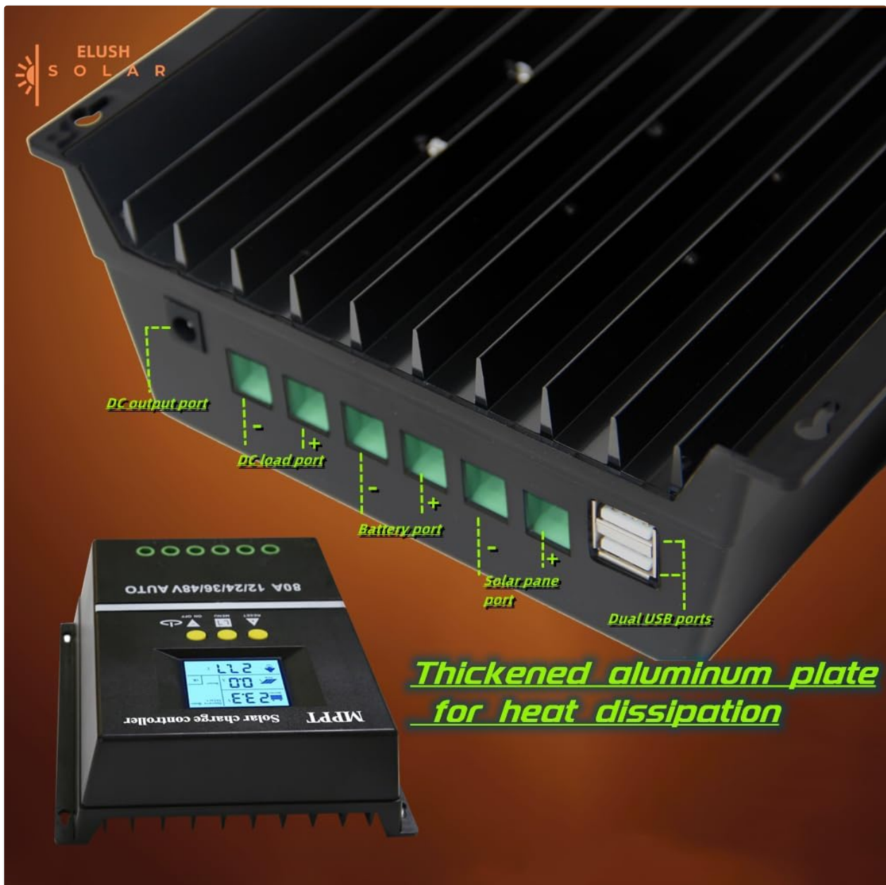
Figure 3.2: Detailed view of connection ports and heat dissipation design.