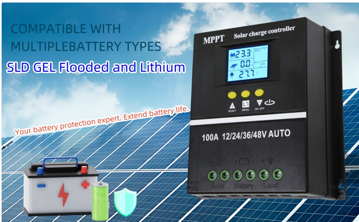
Figure 5.2: Compatible battery types.

The controller is compatible with Sealed, GEL, Flooded, and LifePO4 batteries. Ensure you select the correct battery type in the settings for optimal charging and battery longevity.