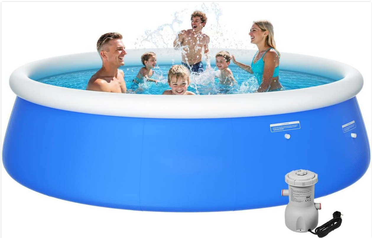
Image: The Sunrio 12' x 33" Round Inflatable Pool in use, showing a family enjoying the water, with the included filter pump positioned next to the pool.