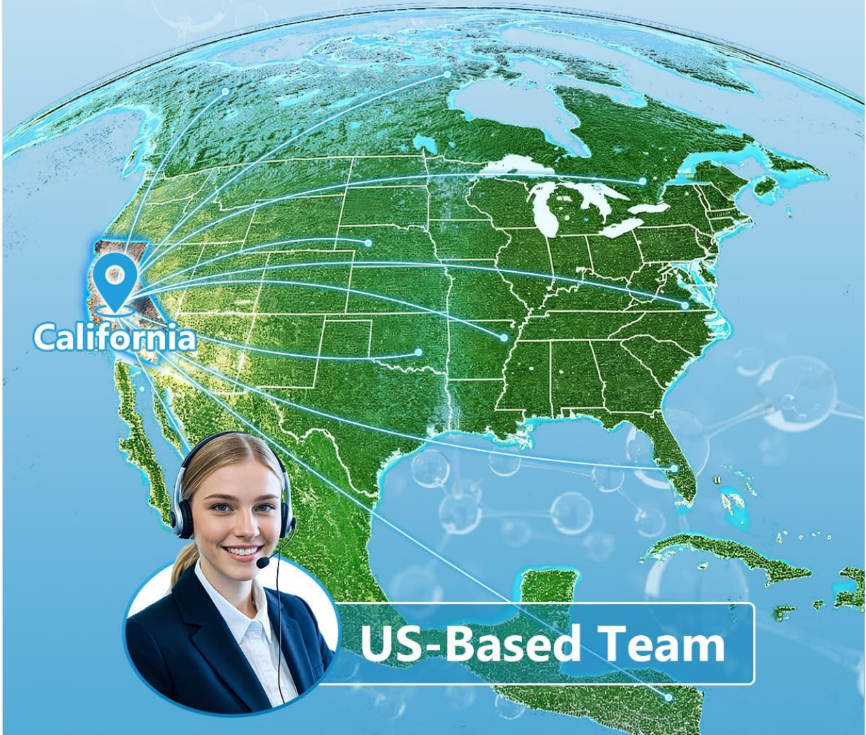
Image: Sunrio's commitment to customer support, highlighting their US-based team and customer-friendly approach.