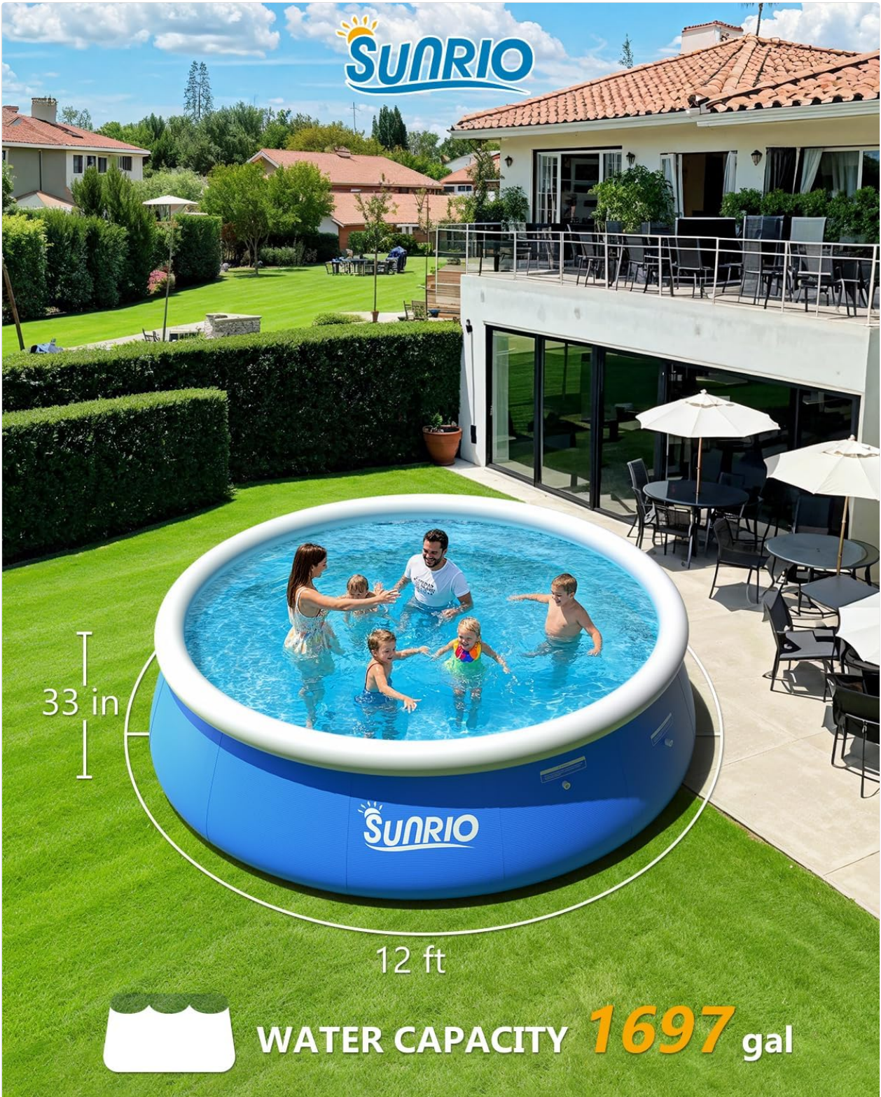
Image: A visual representation of the pool's dimensions (12 ft diameter, 33 inches height) and its water capacity (1697 gallons).