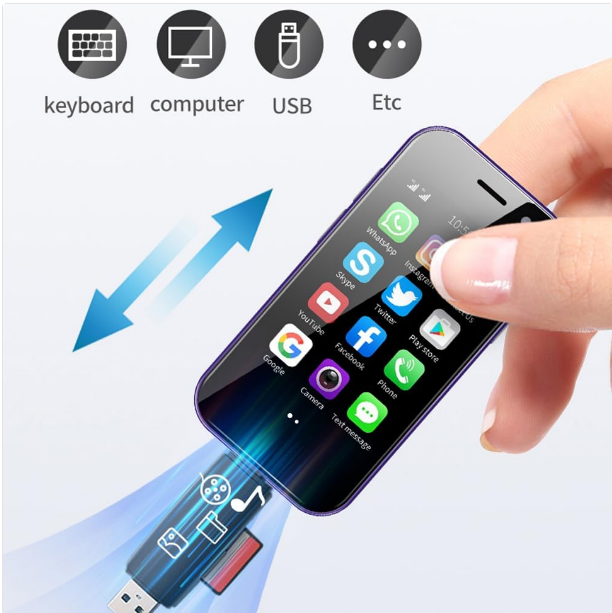
Image: The mini smartphone demonstrating its USB connectivity and compatibility with external devices like keyboards and computers.