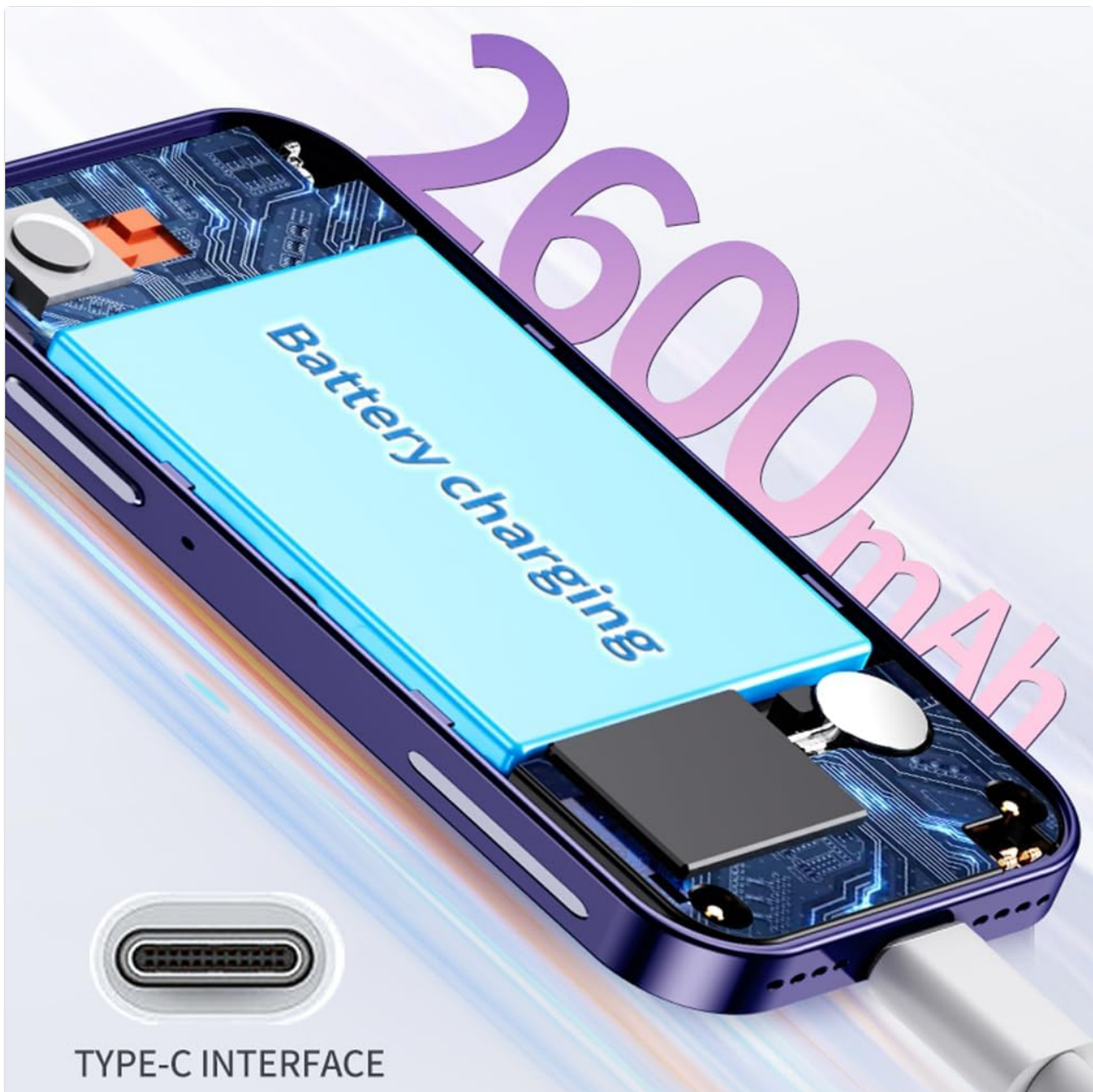
Image: An internal view highlighting the 2600mAh battery and the Type-C charging port, indicating the phone's power capabilities.