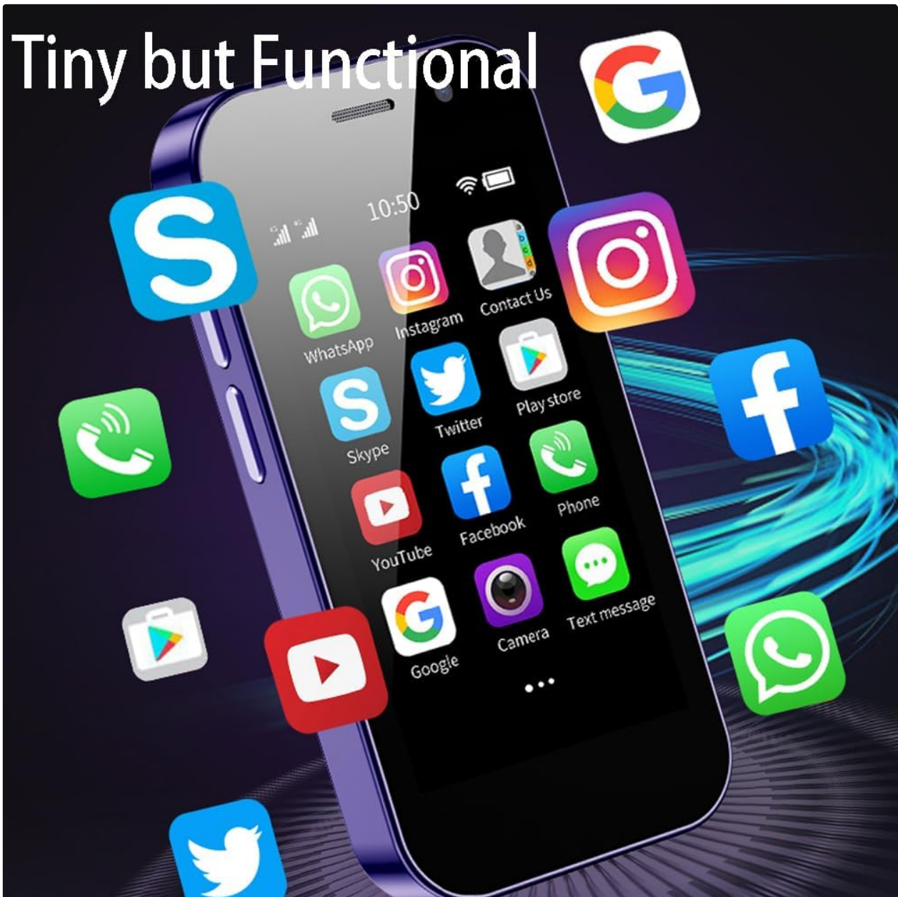
Image: A visual representation of the phone's capability to run multiple applications, highlighting its compact size and full functionality.