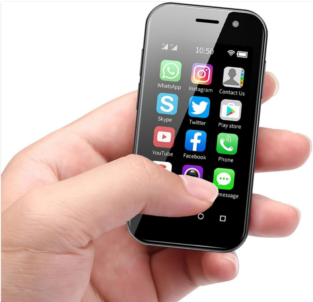
Image: A hand demonstrating the compact size of the mini smartphone, with its screen showing common application icons.