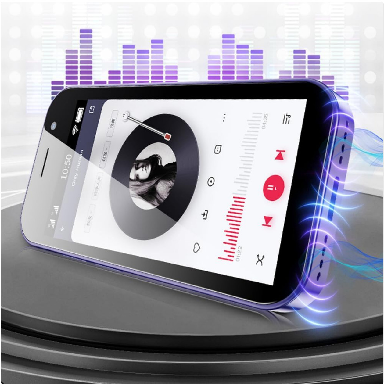
Image: The mini smartphone showcasing its audio playback capabilities, with a music player interface visible on the screen.