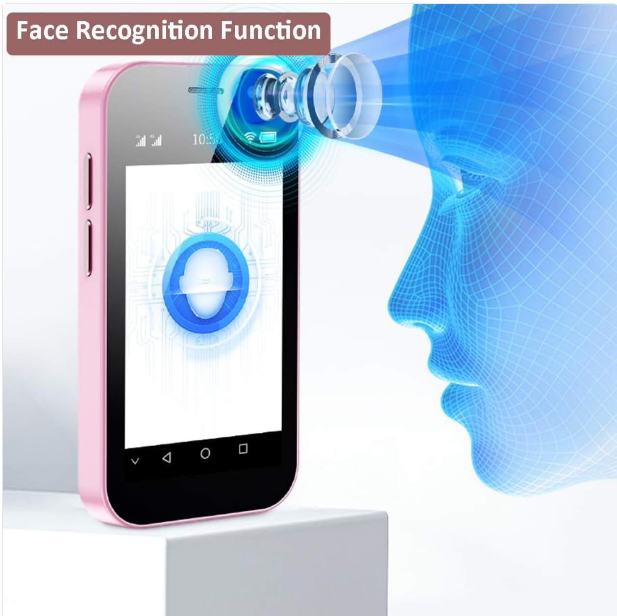
Image: A visual explanation of the phone's face recognition security feature, showing how it scans and identifies the user.