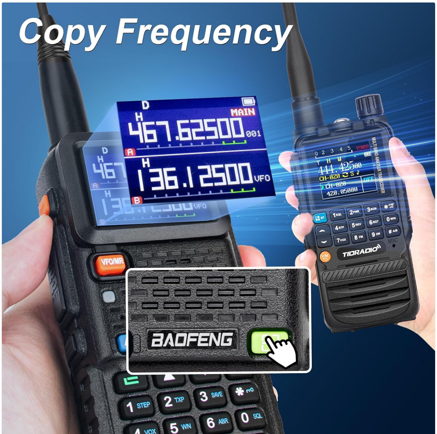
Image: Visual representation of the one-key frequency copy function on the BAOFENG 5RM, showing how it simplifies channel matching.