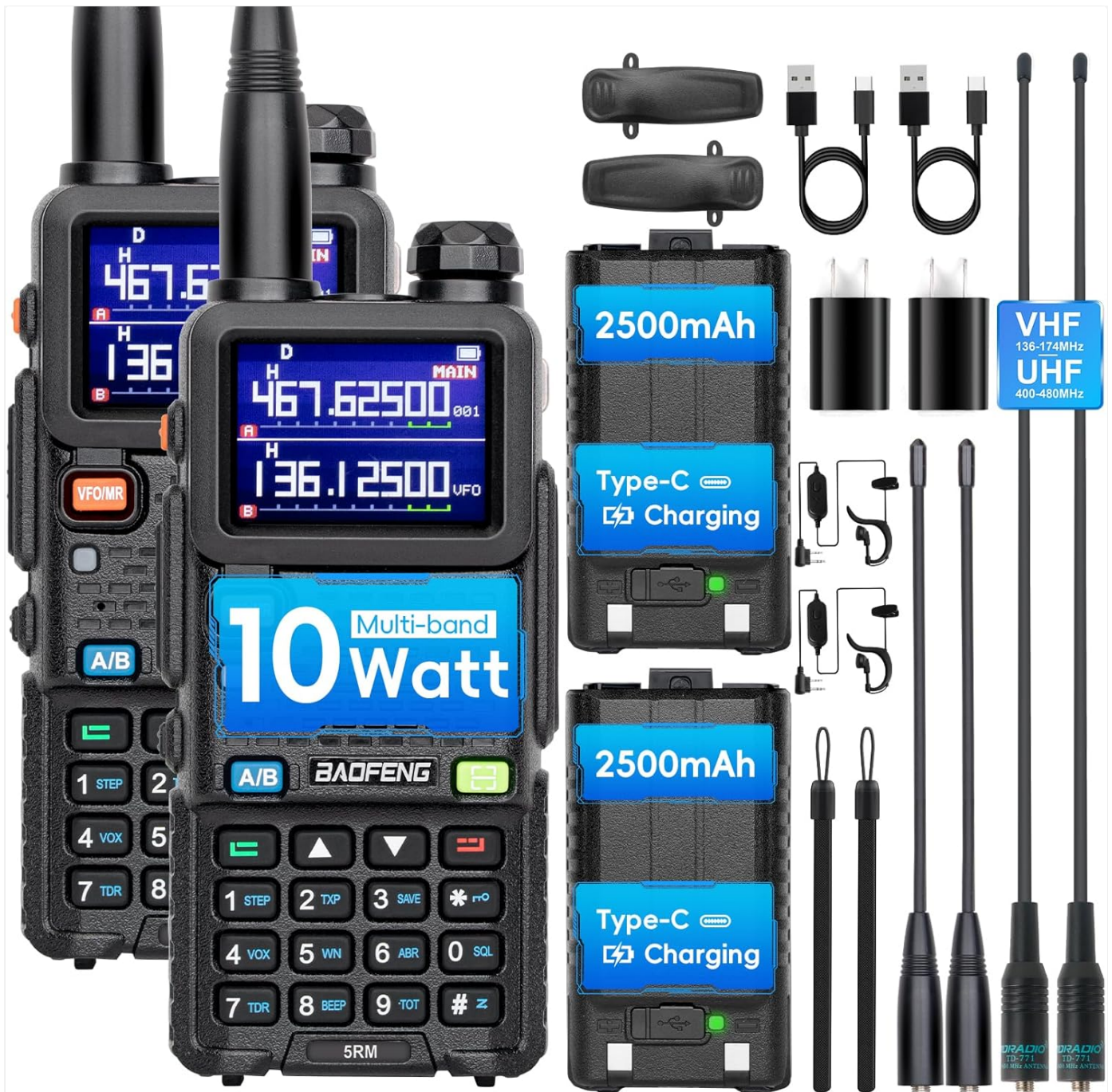
Image: The BAOFENG 5RM Ham Radio shown with its included accessories, highlighting its compact design and comprehensive kit.