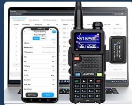
Image: Illustration of the various programming methods supported by the BAOFENG 5RM, including CHIRP, CPS software, and wireless programming via app.