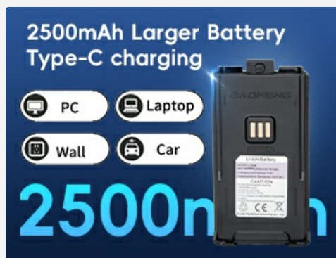
Image: The 2500mAh battery for the BAOFENG 5RM, illustrating its Type-C charging capability and various charging methods.