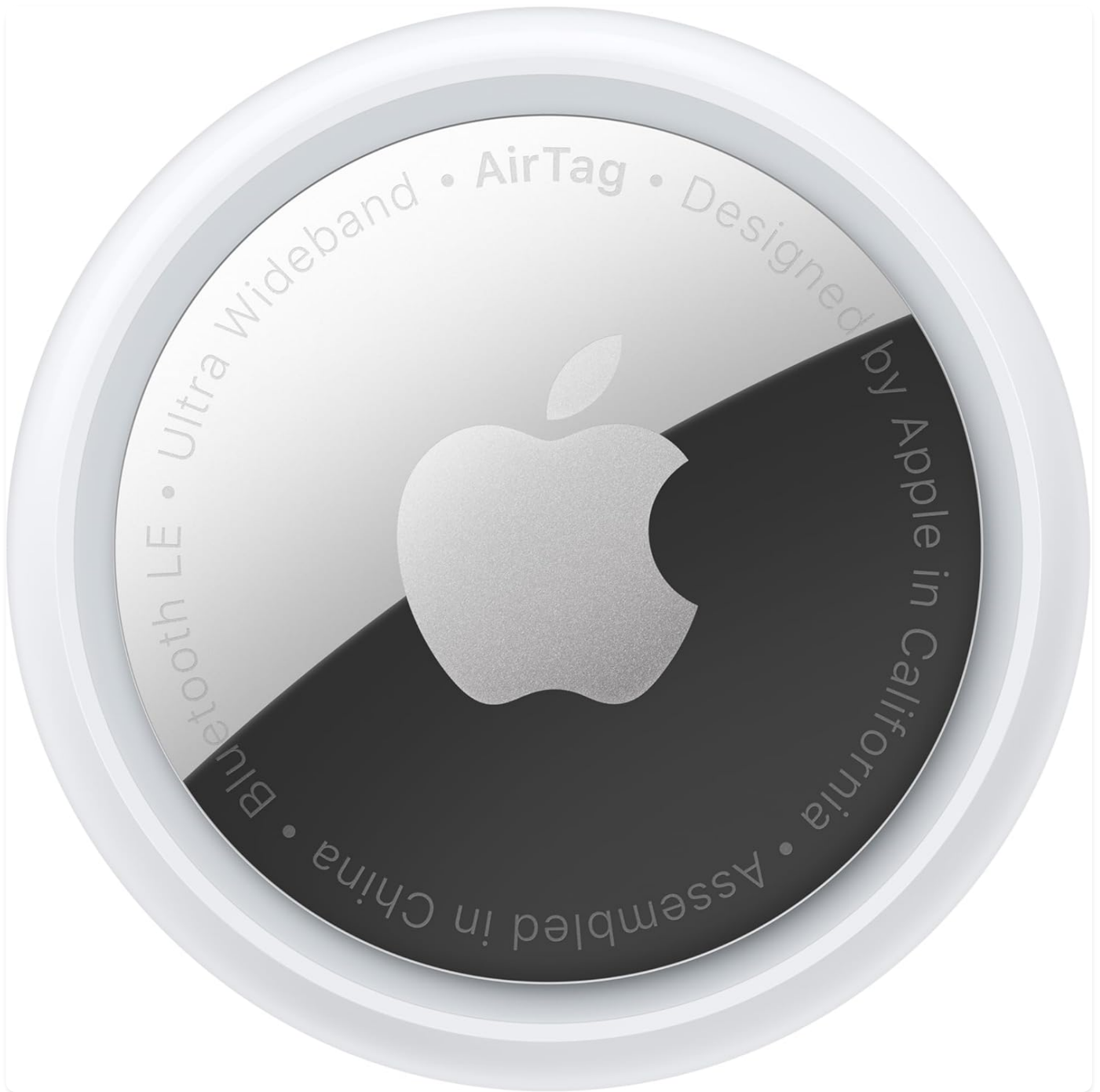
Image: Front view of the Apple AirTag, showcasing its compact, circular design with the Apple logo.