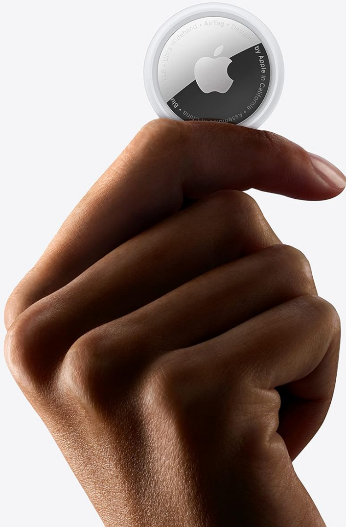
Image: A hand holding an Apple AirTag, demonstrating its small and portable size.