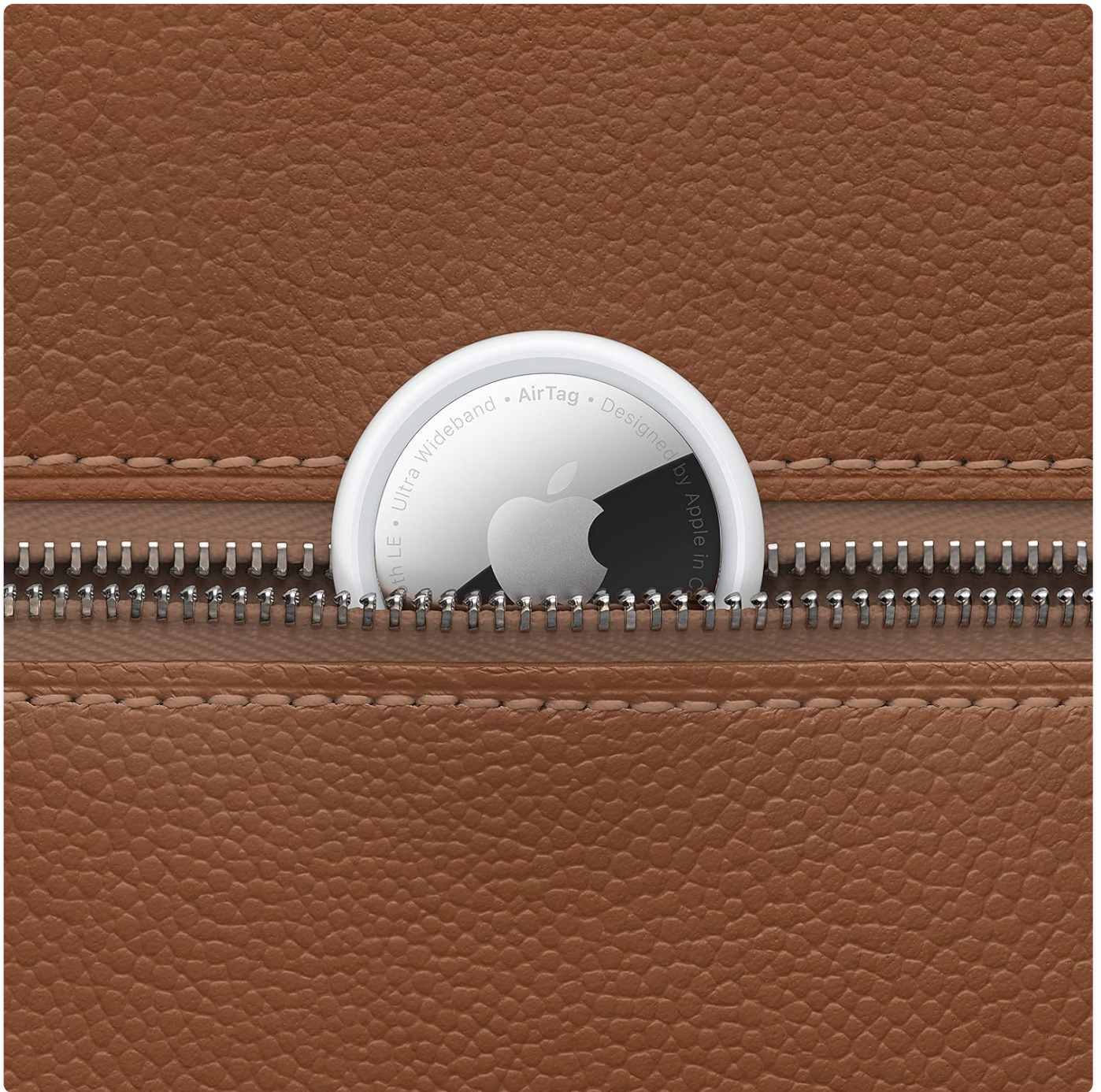
Image: An Apple AirTag peeking out from a partially unzipped brown leather bag, illustrating how it can be discreetly carried with personal items.