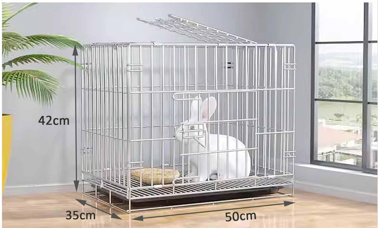
Image 2: The assembled cage with a rabbit, illustrating the overall dimensions and the various accessories included in the package, such as the mesh foot mat, water bowl, and the main pull-out tray.