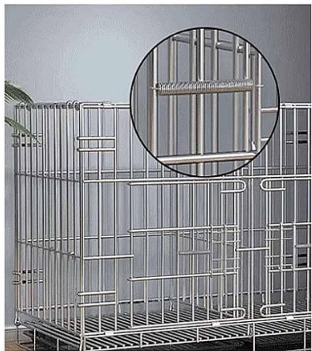
Image 3: Detailed views of the cage construction, emphasizing the thick, strong, and wear-resistant wire material, along with the high-quality, environmentally friendly lacquer coating that ensures durability and safety.