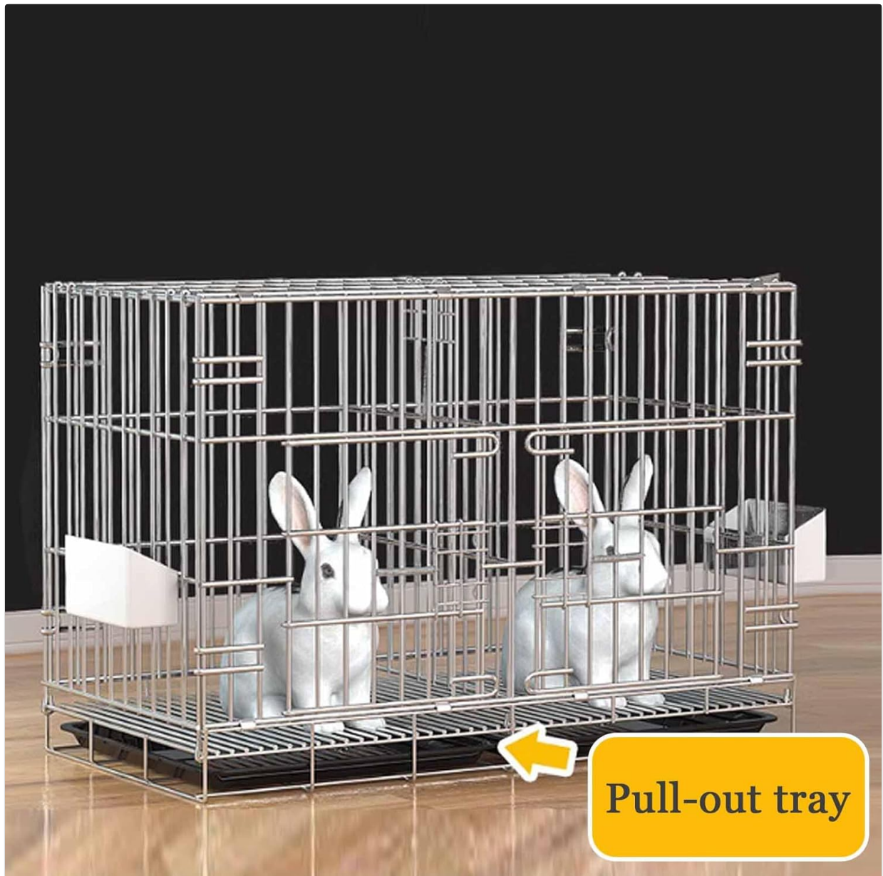
Image 4: Demonstration of the convenient pull-out tray feature, which allows for easy removal and cleaning of pet waste without disturbing the animal inside the cage.