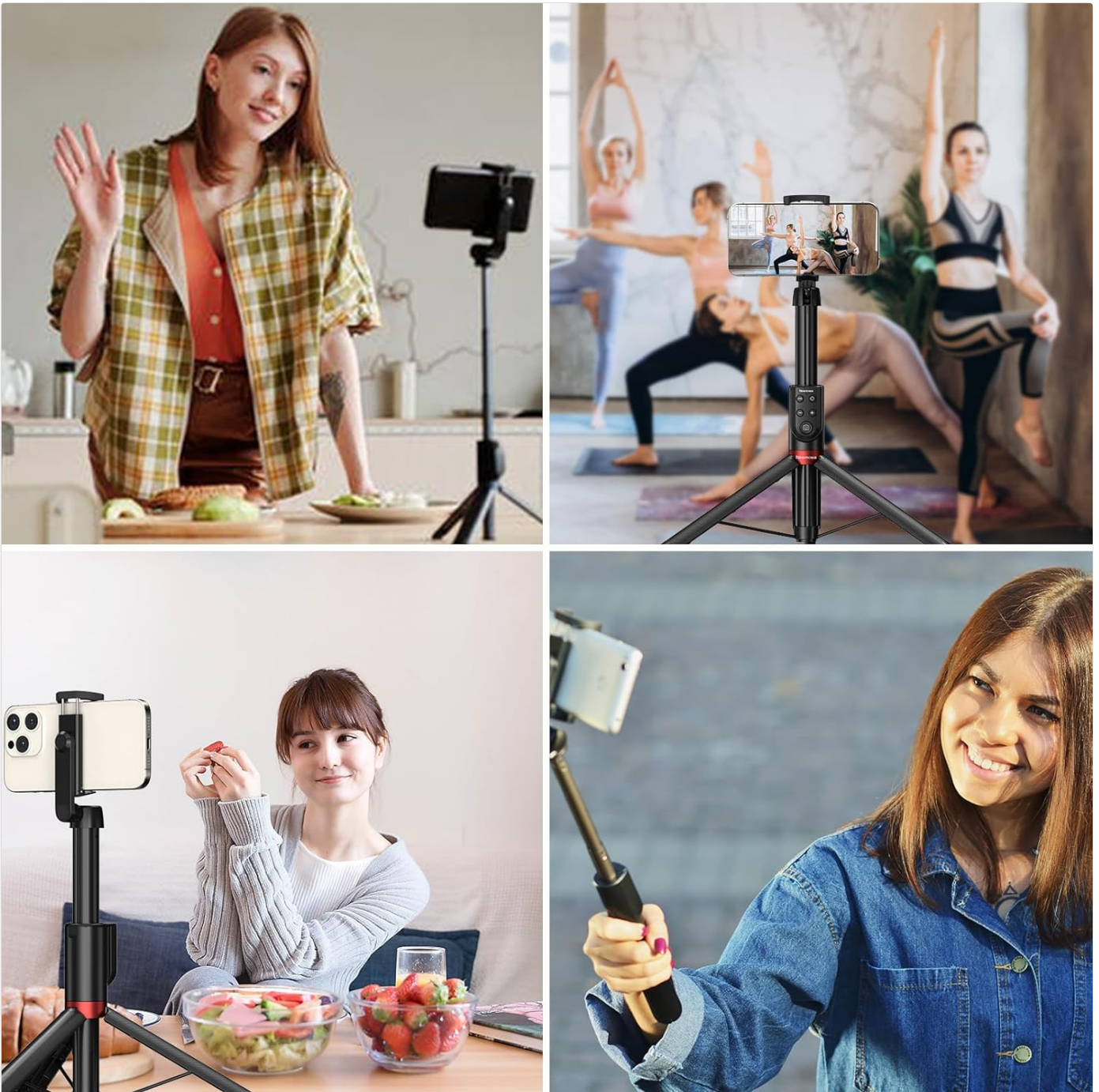
Figure 2: The selfie stick can be extended from 9.3 inches (folded) to 51.2 inches (max height).