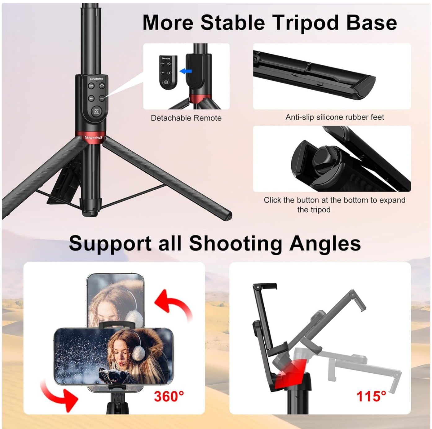
Figure 5: The remote can be detached for use up to 15 meters away.

Your browser does not support the video tag.