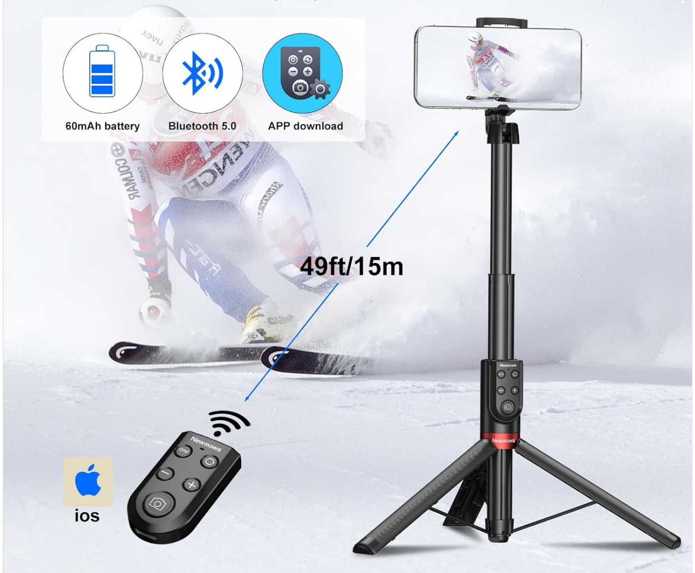
Figure 3: Designed for iPhone, compatible with iPhone 11 and above (iOS 15+). The unique remote shutter allows for photo, video, zoom, and lens switching.

Remote range up to 49ft enables you to take photograph or vlog at your own will