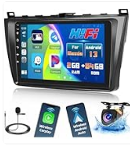
Image: A visual representation of the Roinvoo car stereo unit, its custom frame for Mazda 5, and all included accessories such as power cables, USB cables, GPS antenna, microphone, and backup camera.