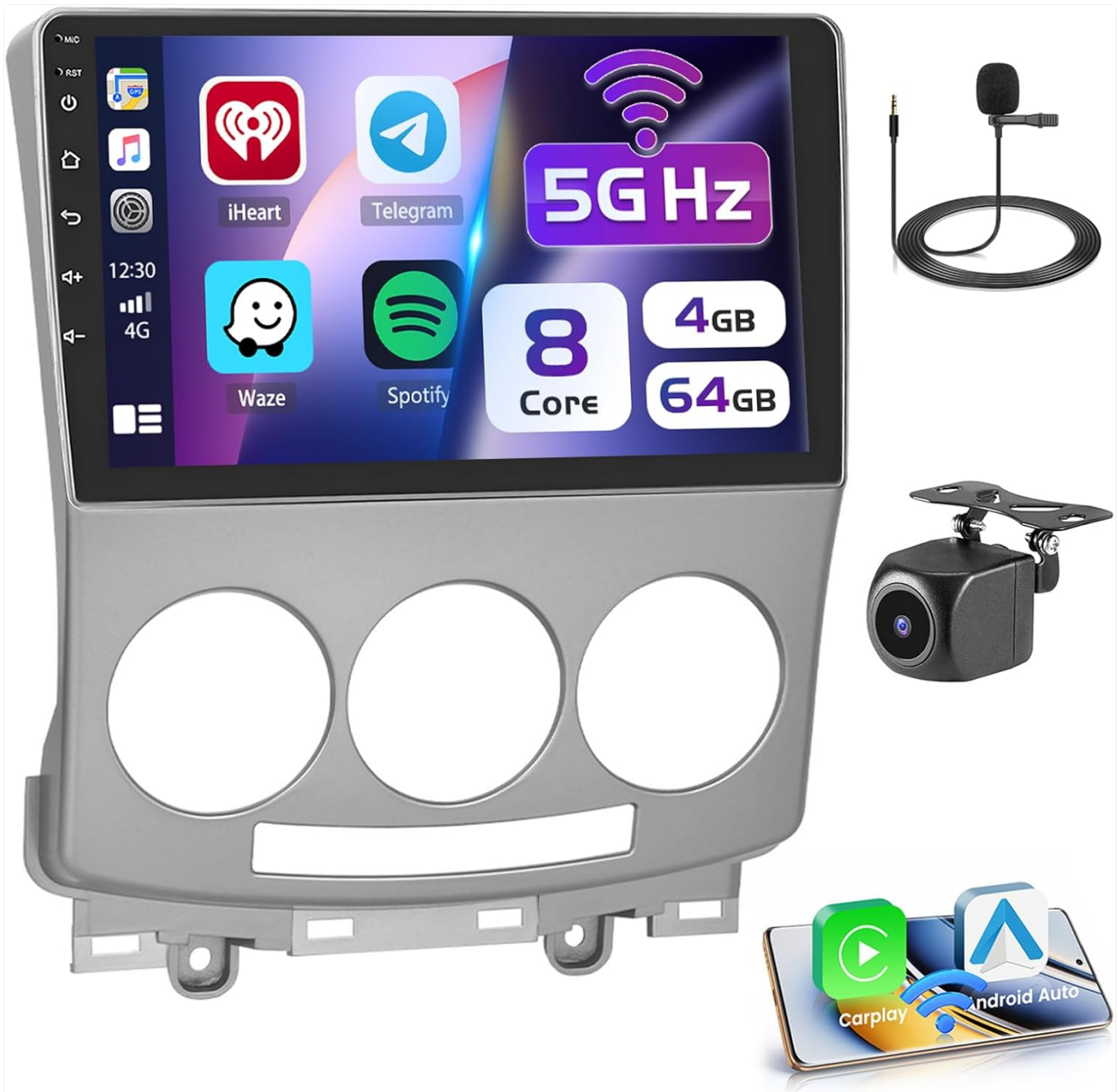
Image: The Roinvou Android 13 Car Stereo unit with its 9-inch display, shown alongside an external microphone, a backup camera, and icons representing CarPlay and Android Auto functionality.