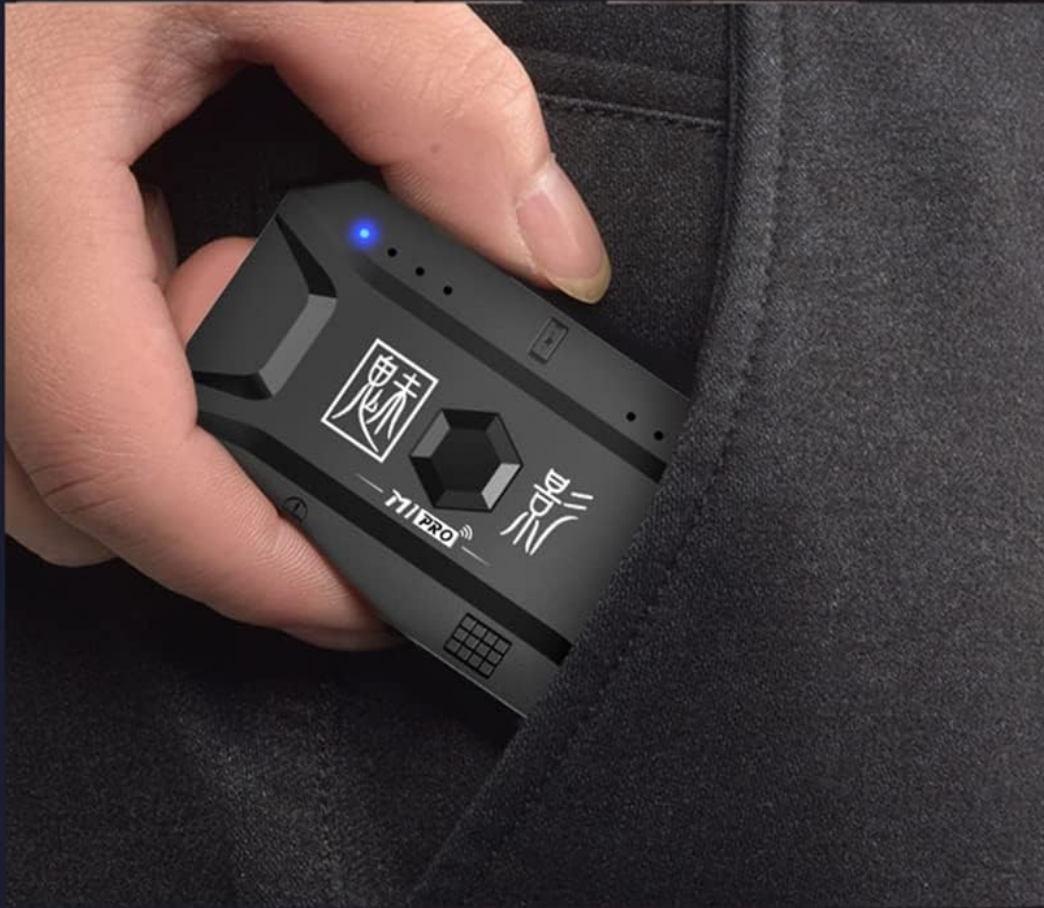
Figure 2.3: The M1Pro converter shown in a pocket, illustrating its compact and lightweight design for easy portability.

Small size and lightweight, not take up much space, easy to carry