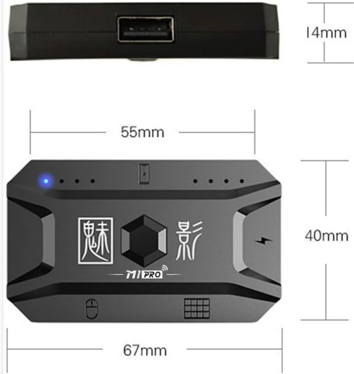
Figure 7.1: Technical drawing showing the precise dimensions of the M1Pro converter.