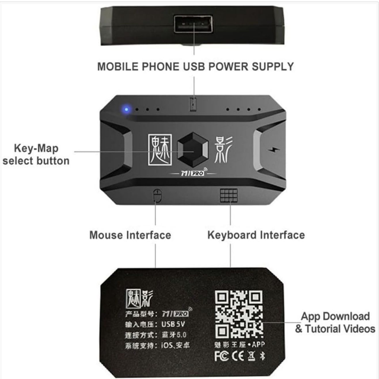
Figure 3.1: Diagram showing the mobile phone USB power supply input, Key-Map select button, mouse interface, keyboard interface, and the QR code for App Download & Tutorial Videos.