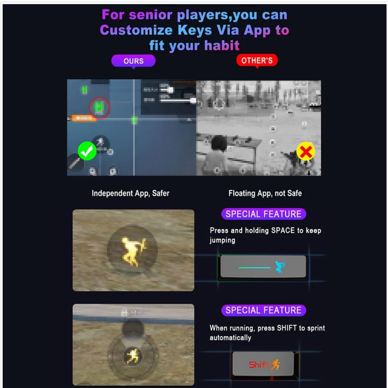
Figure 5.2: Demonstrates the app's ability to customize keys, including special features like holding SPACE for continuous jumping and pressing SHIFT for automatic sprinting.