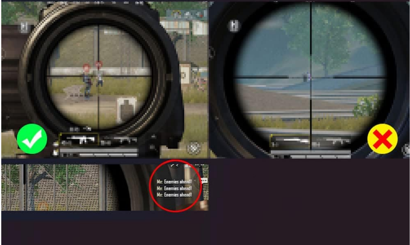
Figure 4.1: An illustration of the Quick Voice Broadcast feature, showing how in-game reporting shortcuts can be used to communicate information like "Enemies ahead!" to teammates.