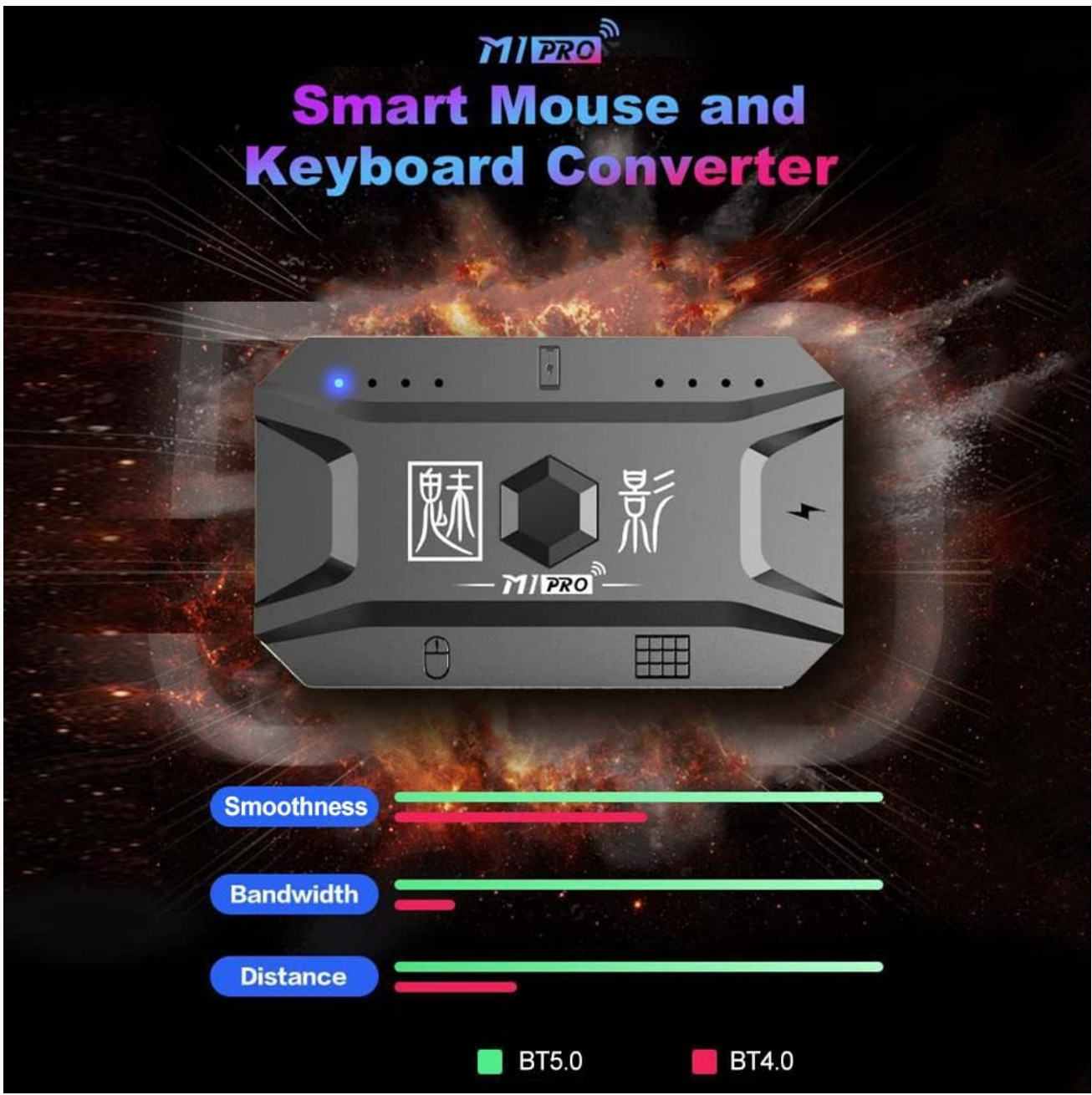
Figure 2.1: The M1Pro converter, highlighting the performance advantages of Bluetooth 5.0 over Bluetooth 4.0 in terms of smoothness, bandwidth, and distance.