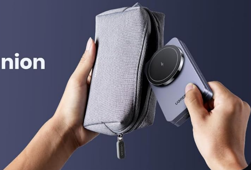
Image: Detailed dimensions of the UGREEN MagFlow MagSafe Charger Stand, emphasizing its compact and travel-friendly size.