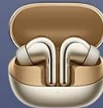
Xiaomi Air 2s