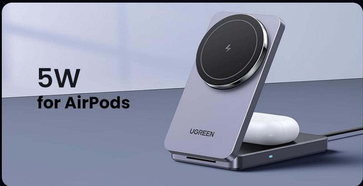
Image: The UGREEN MagFlow MagSafe Charger Stand in its compact, folded form, highlighting its portability.