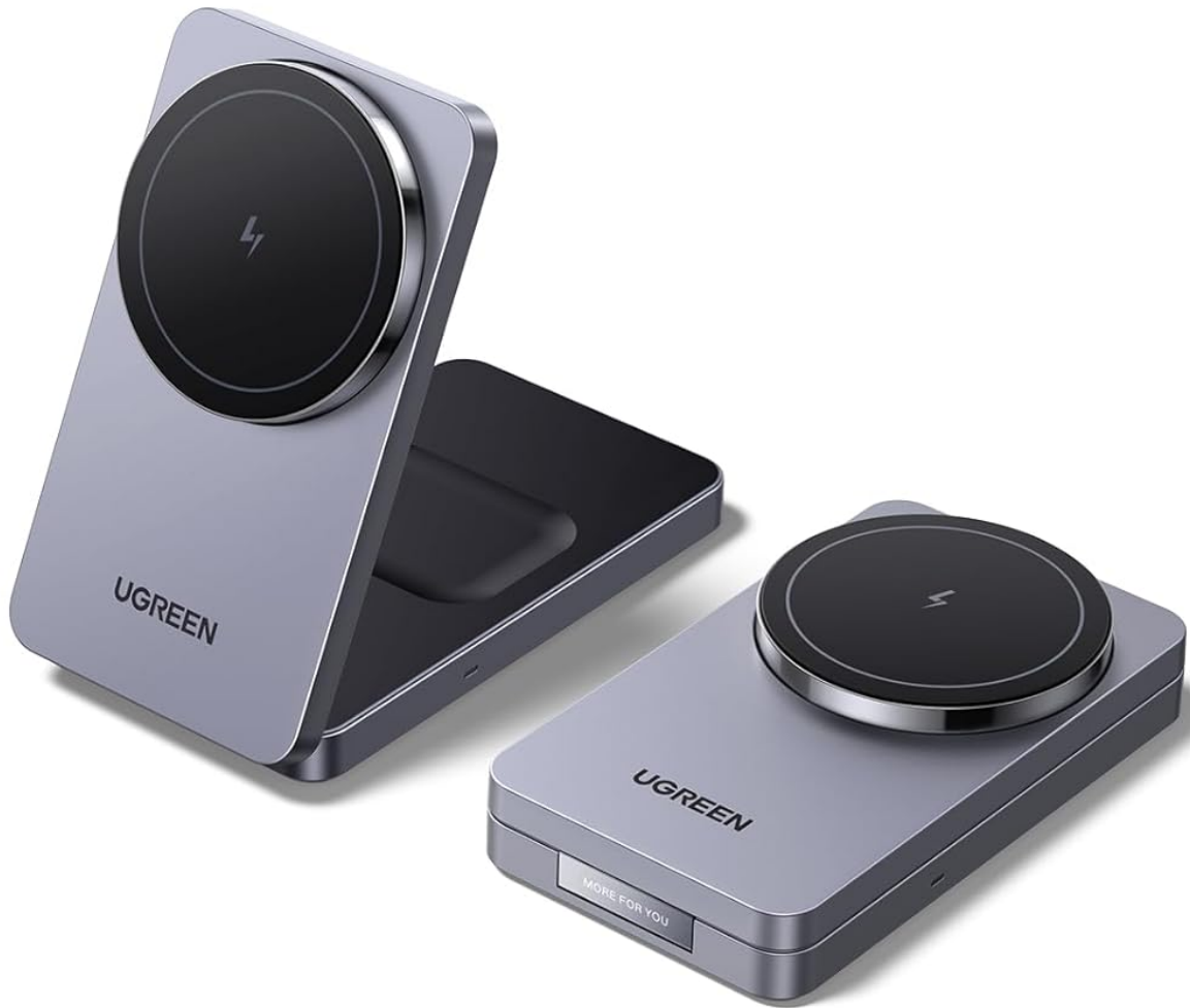
Image: The UGREEN MagFlow MagSafe Charger Stand in its compact, folded state and its upright, ready-to-use state.