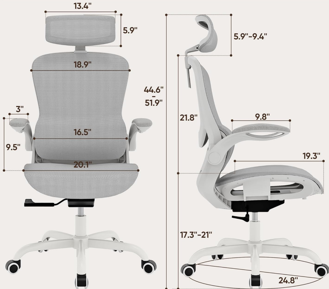
Image: Detailed dimension diagram of the GABRYLLY GY1108 Ergonomic Mesh Office Chair, including height, width, and depth measurements.

Recommended Height: 5'1"–5'9" Weight Capacity: 280 lbs