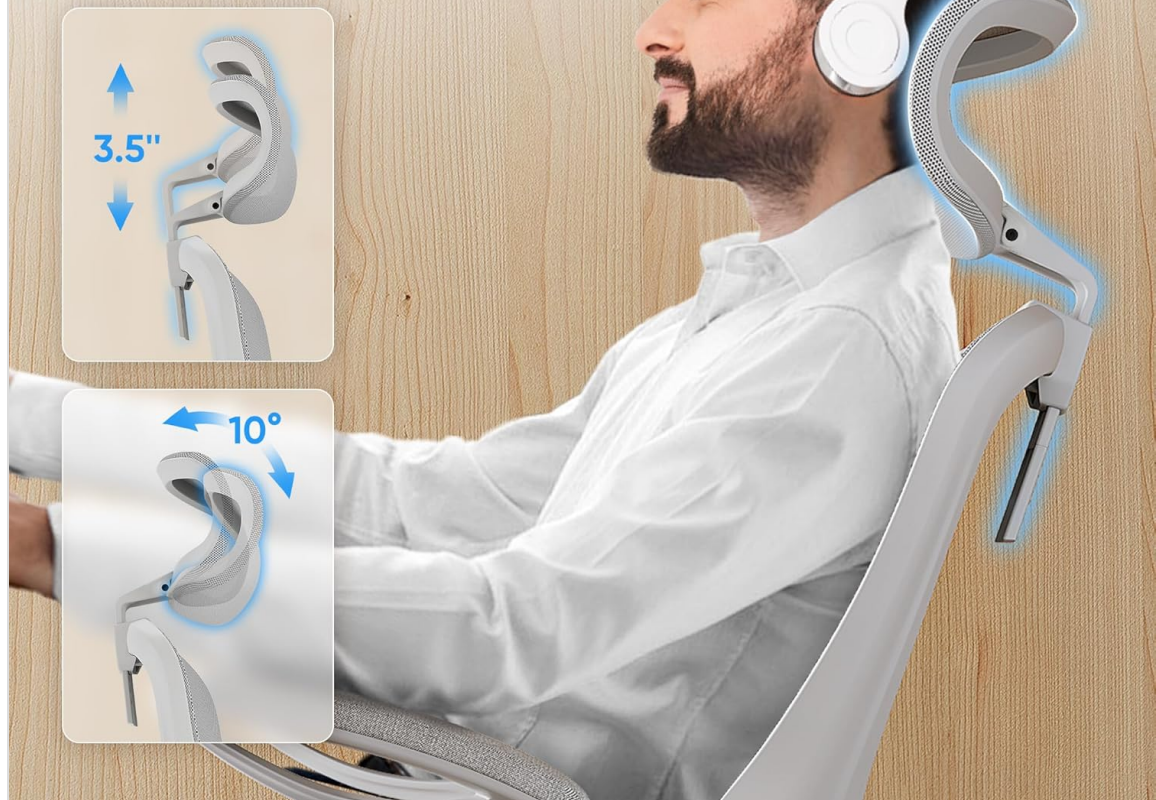
Image: Illustration showing the height and tilt adjustments of the chair's headrest for personalized comfort.

Personalized Adjustment, Relief for Neck Strain.