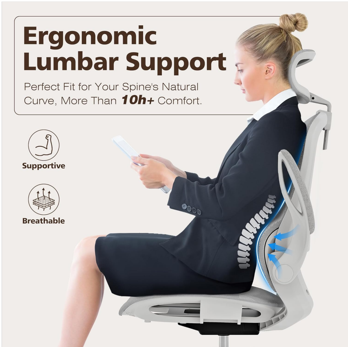
Image: Visual representation of the ergonomic lumbar support system within the chair's backrest, highlighting its supportive and breathable design.