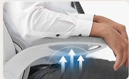
Image: Close-up view of the chair's flip-up armrests, demonstrating their upward movement for space-saving and flexibility.