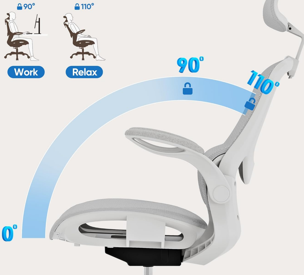
Image: Diagram illustrating the reclining range of the chair's backrest, from 90 degrees for work to 110 degrees for relaxation.