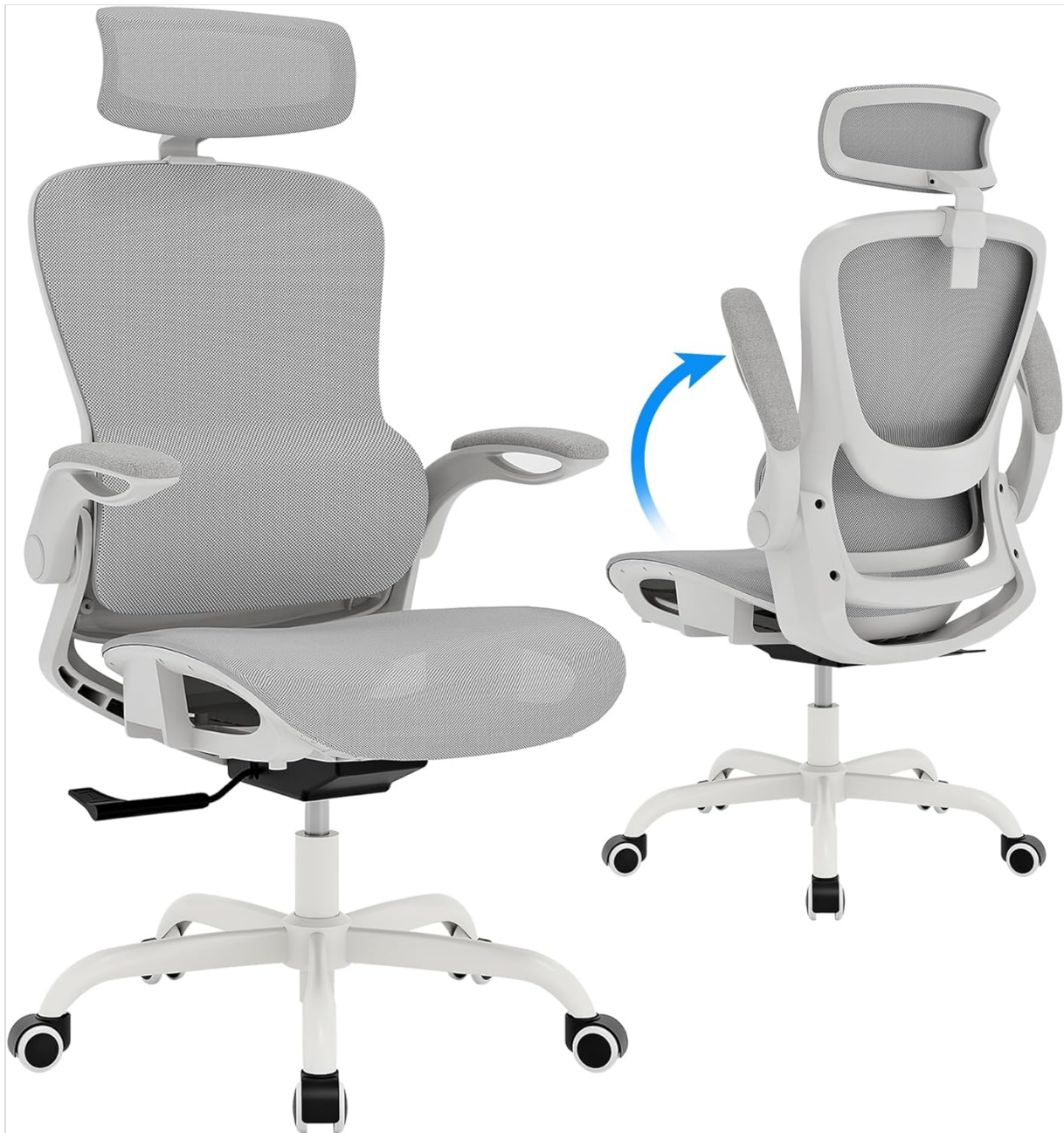
Image: Front and back view of the assembled GABRYLLY GY1108 Ergonomic Mesh Office Chair in white mesh.