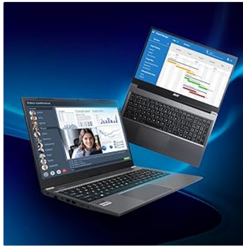
Figure 3.5: The laptop's display optimized for clear conferencing.