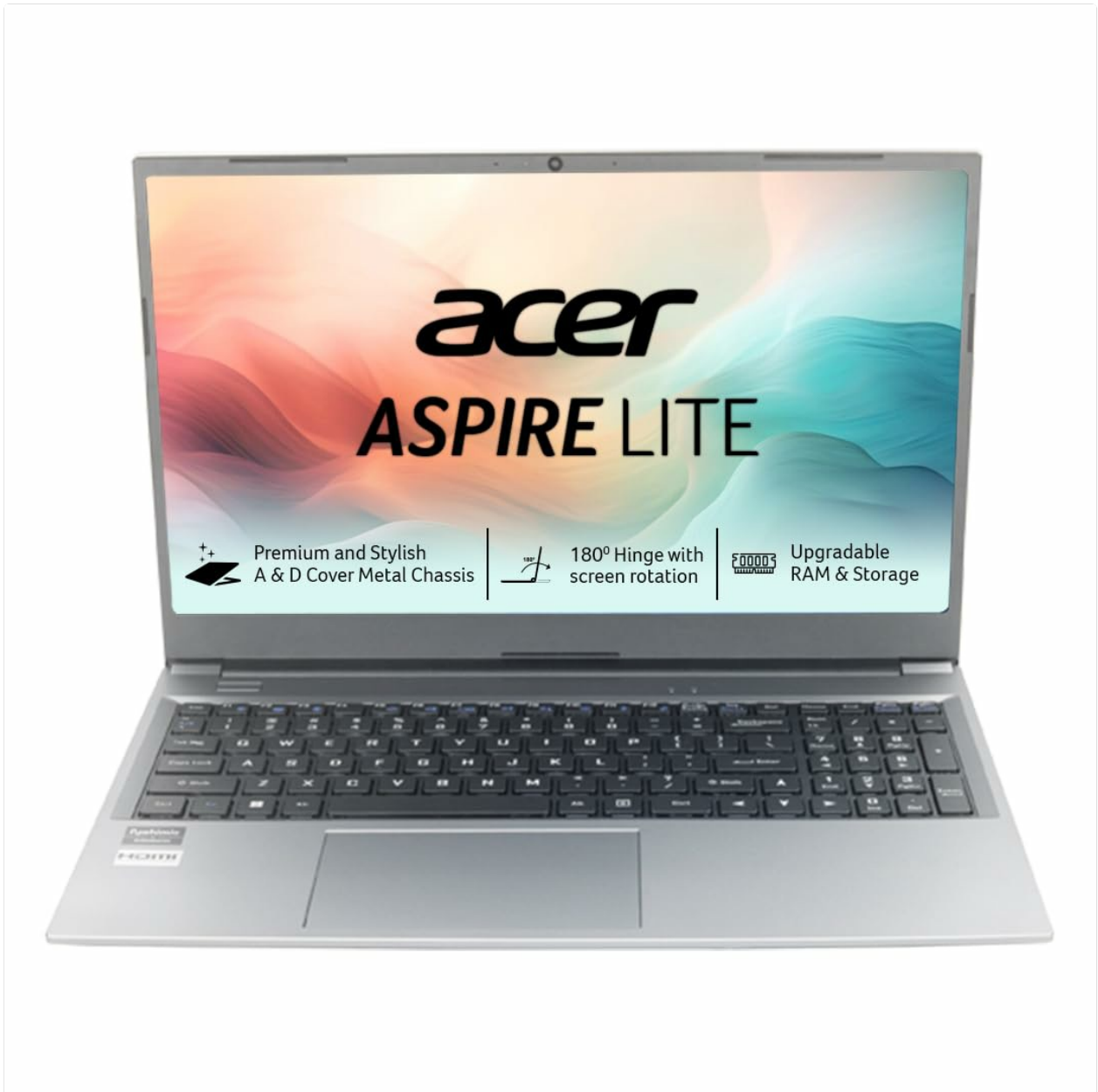
Figure 1.1: Front view of the Acer Aspire Lite AL15-41 laptop.