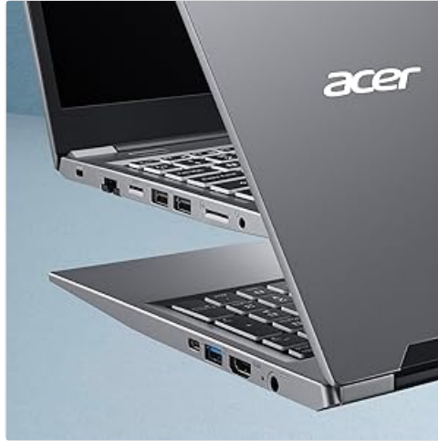
Figure 2.2: Detailed view of the laptop's various connectivity ports.