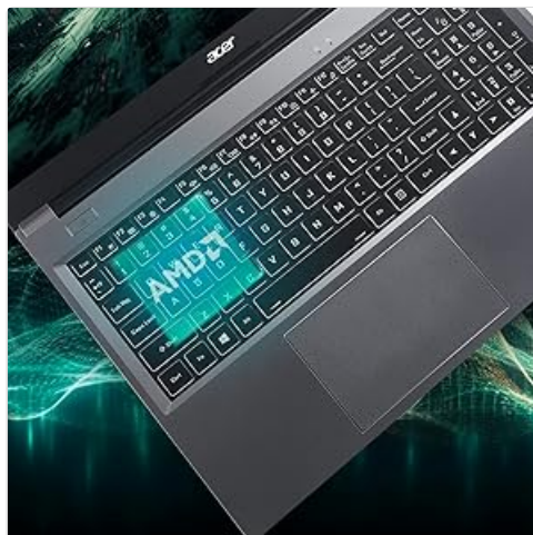
Figure 3.1: Close-up view of the laptop's keyboard, highlighting the AMD processor.