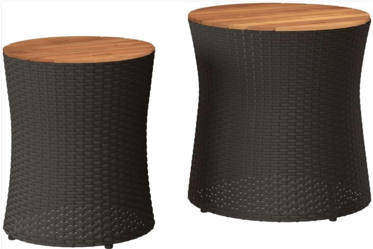
Image 1.1: The vidaXL 2-Piece Patio Side Tables. This set includes one larger table and one smaller table, both featuring black poly rattan bases and natural acacia wood tops.

This manual provides instructions for the assembly, setup, operation, and maintenance of your vidaXL 2-Piece Patio Side Tables. These tables are designed for outdoor use, offering a functional and space-saving solution for your garden, backyard, or patio.