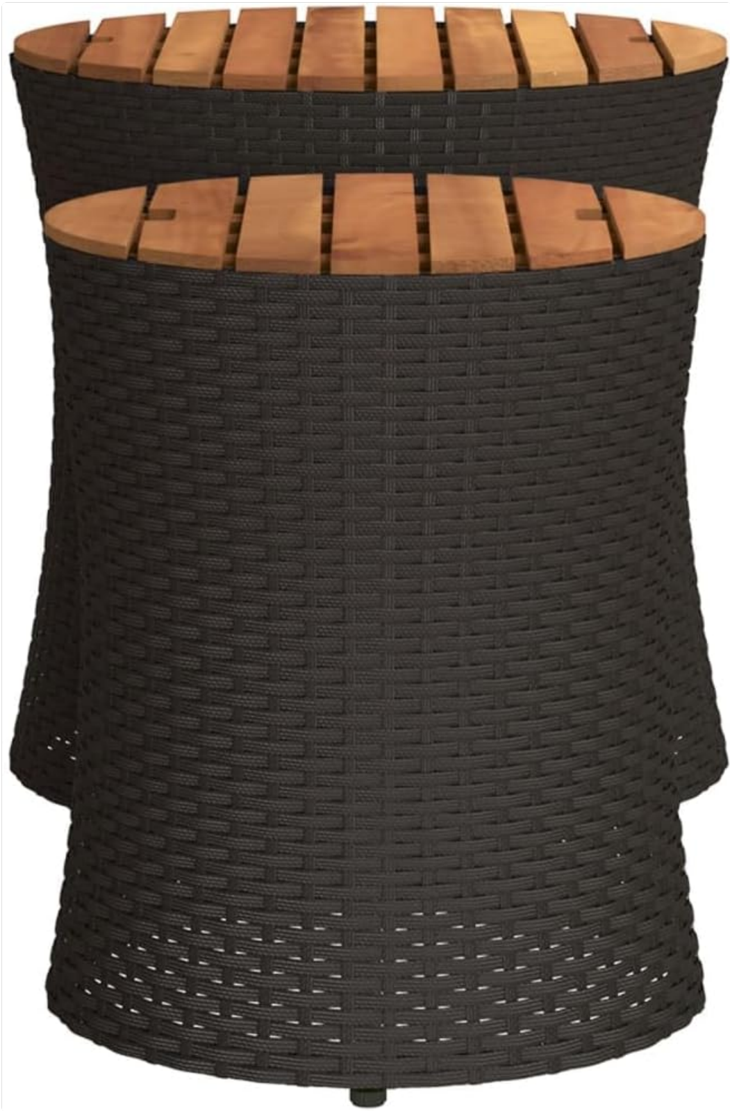
Image 5.1: The nesting design allows the smaller table to be stored within the larger one.