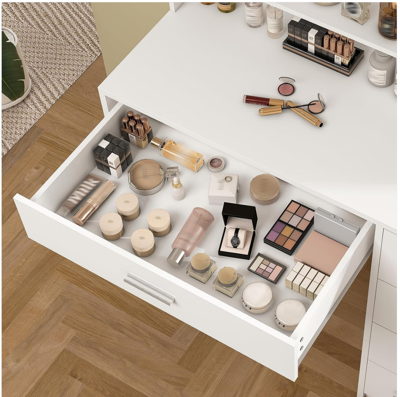
Image: A detailed view inside one of the large drawers, demonstrating its capacity for storing makeup and other personal items.