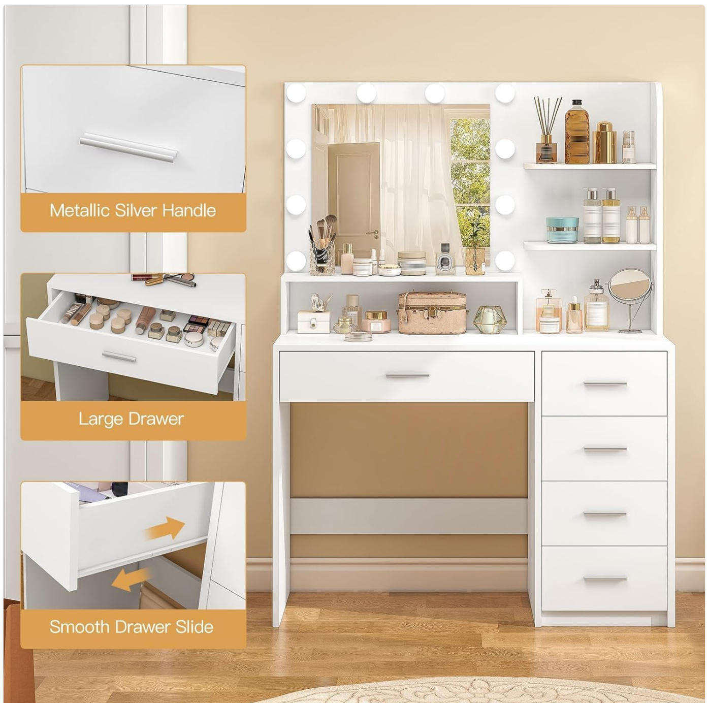
Image: Visual representation of key design elements including the metallic silver handles, the spacious large drawer, and the smooth operation of the drawer slides.