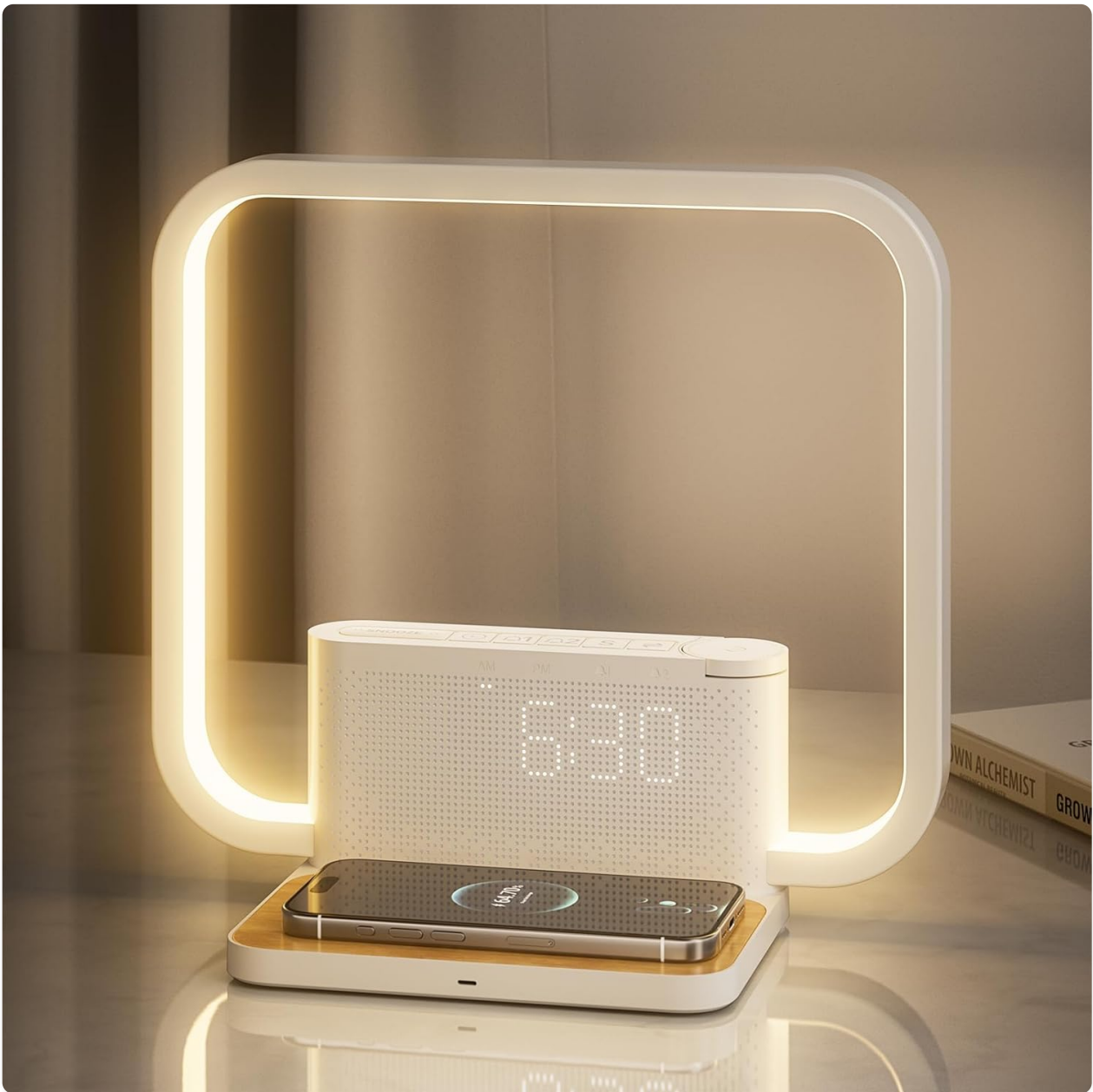
Image: The RETEYUNG Sunrise Alarm Clock, showcasing its integrated wireless charging pad and illuminated lamp.