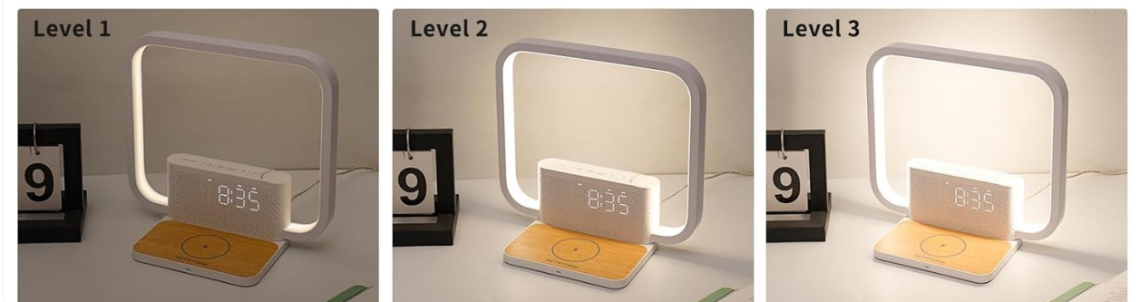
Image: Demonstrates the three adjustable brightness levels of the touch-sensitive lamp.