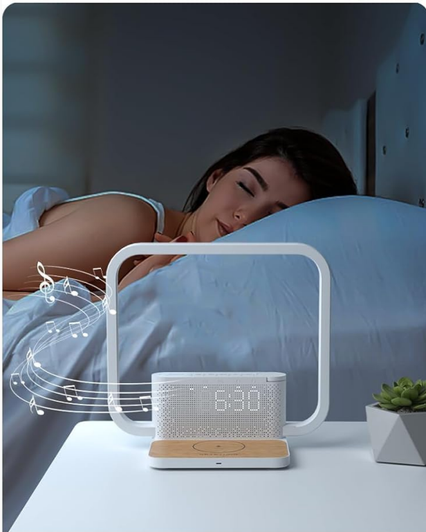
AL1 6:30 AM

Set two separate alarms & Meet your different habits Wake-up light will get brighter and brighter until the alarm goes off.