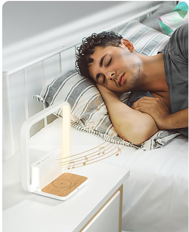
AL2 8:30 AM With Wake-up Light (Lights up 10min before the alarm goes off)

Image: Illustration of the dual alarm functionality, showing Alarm 1 as sound-only and Alarm 2 with a gradual wake-up light.