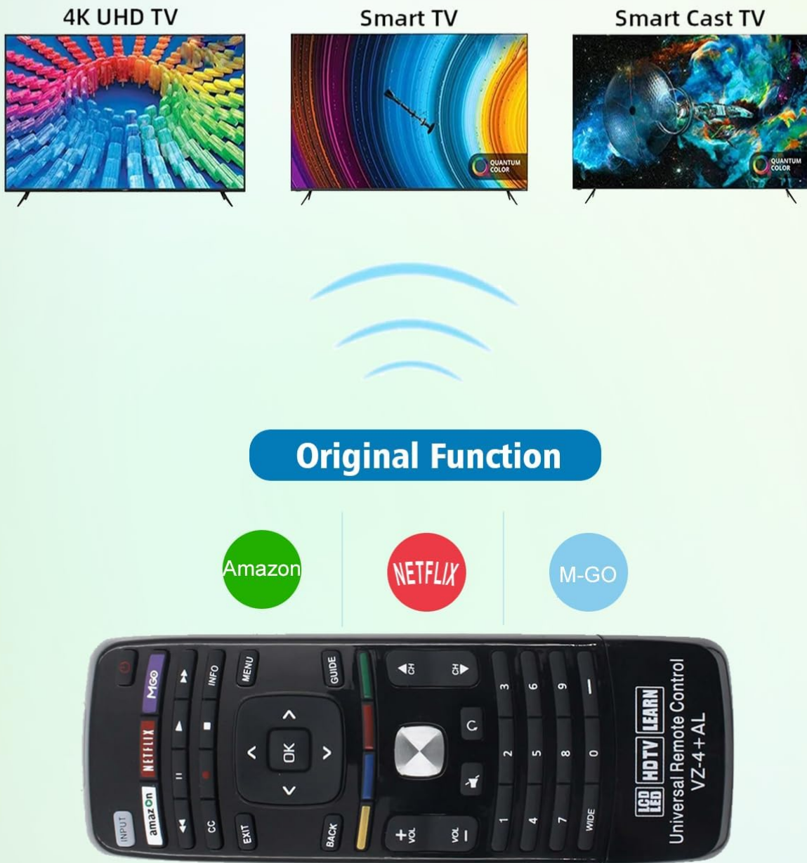
Image: Illustrates the ease of use of the JISOWA remote control with different Vizio TV types, including 4K UHD TV, Smart TV, and Smart Cast TV. It highlights the original function of the remote and the quick access buttons for Amazon, Netflix, and MGO.