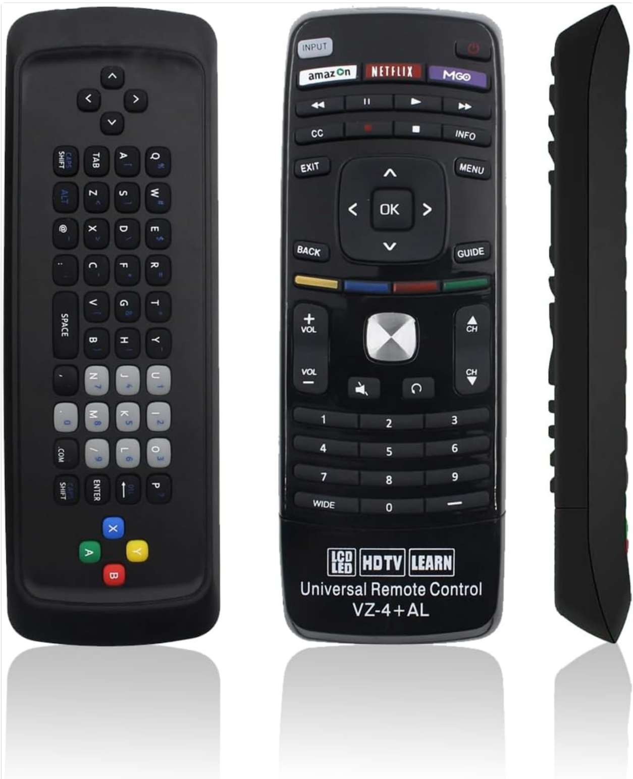
Image: Front, back, and side views of the JISOWA remote control, model VZ-4+AL. The front features standard TV remote buttons and quick access buttons for Amazon, Netflix, and MGO. The back includes a QWERTY keyboard. The side view shows its slim profile.