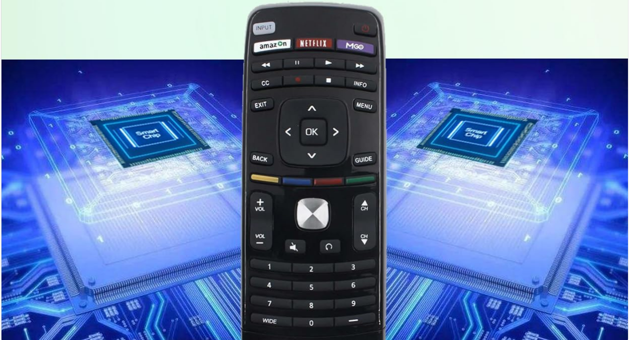
Image: Focuses on the "New Upgraded Smart Chip" within the JISOWA remote control, illustrating its benefits: Sensitive & Durable, Signal stabilization, Precise Control, and No Programming required. The remote is shown against a background of a vibrant TV display and circuit board elements.