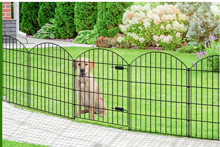
Image: Illustration highlighting the double lock system on the gate and the secure 12-inch deep ground insertion of the stakes.