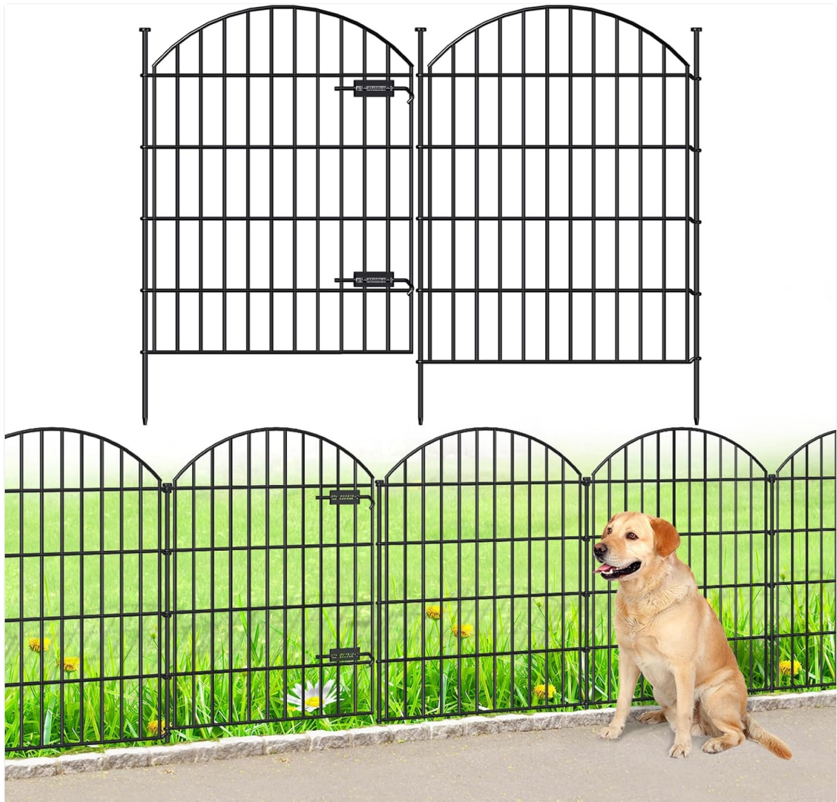
Image: Overview of the FOREHOGAR Metal Garden Fence components, including the gate and multiple panels.