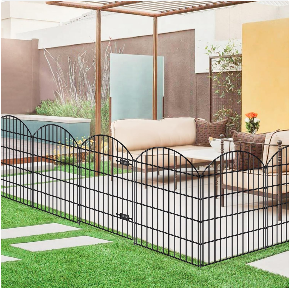
Image: The garden fence configured to enclose a patio area, demonstrating its flexible enclosure capability.