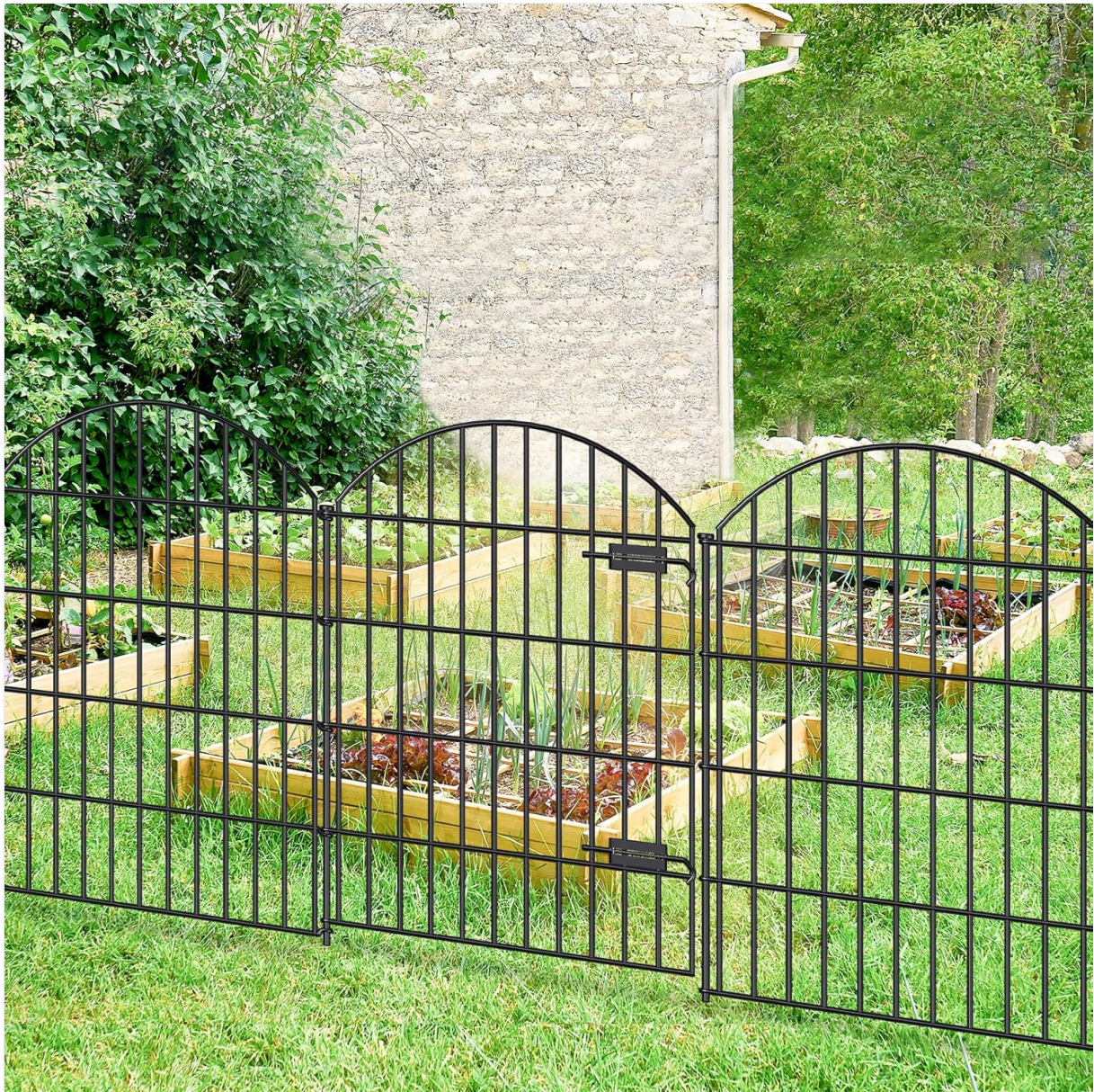
Image: The garden fence used to protect raised garden beds, showcasing its versatility in different garden settings.