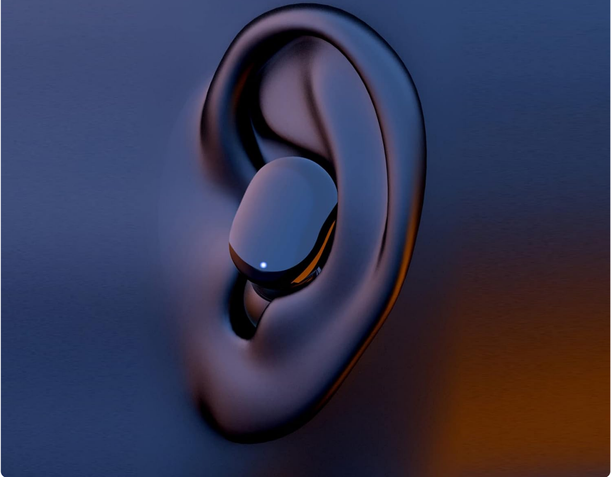
Figure 6.1: Depiction of an earbud comfortably seated in an ear, highlighting its ergonomic in-ear design and mini size, which ensures a snug fit within the ear canal and prevents easy dropping.

Ergonomic in-ear design, mini size, fit the ear canal, not easy to drop