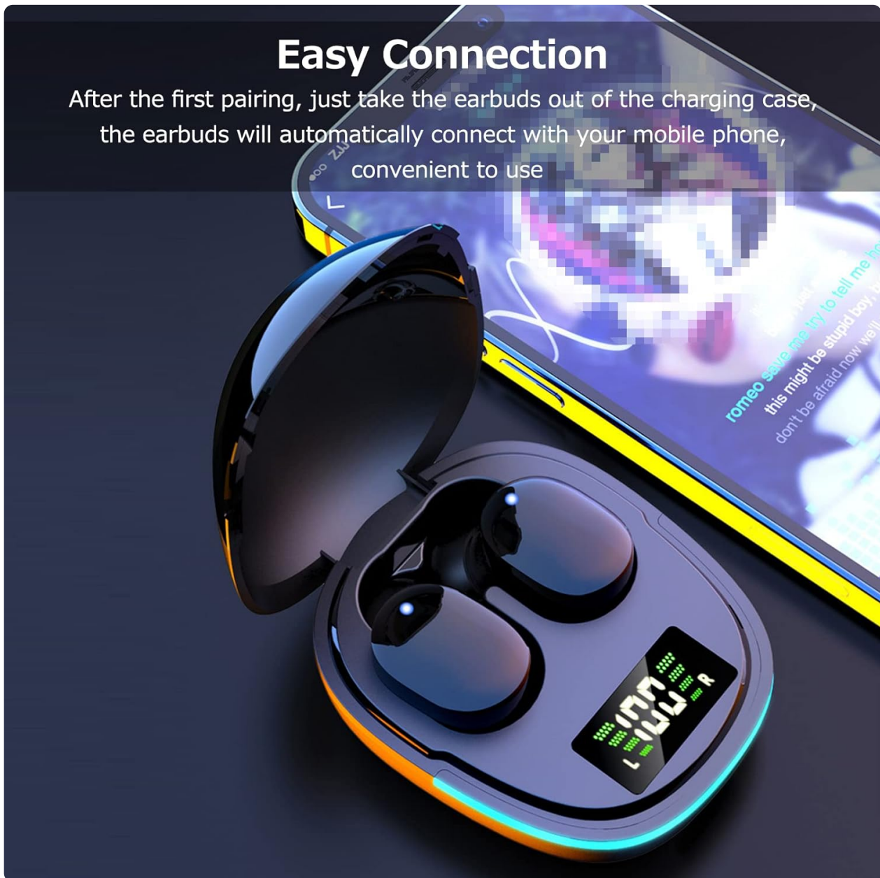
Figure 4.1: Illustration of the easy connection process: simply remove the earbuds from the charging case, and they will automatically connect to your mobile phone after the first pairing.

Follow these steps for initial pairing with your device: