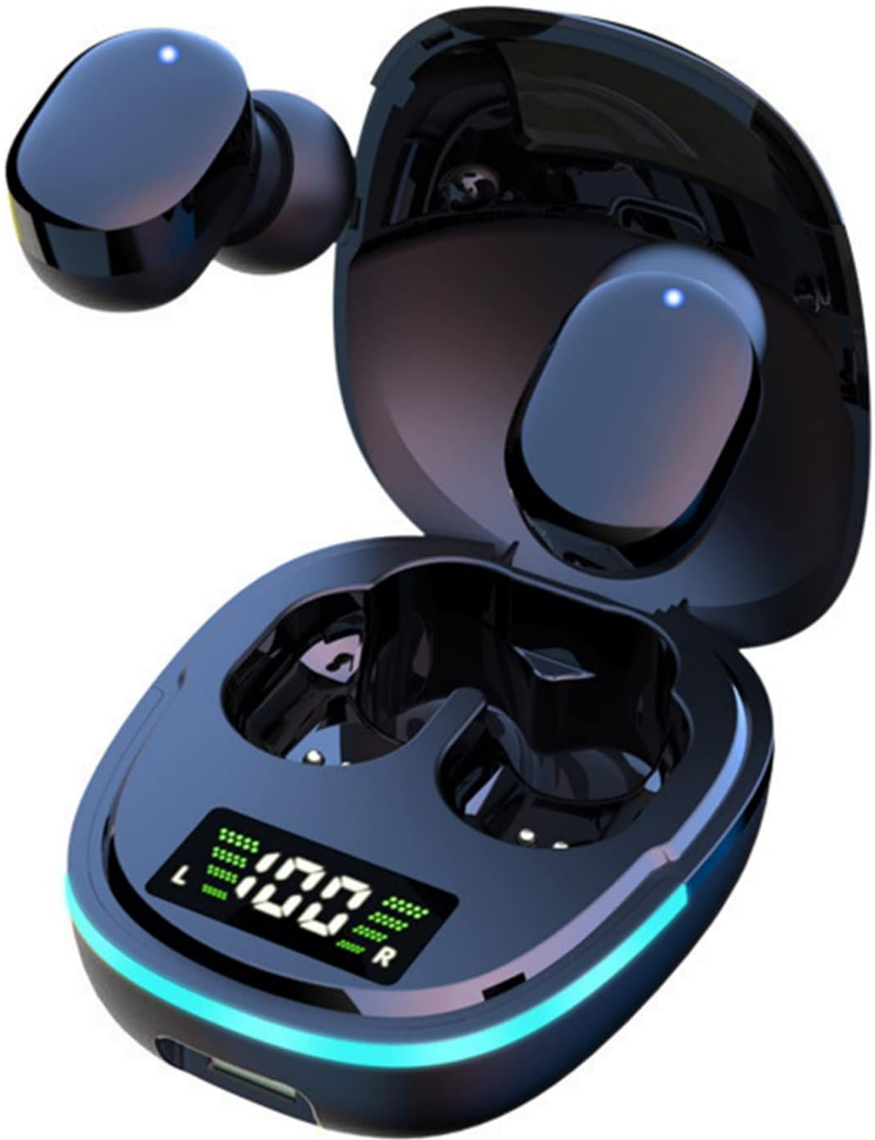
Figure 3.1: YIWENG G9S Earbuds in their open charging case, showcasing the digital LED display for battery levels and the cool breathing light feature.