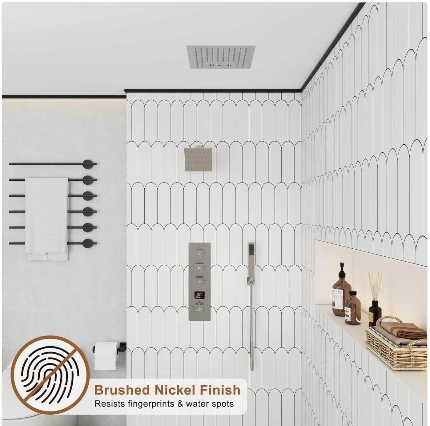
Figure 7: Finish Durability - Shows the brushed nickel finish and its fingerprint-resistant quality.