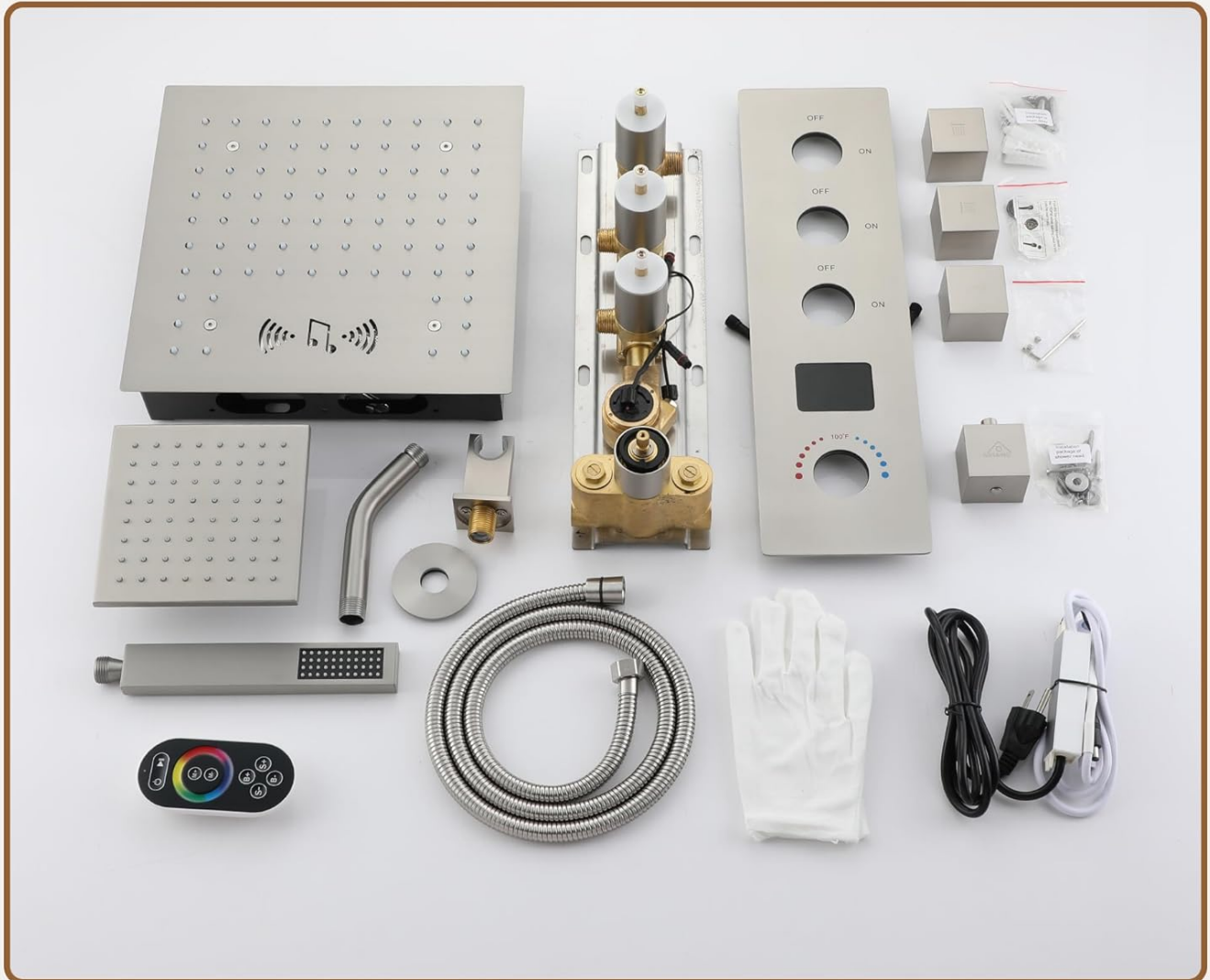
Figure 1: Package List - All components included in the CASAINC KCHS0018-LEDBN Thermostatic Shower System.