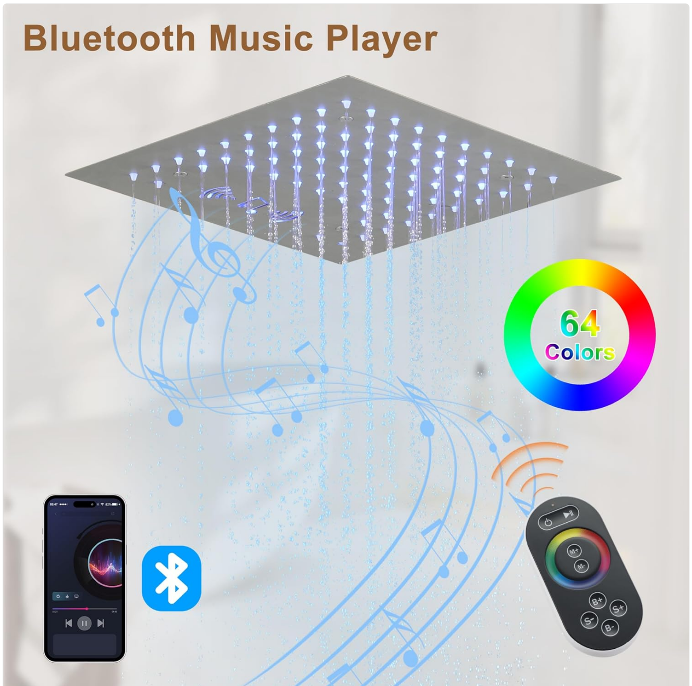
Figure 5: LED and Bluetooth Features - Demonstrates the LED lighting and Bluetooth music player functionality.

Your browser does not support the video tag.