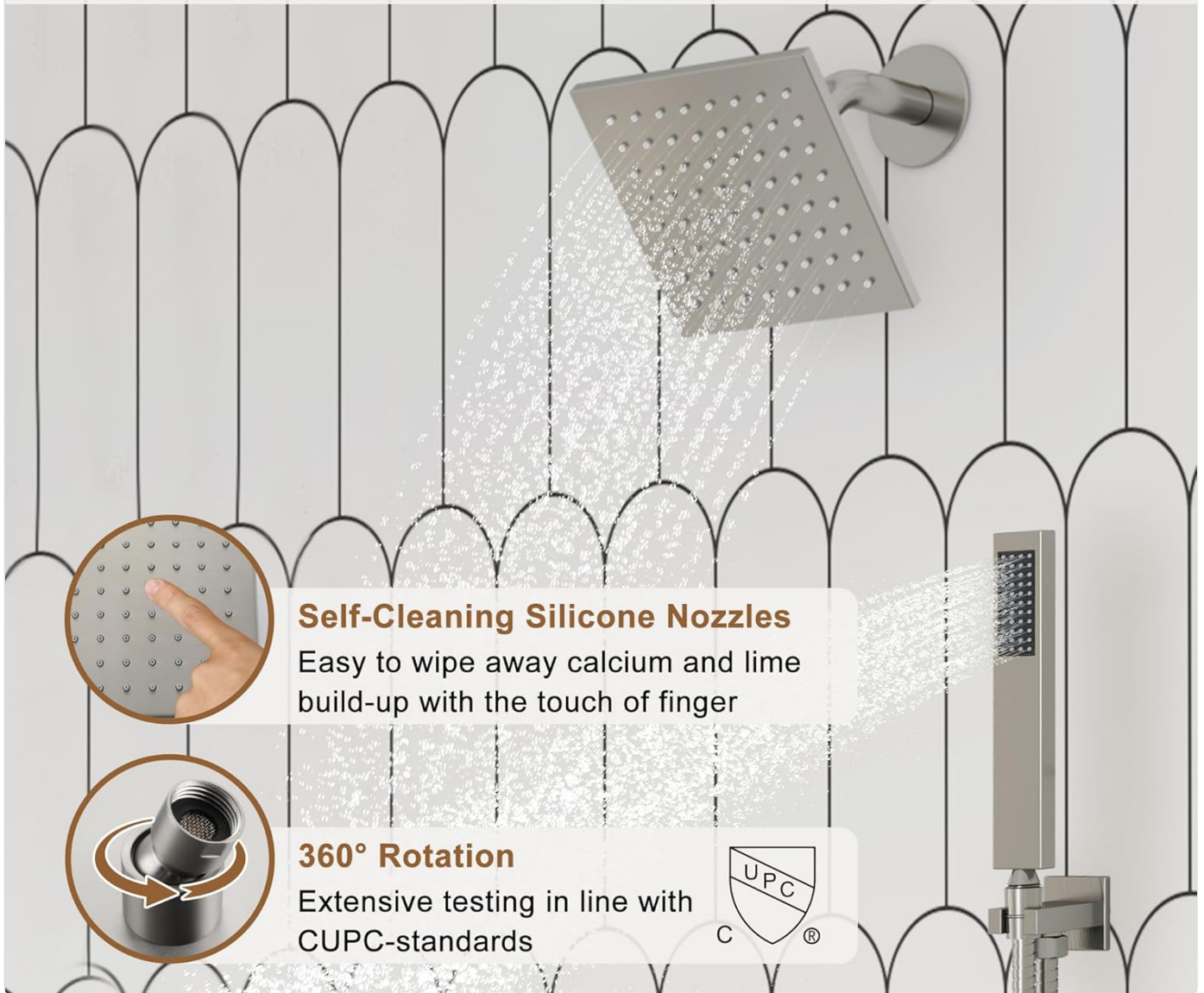
Figure 6: Nozzle Maintenance - Demonstrates the ease of cleaning the silicone nozzles.