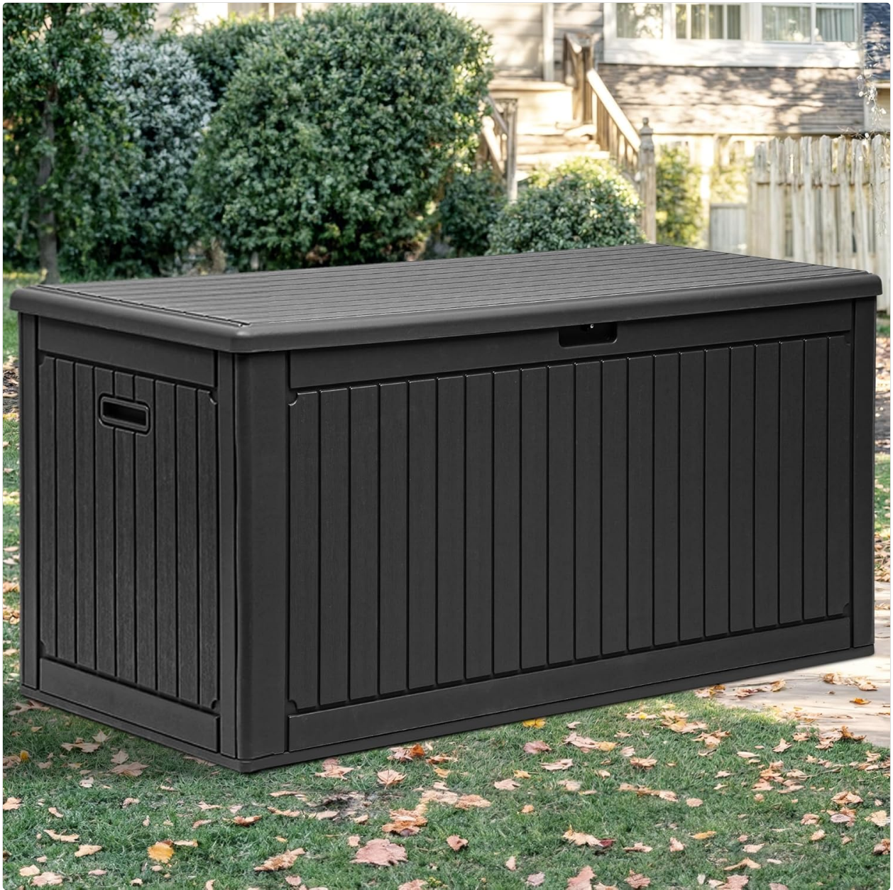
A visual representation of the YITAHOME 260 Gallon Deck Box, detailing its length (69.69 inches), width (32.28 inches), and height (32.68 inches), along with its 260-gallon storage capacity and 1000 lbs weight capacity.