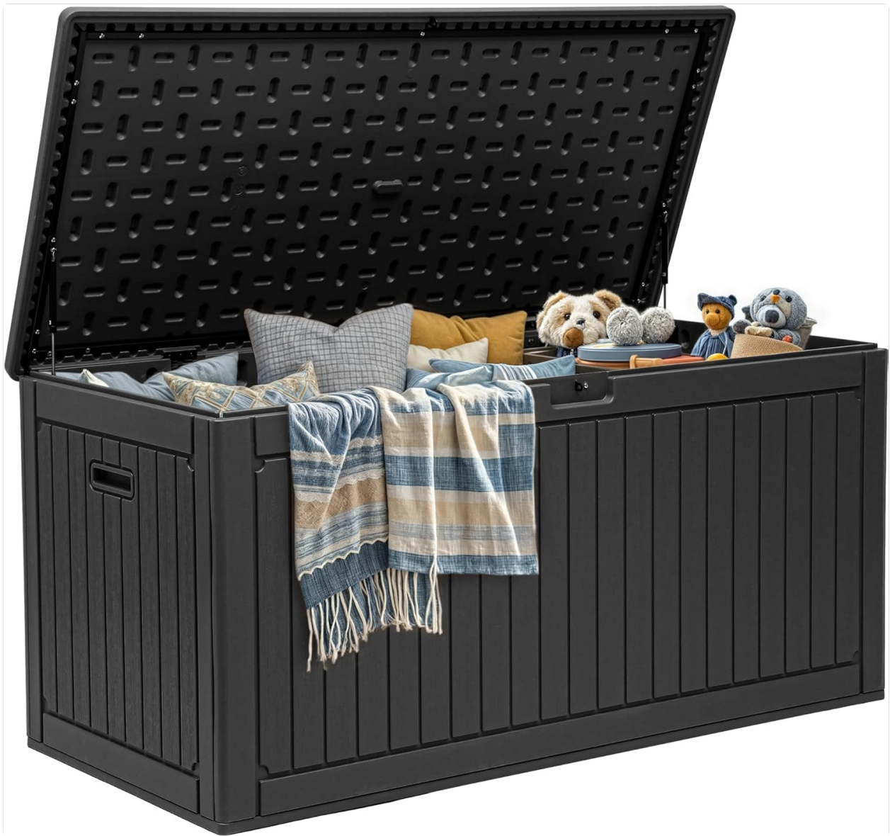
A large black resin deck box with its lid open, revealing ample storage space filled with patio cushions and blankets. The double-wall construction is visible.