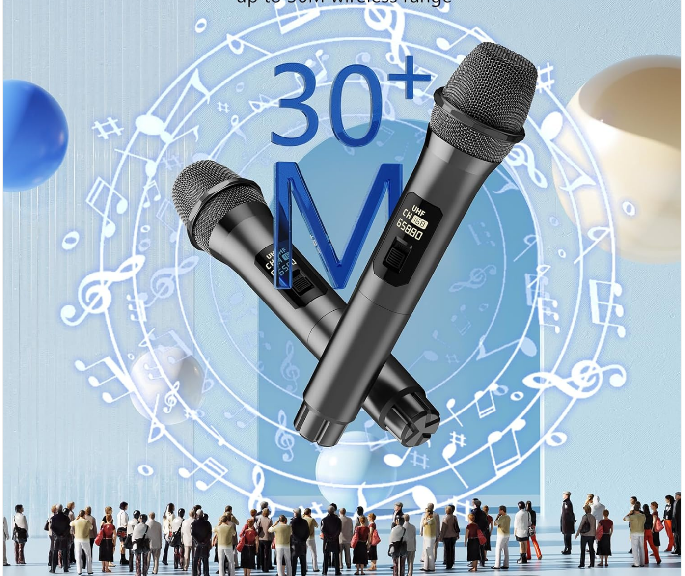
Figure 6: Wireless Microphones and Range.

2 wireless microphone, use Bluetooth 5.0 technology up to 30M wireless range