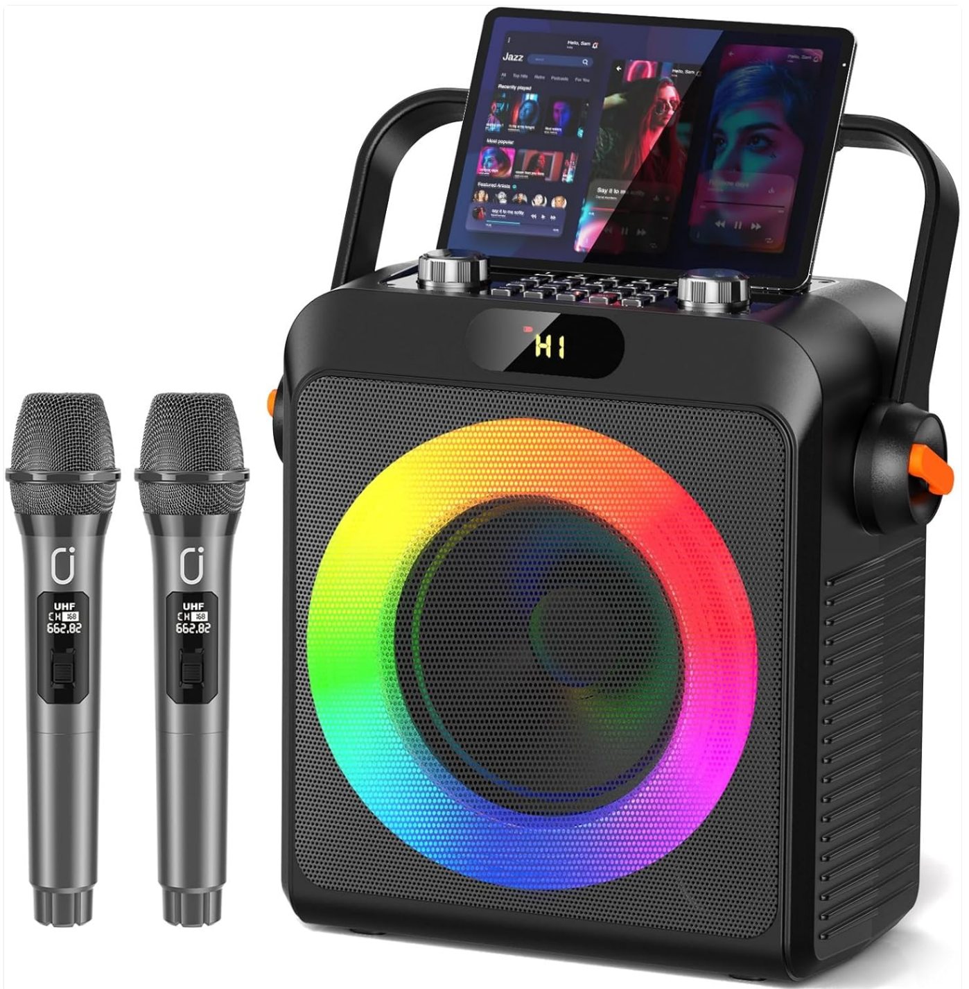
Figure 1: JYX Karaoke System with included microphones.