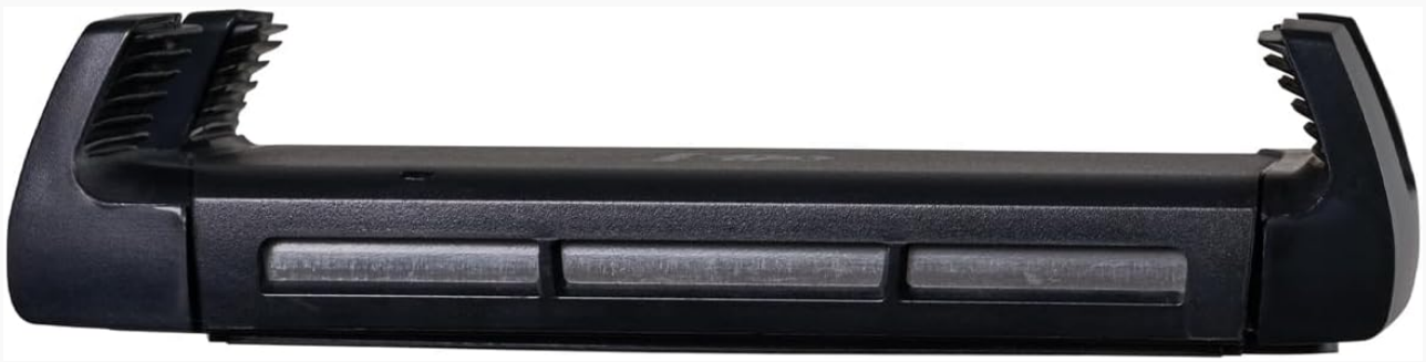
Figure 2: Side profile of the AquaAmp 515-1, illustrating the extendable clamping arms designed to securely hold various phone sizes.