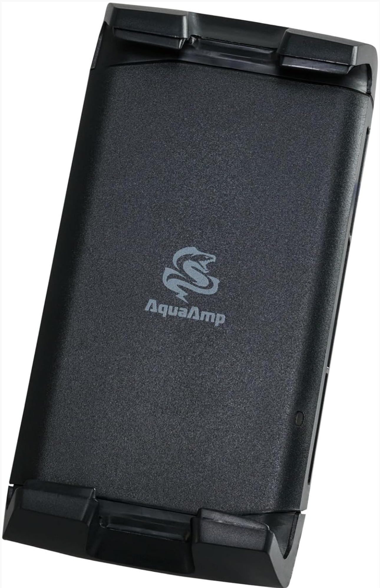
Figure 4: A different angled view, highlighting the compact and durable construction of the device.