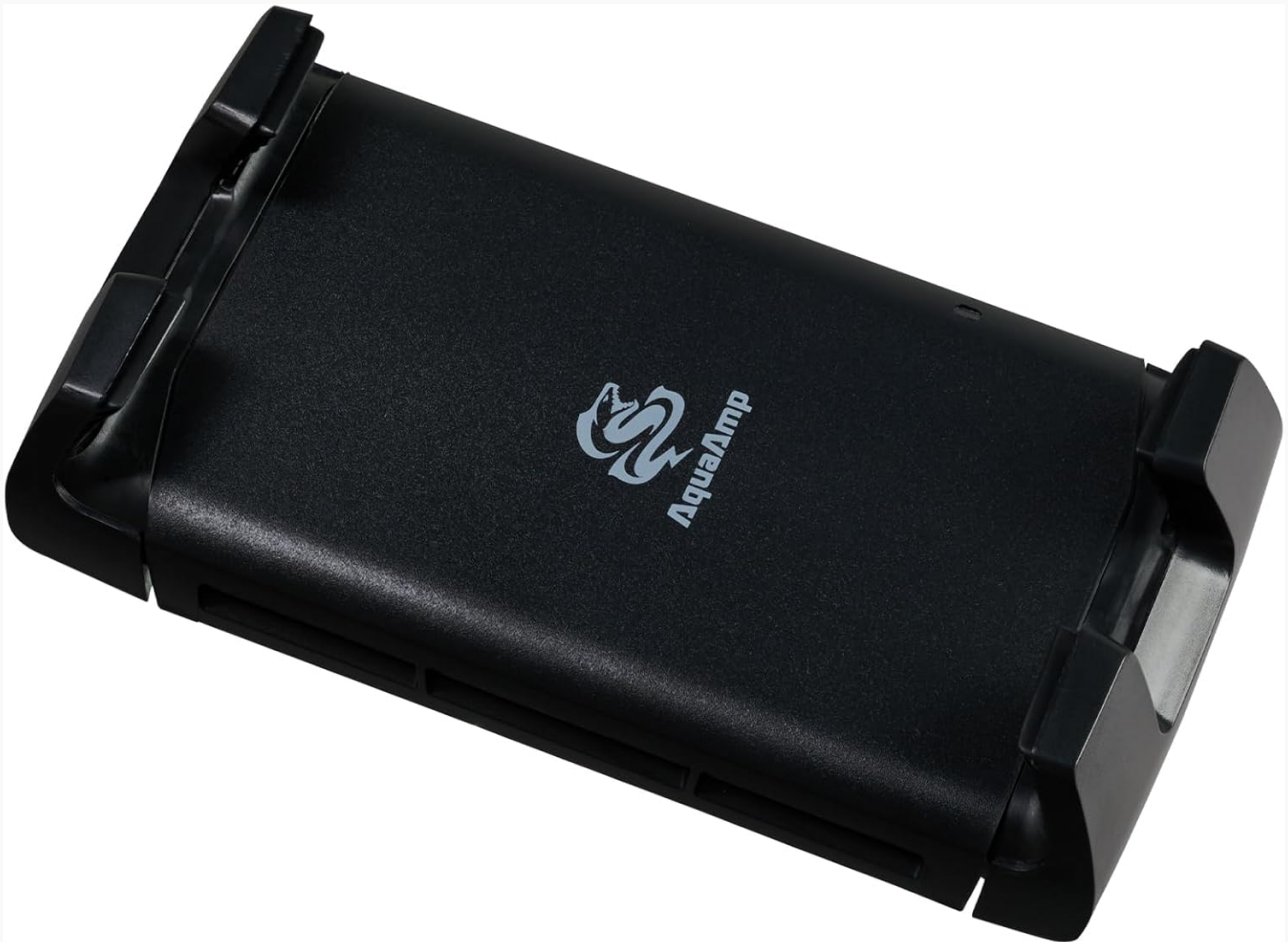
Figure 3: An angled perspective of the charger, providing a view of both the top edge and the front face.