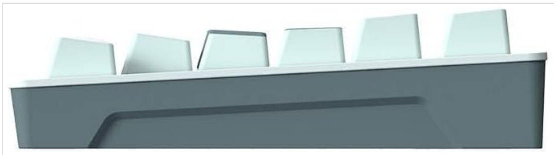
Figure 5: Side profile view demonstrating keycap height and keyboard angle.