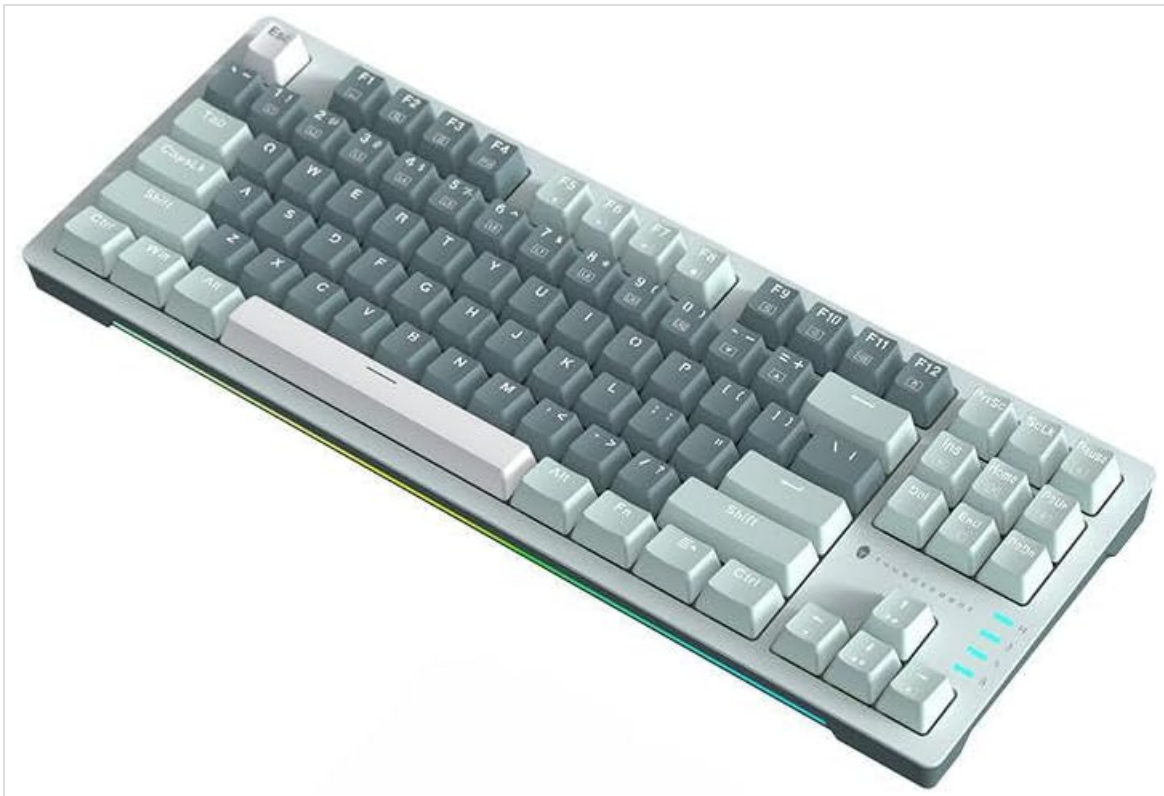
Figure 1: Angled view of the Thunderobot K87 Mechanical Keyboard.

Thank you for choosing the Thunderobot K87 Wired Mechanical Keyboard. This manual provides essential information for the proper setup, operation, maintenance, and troubleshooting of your new keyboard. Please read this manual thoroughly before using the product to ensure optimal performance and longevity.