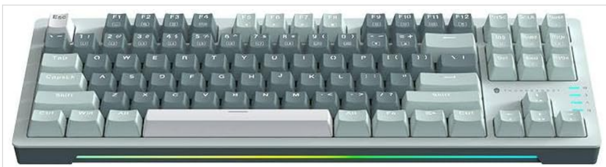
Figure 3: Top-down view of the Thunderobot K87 keyboard layout.

The Thunderobot K87 is a standard 87-key (TKL) layout mechanical keyboard. Simply plug it into your computer, and it is ready for typing. The keyboard features Red mechanical switches, known for their linear feel and quiet operation, making them suitable for both typing and gaming.