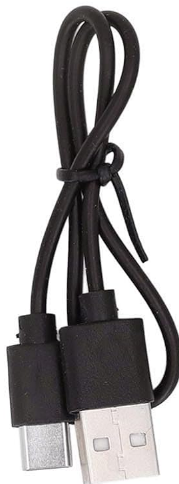
Image: The speaker alongside its charging cable.