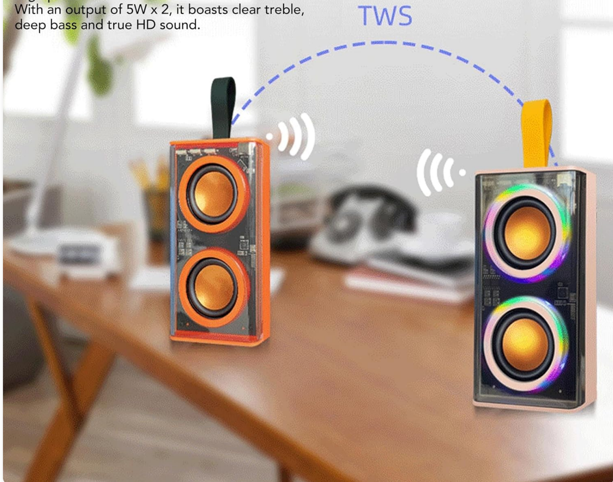
Image: Two speakers demonstrating the TWS pairing feature for enhanced audio.

With an output of 5W x 2, it boasts clear treble, deep bass and true HD sound.