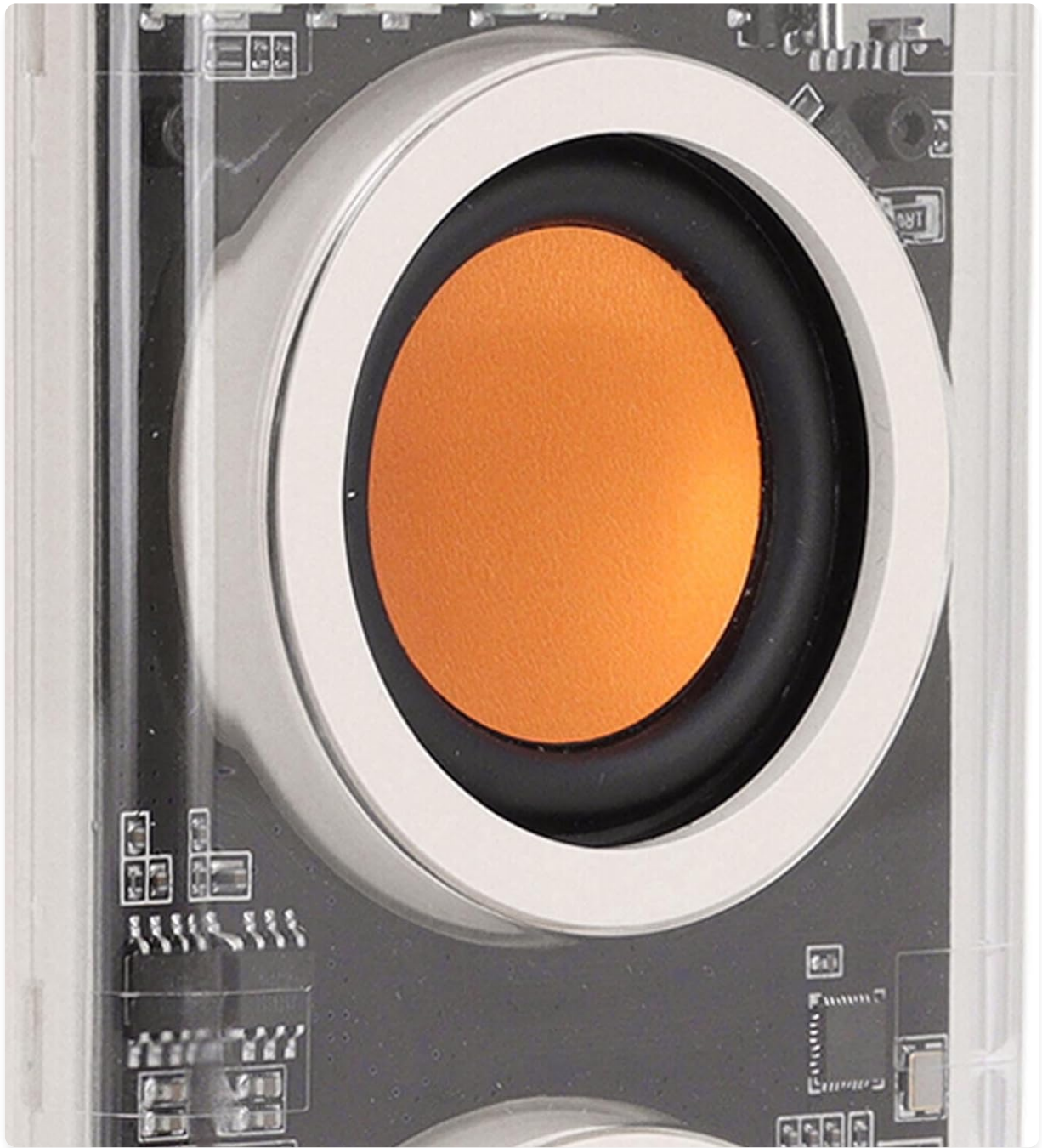
Image: Front view of the speaker, showcasing its transparent design and internal components.