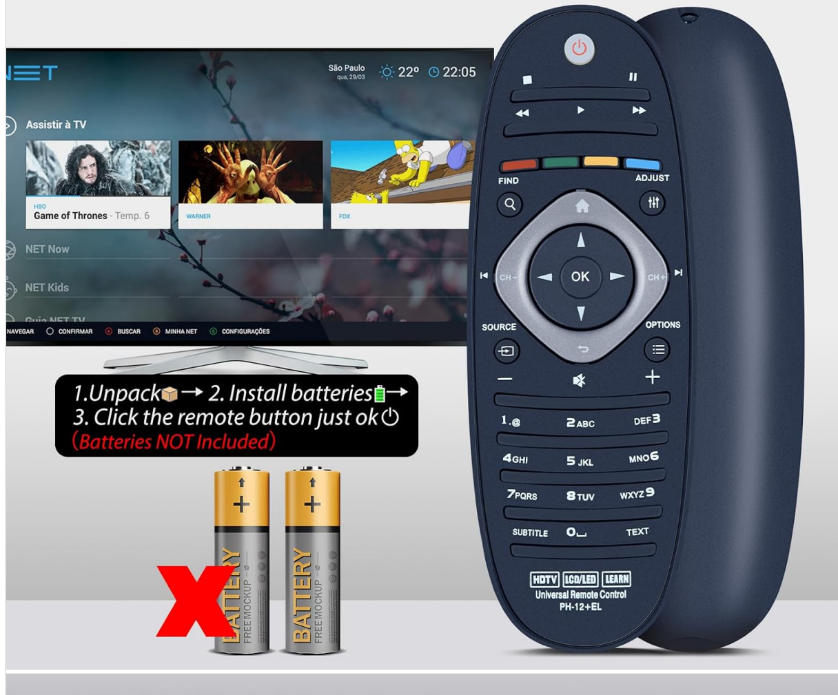
Figure 2.1: Battery Installation Guide. This image demonstrates the simple three-step process for setting up the remote control, primarily focusing on battery insertion.

(Advanced infrared technology: Strong signal & Long distance)