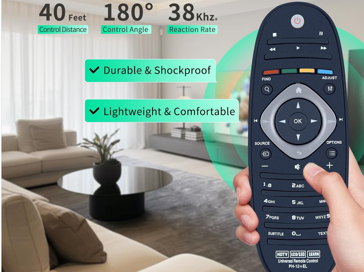
Figure 3.2: Remote Control Features. This image details the operational range, angle, and physical characteristics of the remote.