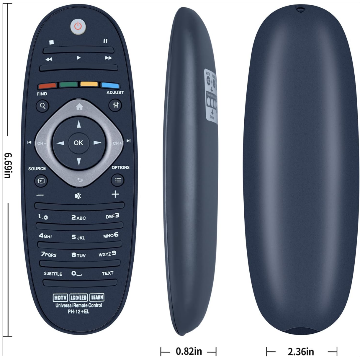
Figure 6.1: Remote Control Dimensions. This image provides a visual representation of the remote's physical measurements.