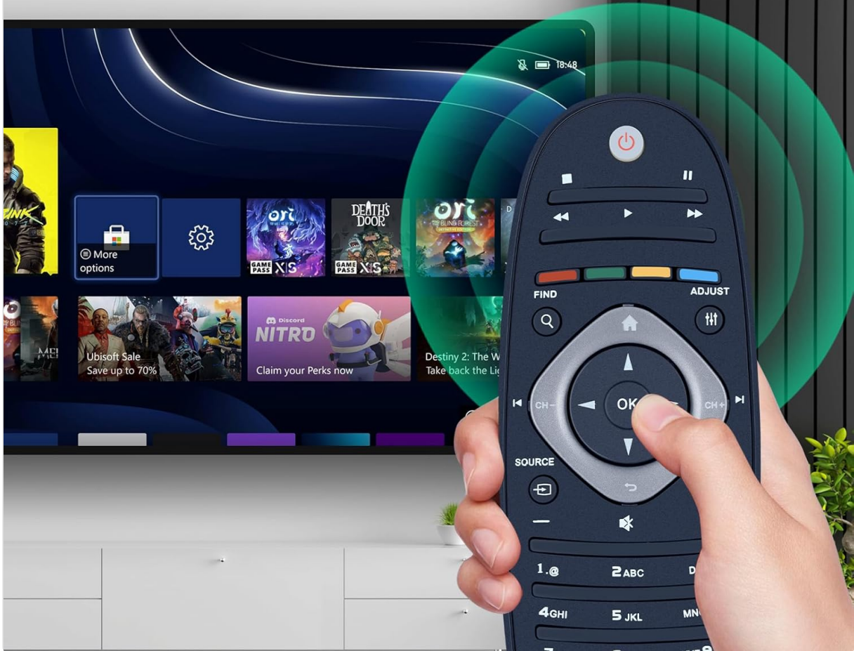
Figure 3.1: Remote Control in Use. This image illustrates the remote control's compatibility with Philips TVs and its ergonomic design during operation.