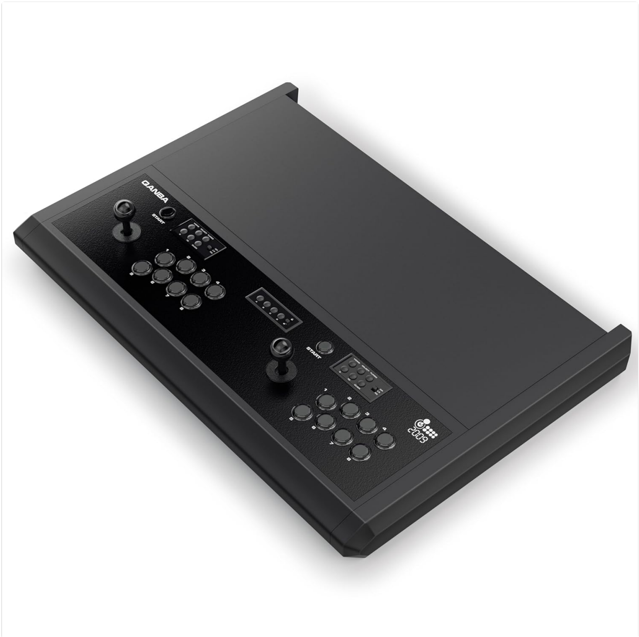
Image 5.1: The control panel with joysticks, buttons, and platform selection switches.

The console features one-click USB switching to support multiple host platforms. Use the designated switch or button on the console to select the appropriate platform mode (e.g., PC Dinput, PC Xinput, Android).