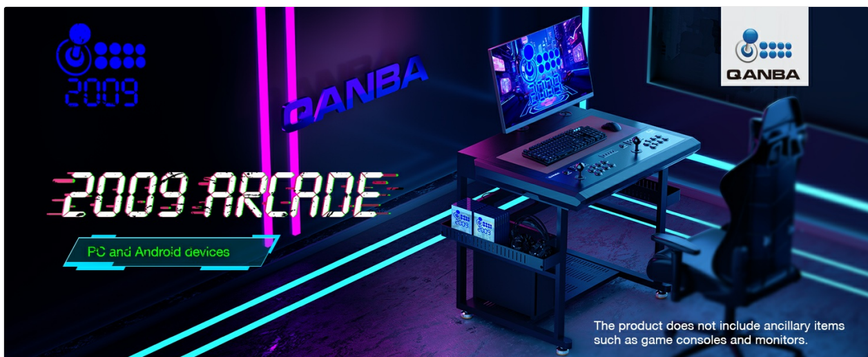
Image 8.1: Dimensional diagram of the Qanba 2009 Arcade Desktop Console with its optional stand.