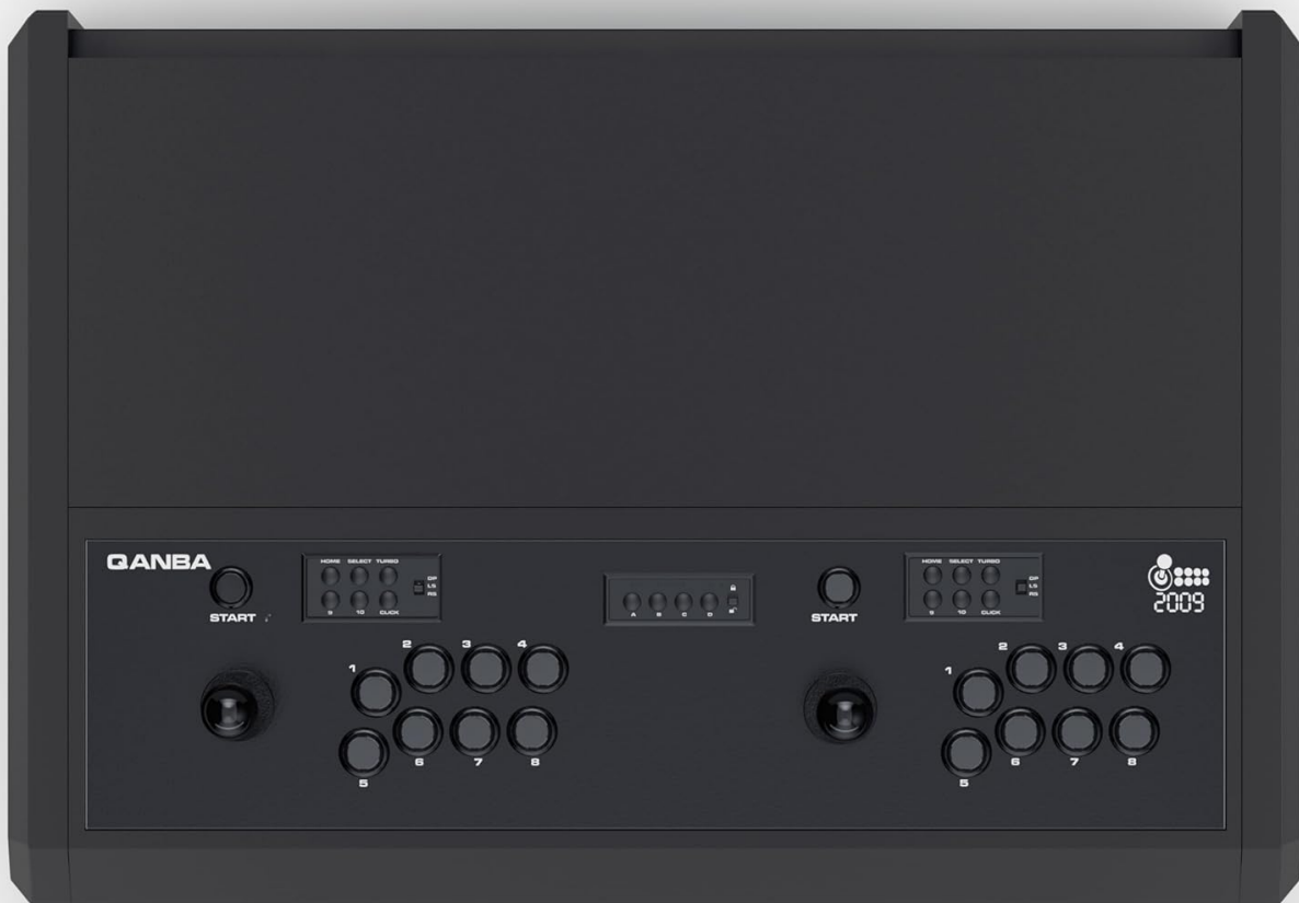
Image 1.1: Top-down view of the Qanba 2009 Arcade Desktop Console (2009-2P).