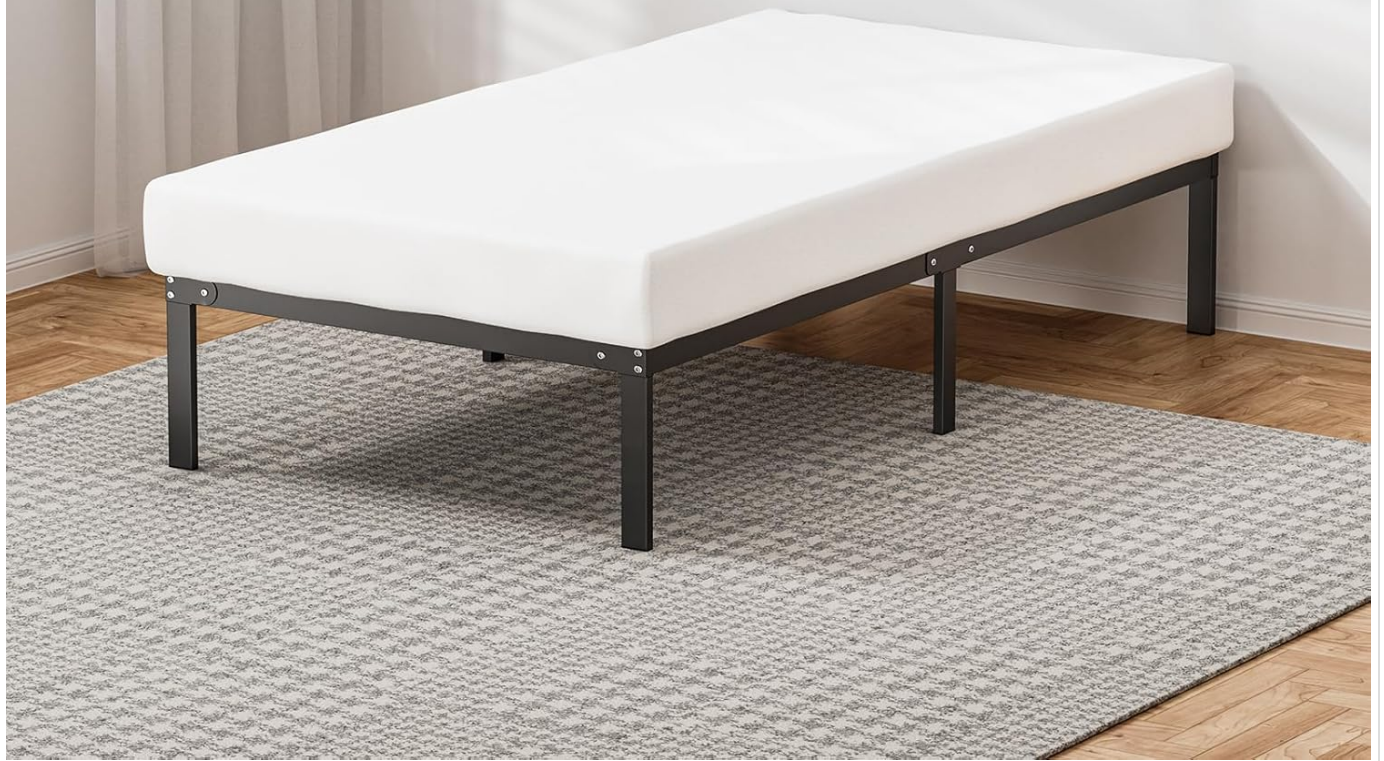
Image: The ZUNMOS bed frame shown with a mattress placed directly on it, illustrating that no box spring is needed.

The 14-inch height provides ample space underneath for storage. You can utilize this area for bins, boxes, or other items to maximize room organization.