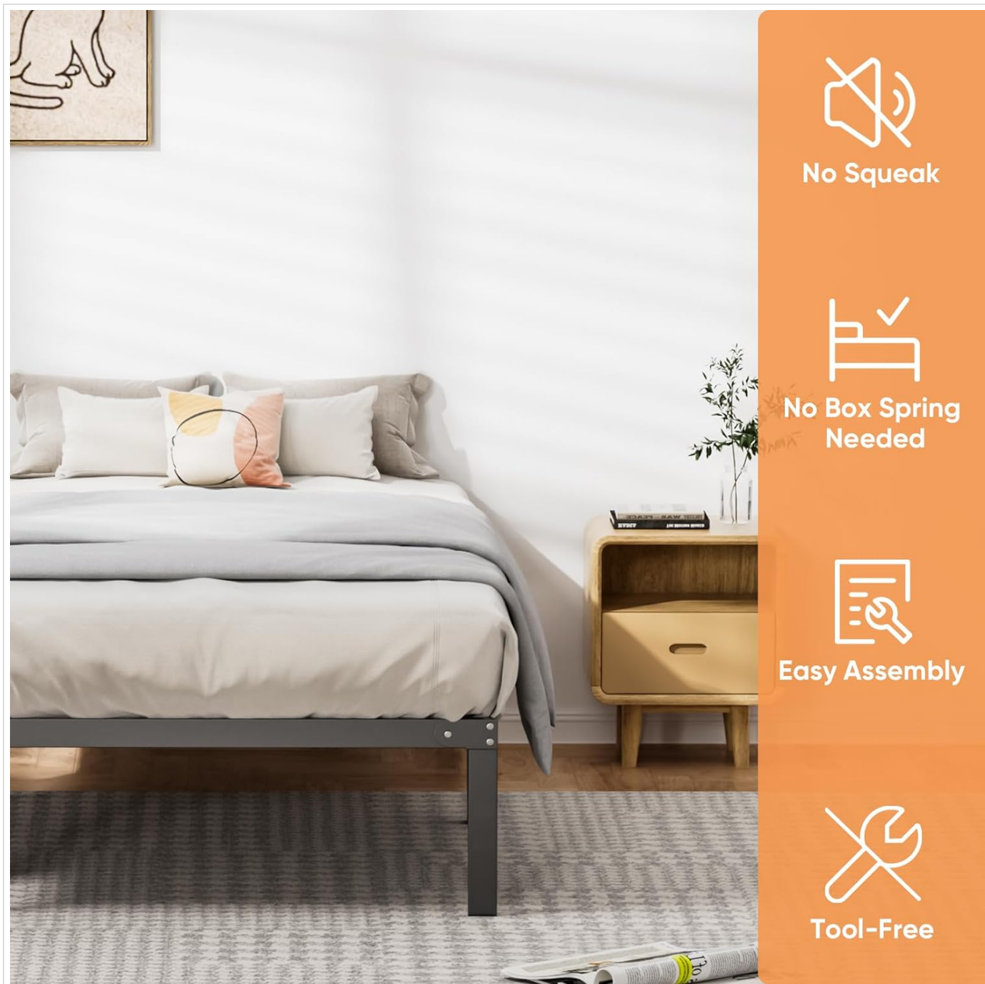
Image: Visual representation of key features: no squeaking, no box spring required, easy assembly, and tool-free setup.