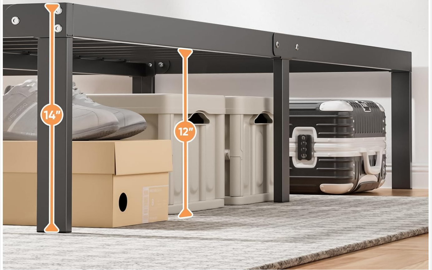
Image: A view under the bed frame demonstrating the large storage space available, with various storage containers placed beneath.