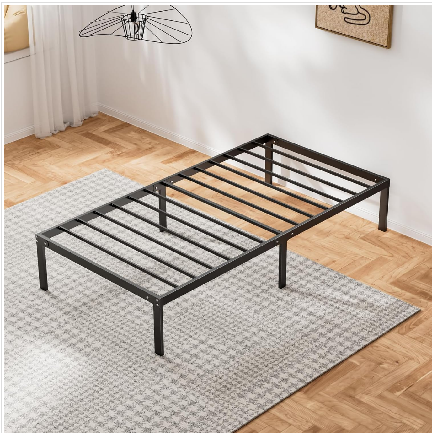
Image: Fully assembled ZUNMOS metal platform bed frame, showcasing its minimalist design and under-bed clearance.