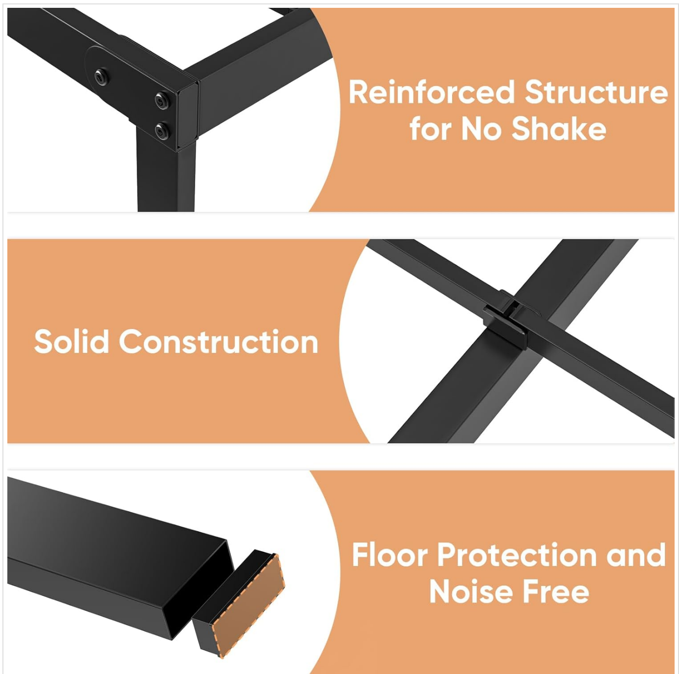
Image: Close-up views highlighting the reinforced structure for stability, solid construction, and protective caps on the legs for floor protection and noise reduction.