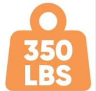
Image: Diagram showing the dimensions of the twin bed frame: 75 inches length, 38 inches width, and 14 inches height, with a 350 lbs load-bearing capacity.