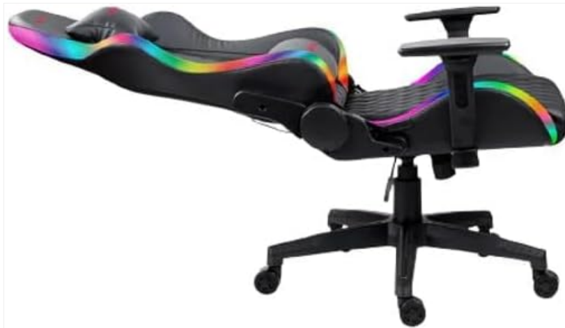
Image: The Xtrike-Me GC 907 Gaming Chair shown in a fully reclined position, demonstrating its 180-degree recline capability, suitable for resting or napping.