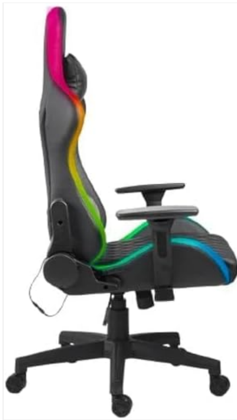
Image: Side profile of the Xtrike-Me GC 907 Gaming Chair, highlighting the contoured backrest, adjustable armrest, and the vibrant RGB light strip running along the chair's side.