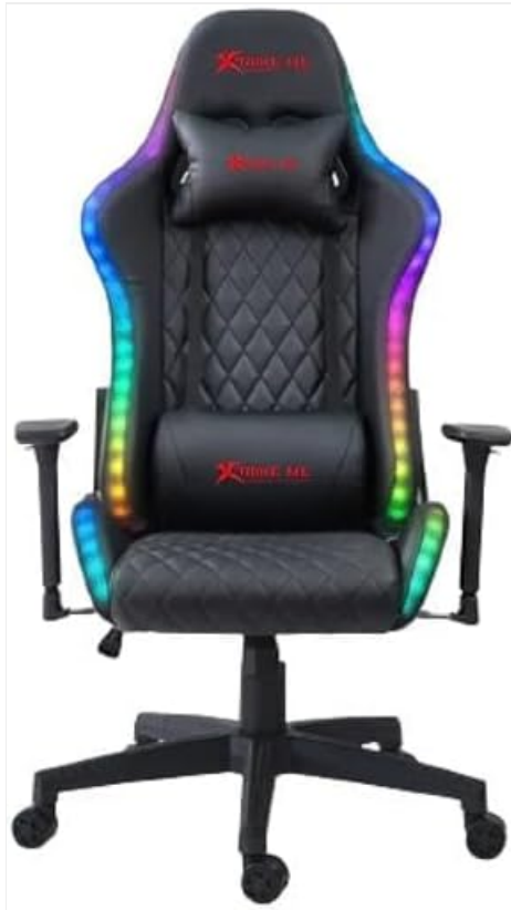
Image: Front view of the Xtrike-Me GC 907 Gaming Chair, showcasing the ergonomic design, headrest, lumbar support, and integrated RGB lighting along the edges.