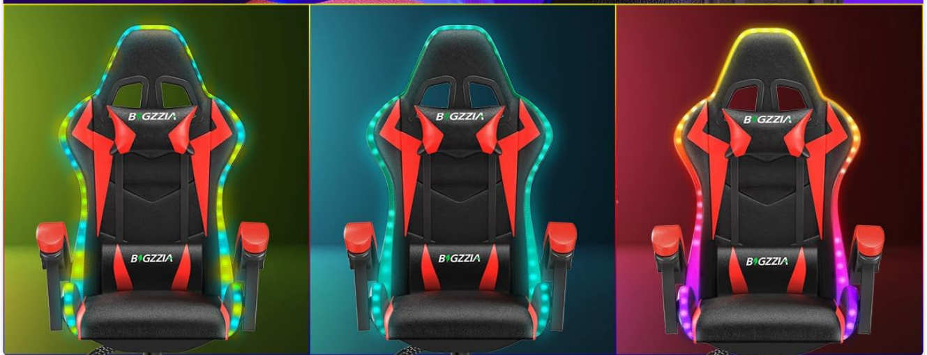
Image: The Bigzzia gaming chair shown with different RGB LED light colors and patterns, demonstrating the 358 available modes.