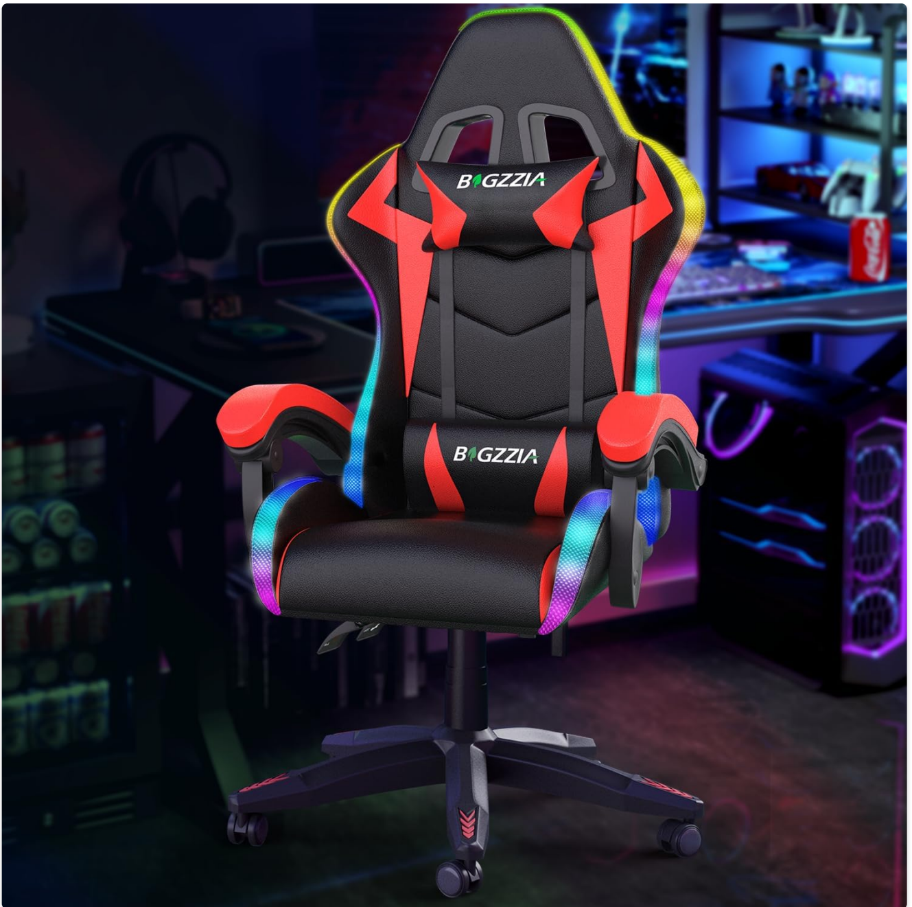
Image: The Bigzzia Gaming Chair with RGB LED Lights, featuring a black and red design with illuminated edges.