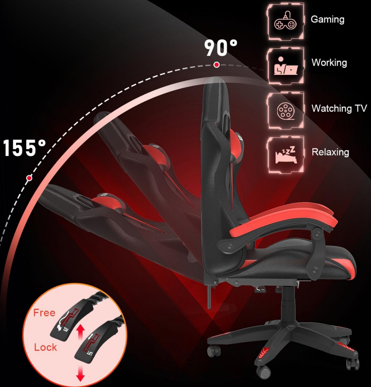
Image: Diagram showing the chair reclining from 90 degrees (upright) to 155 degrees (fully reclined), with levers for locking and unlocking the recline.