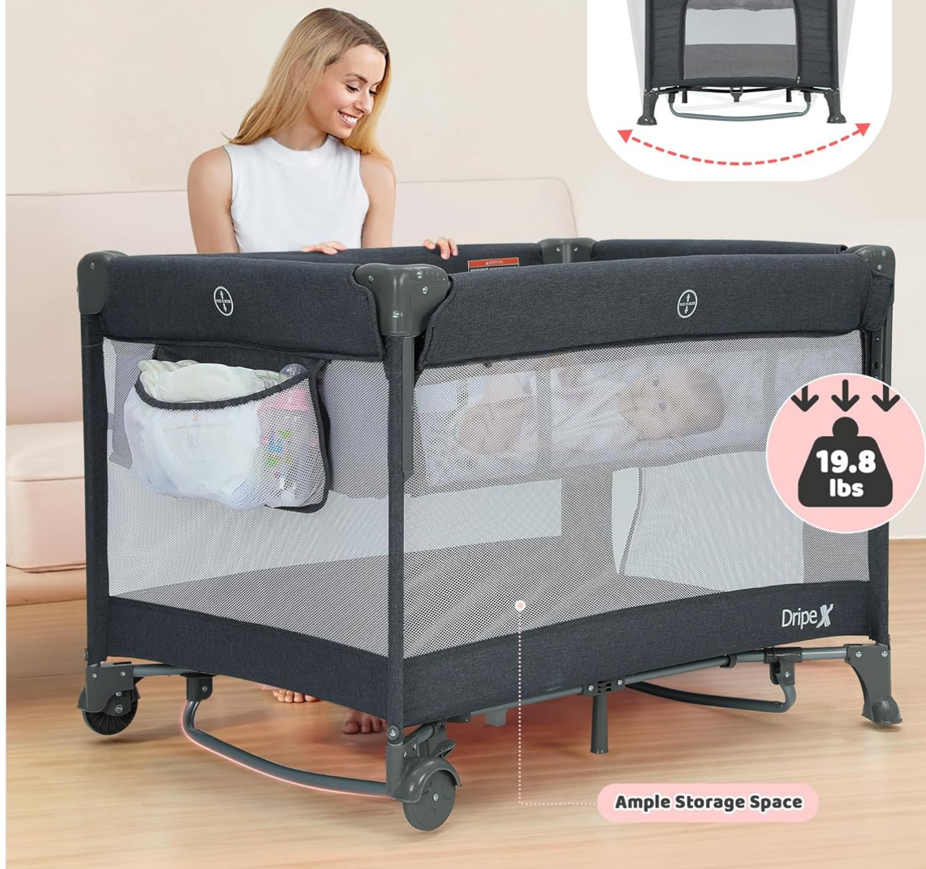
Image: The bassinet with the convenient changing table attachment in use.