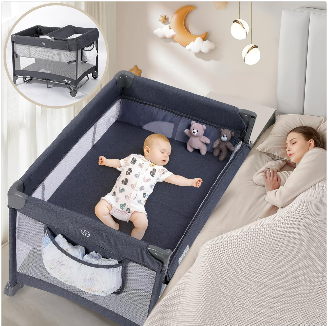
Image: All components included with the Dripex 5-in-1 Baby Bassinet.