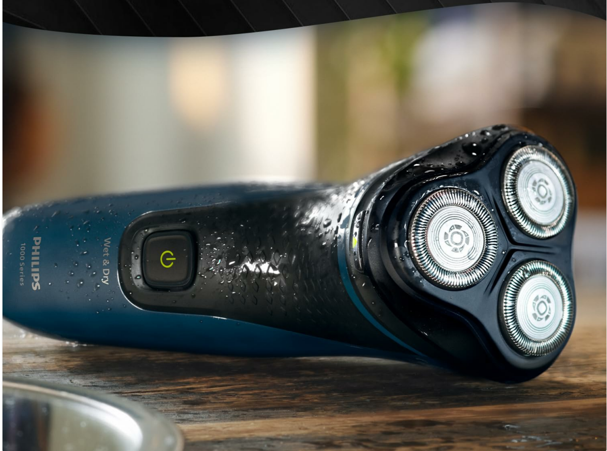
Image 5.1: The Philips Shaver S1151/03 shown with its shaving head flipped open, demonstrating the one-touch open feature for easy cleaning under running water.