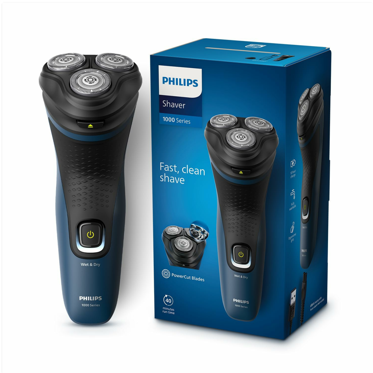
Image 2.1: Philips Electric Shaver S1151/03 with its retail packaging, showcasing the shaver's design and key features.