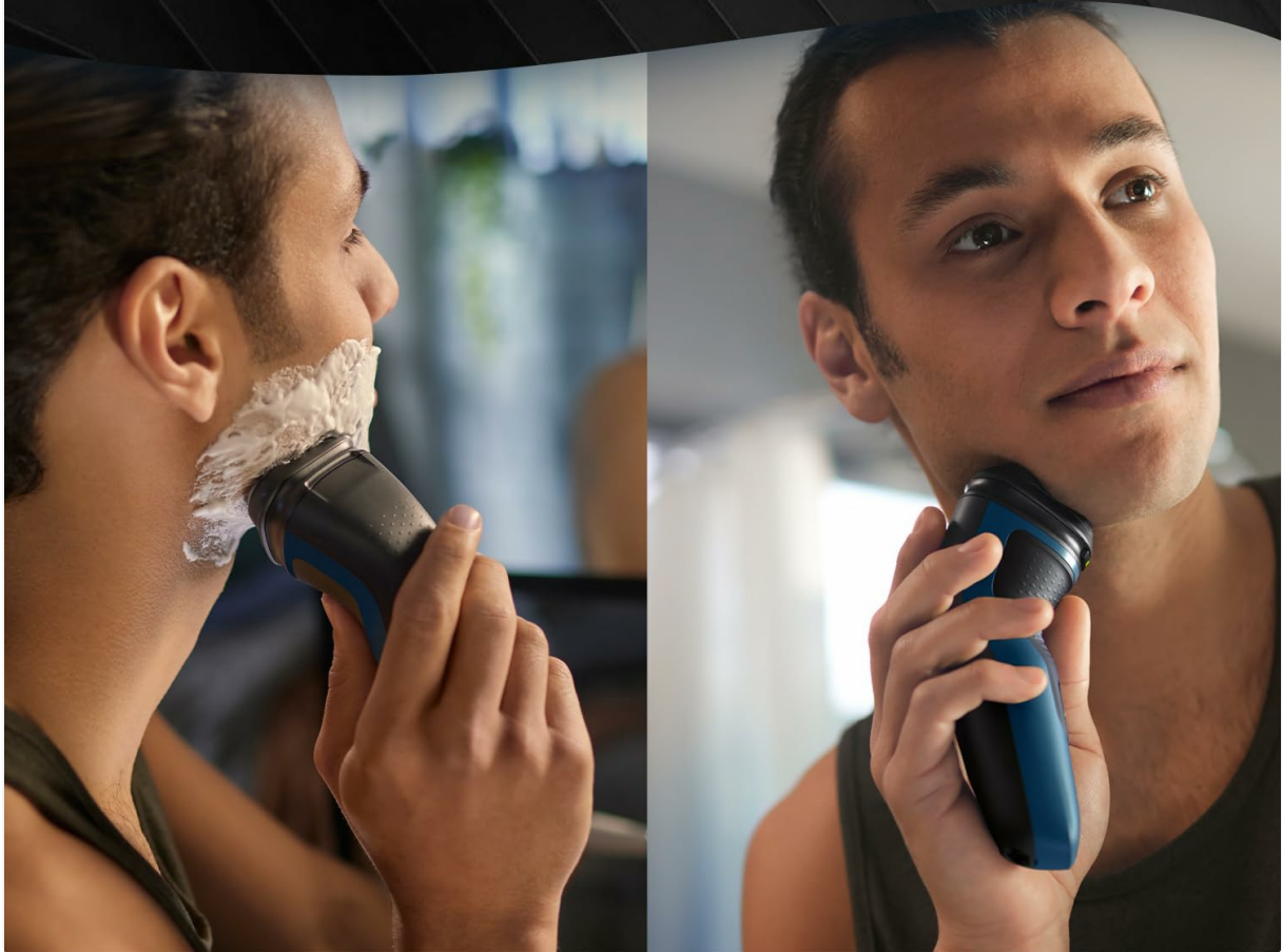
Image 4.1: Demonstrates the versatility of the Philips Shaver S1151/03, showing a user performing both a wet shave with foam and a dry shave.