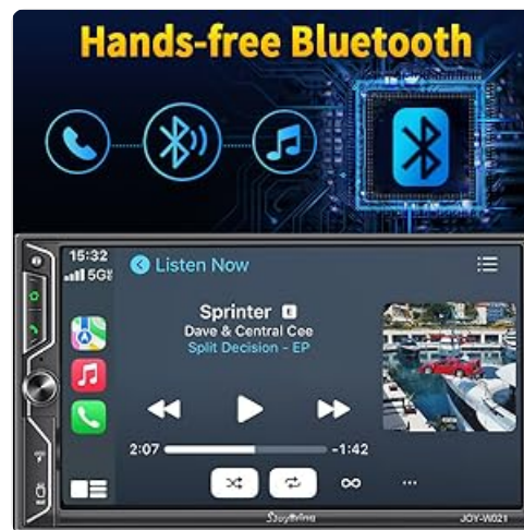
Figure 11: Bluetooth interface for music and calls.

for wireless music streaming, hands-free calls, and MP3 playback.