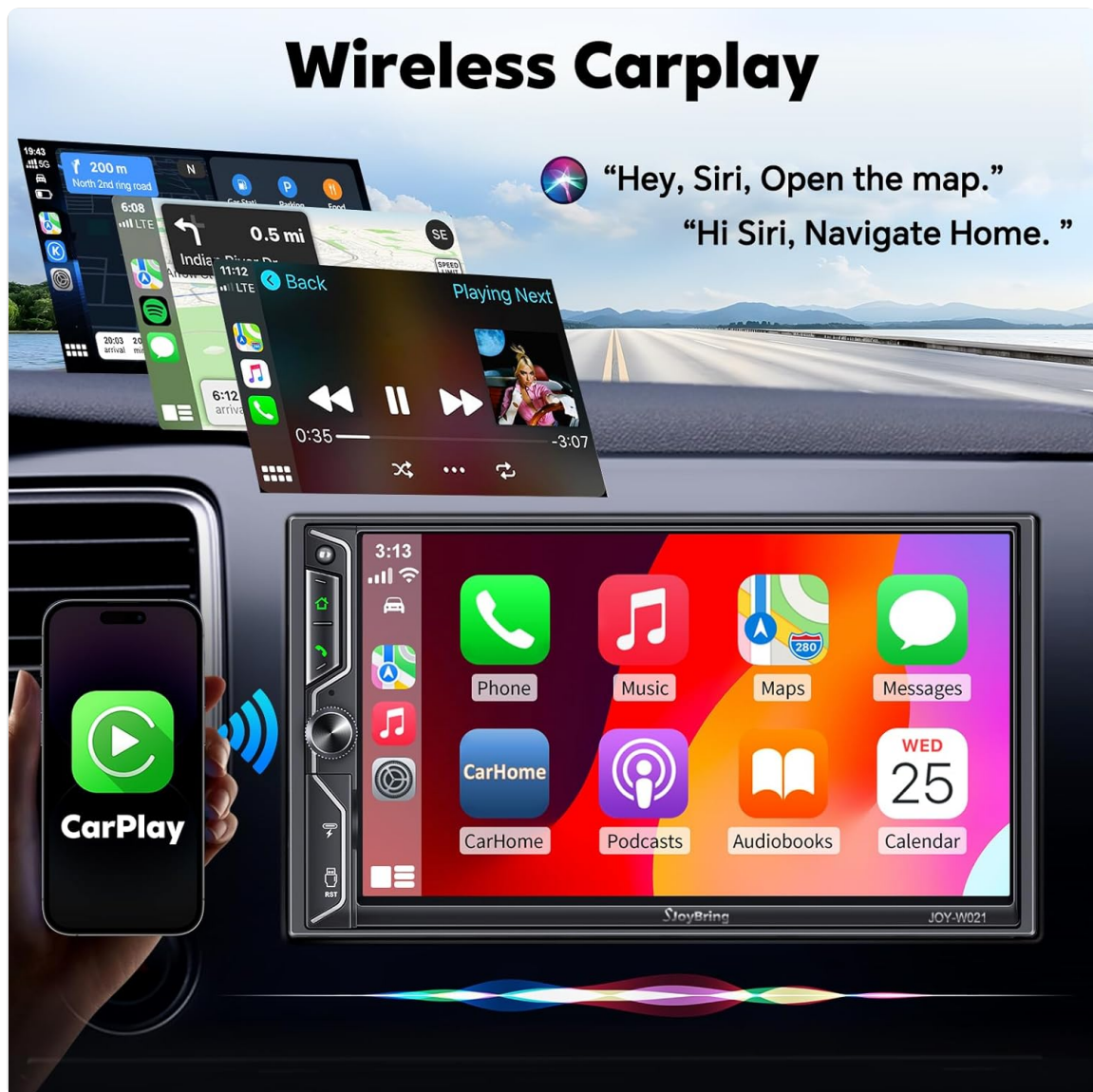
Figure 5: Wireless Apple CarPlay interface.

Connect your smartphone wirelessly for seamless integration. Access navigation, make calls, send messages, and play music directly from the stereo's display. Advanced voice control allows for hands-free operation.