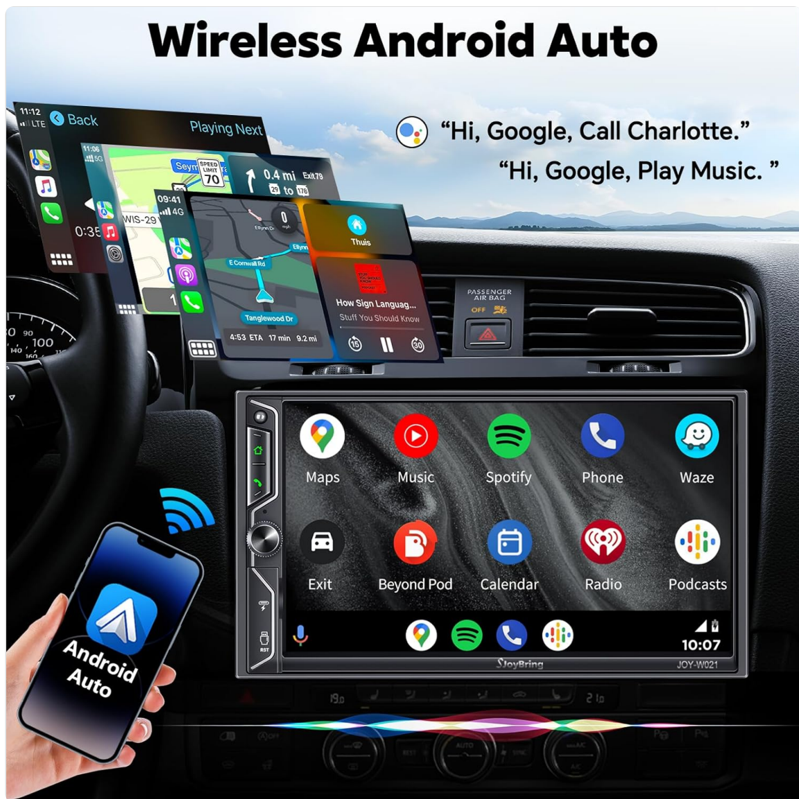
Figure 6: Wireless Android Auto interface.