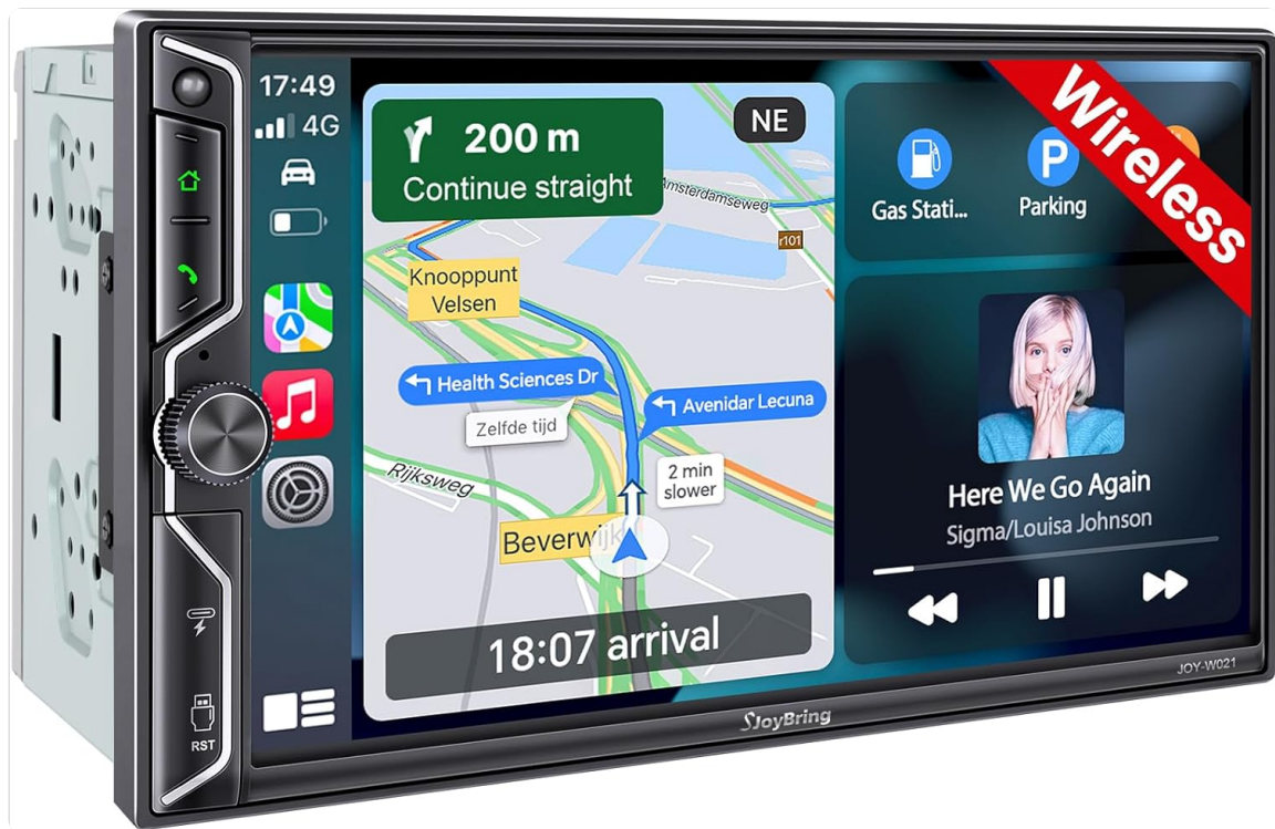
Figure 1: SJOYBRING JOY-W021 Head Unit and included accessories.