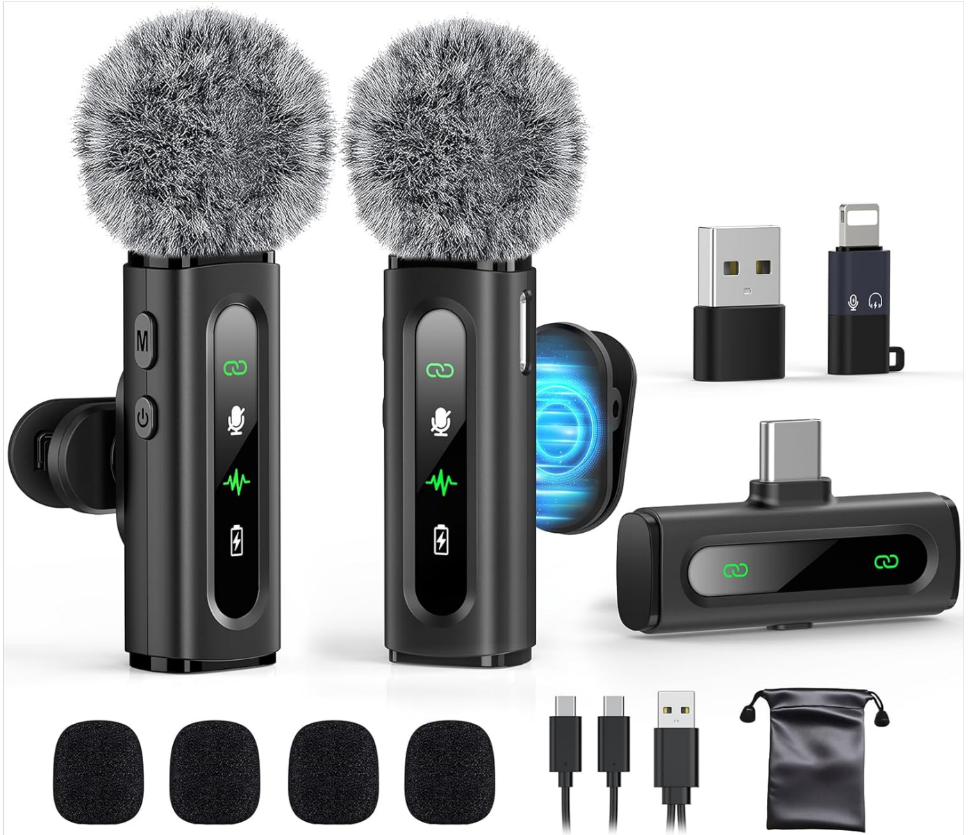
Image: Kit Contents. This image displays all the items included in the GoorDik wireless microphone package: two transmitters with furry windscreens, one receiver, a USB-C to USB-A adapter, a Lightning adapter, a charging cable, and additional foam microphone covers.