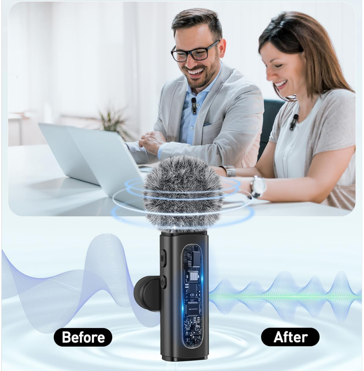
Image: Superior USB-C Microphone. This image highlights the GoorDik USB-C microphone, emphasizing its upgraded DSP noise cancellation chip for excellent audio. It shows sound waves being processed, indicating noise reduction capabilities.

Equipped with an upgraded DSP noise cancellation chip, provides excellent audio