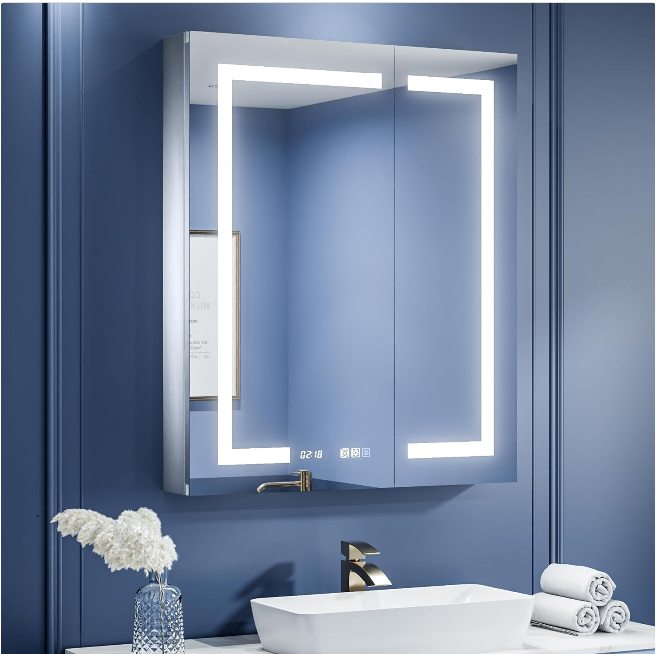
Image 1.1: The ExBrite 30"x36" Lighted LED Medicine Cabinet, showcasing its illuminated mirror and integrated clock/temperature display.