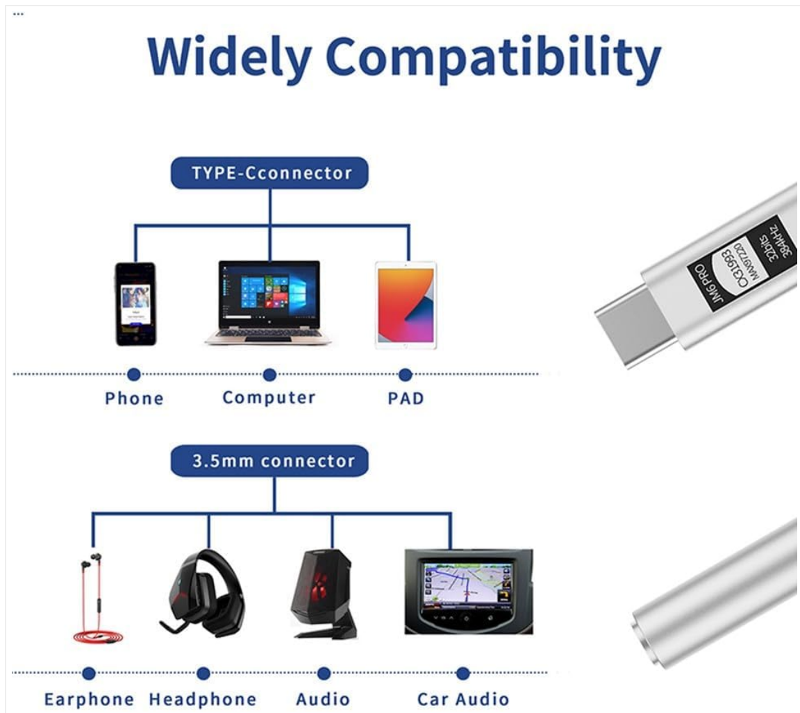
Image 3.1: Diagram illustrating the wide compatibility of the JM6 Pro, showing connection to phones, computers, and tablets via the Type-C connector.