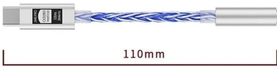
Image 7.1: A visual representation of the JM6 Pro's key specifications, including DAC/AMP chips, PCM support, and physical dimensions.