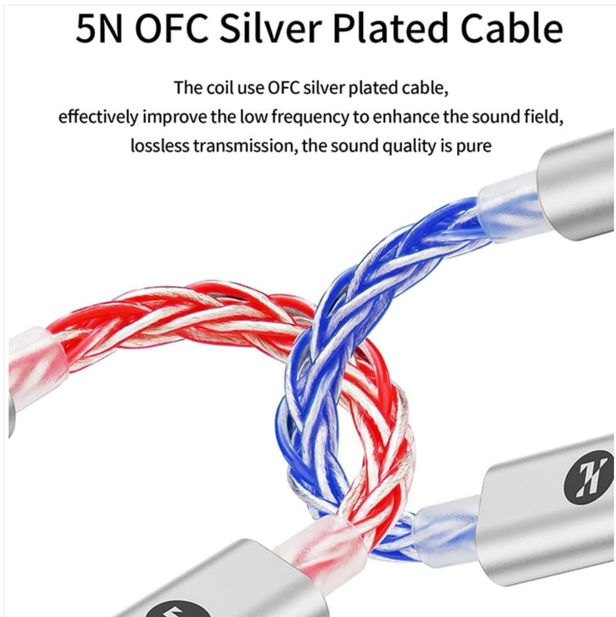
Image 5.1: Close-up of the JM6 Pro's 5N OFC silver-plated cable, designed for improved low-frequency response and lossless audio transmission.