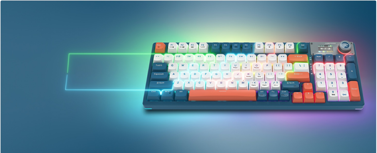
Figure 4: Gasket Structure. The keyboard's internal layers, including sound dampening foam, are designed to minimize noise and enhance typing feel.

The gasket-mounted design incorporates sound dampening foam within the keyboard body. This reduces vibrations and pings, providing a quieter and more satisfying typing experience.