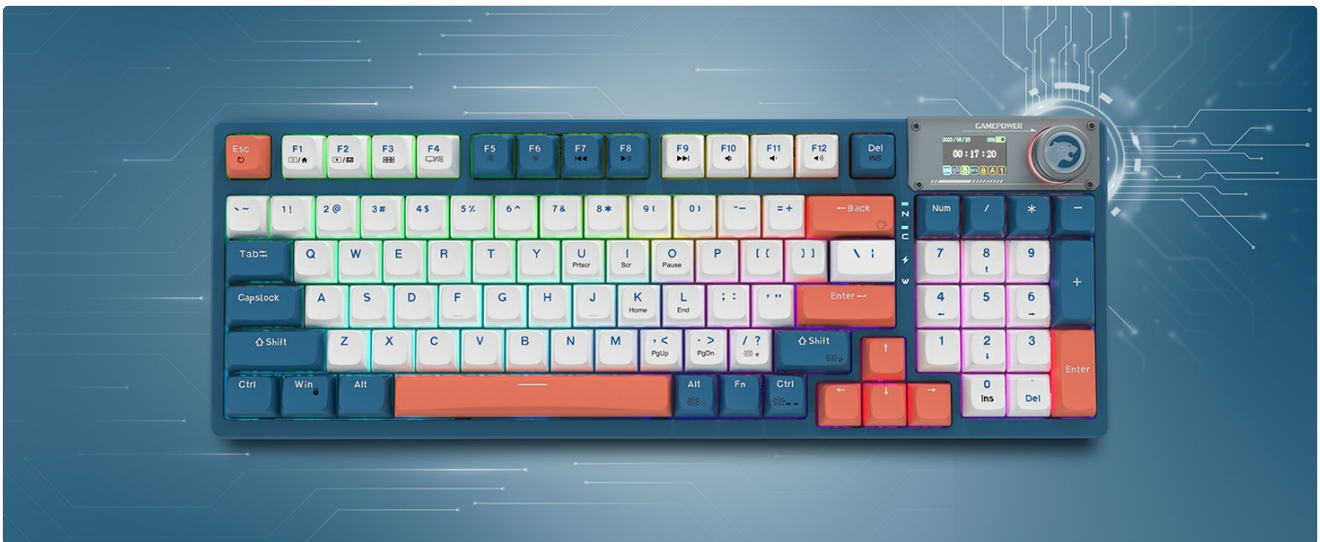
Figure 1: Triple Mode Connectivity. The keyboard can connect via USB-C cable, 2.4GHz wireless (FN+R), or Bluetooth (FN+Q/W/E) to devices such as laptops, PCs, tablets, and smartphones.