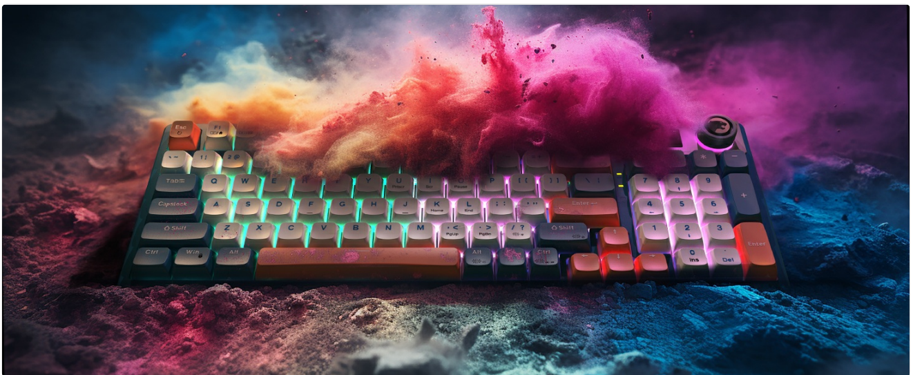
Figure 3: Customizable RGB. The keyboard features dynamic RGB lighting that can be customized to set the perfect mood or match your gaming setup.

Experience captivating RGB illumination with customizable colors and effects. The keyboard supports various lighting modes to enhance your setup.