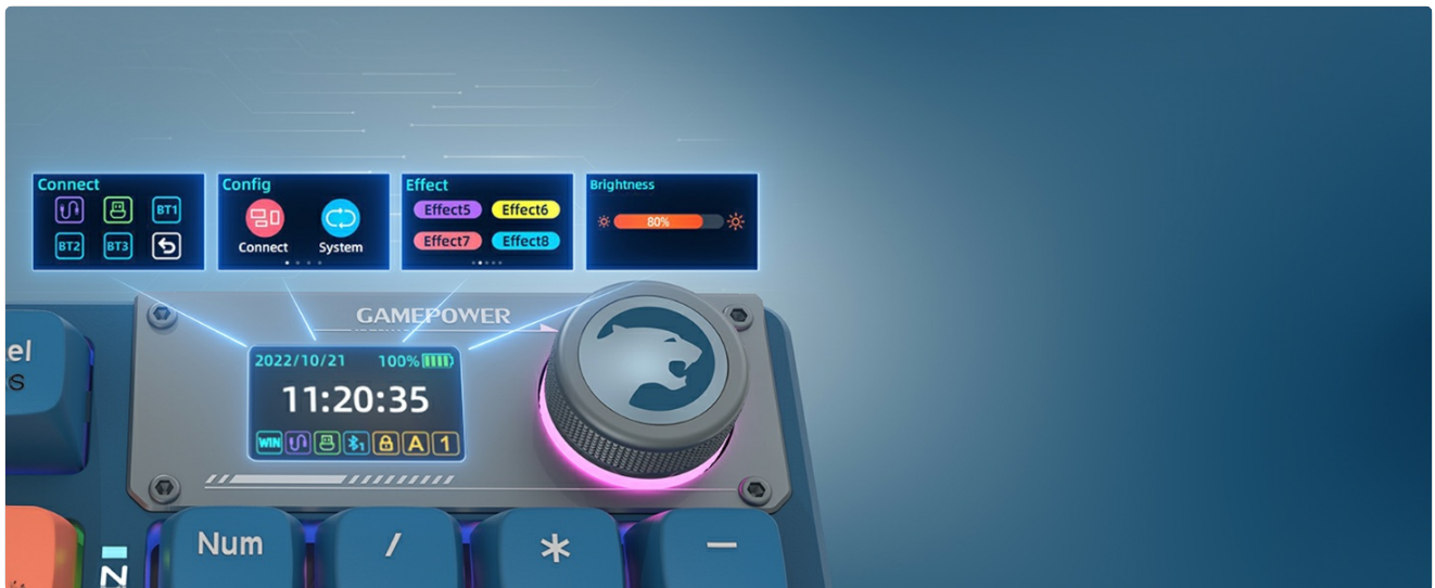
Figure 2: Next-Gen Display. The LCD screen allows customization of settings, including connectivity, lighting effects, and brightness levels, providing a unique and immersive user experience.