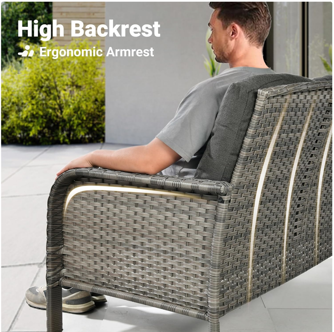
Image: A close-up of a person sitting in an ovios patio chair, emphasizing the high backrest and ergonomic armrest design for comfort.