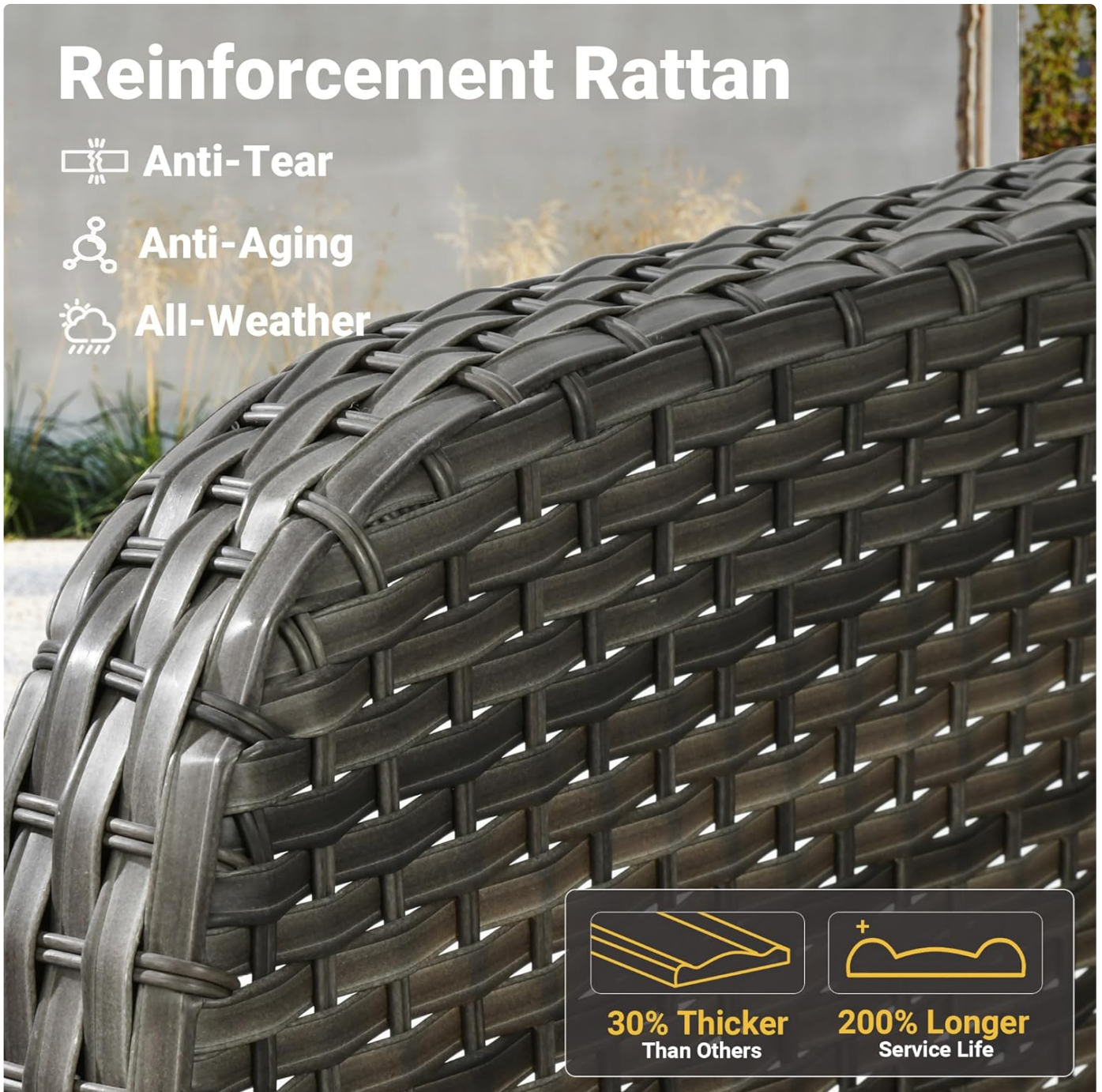
Image: A detailed view of the reinforced rattan weaving, highlighting its anti-tear, anti-aging, and all-weather properties, indicating its durability.