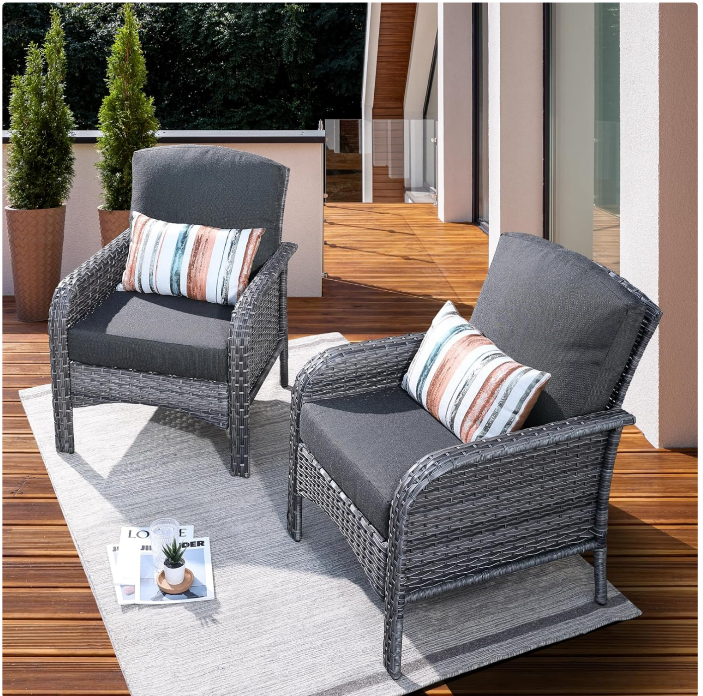
Image: The ovios 2-Piece Patio Furniture Set, featuring two high-back rattan chairs with dark grey cushions, placed on a wooden deck with decorative pillows.