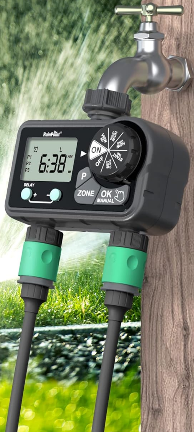
Image: Visual representation of setting up to 3 watering programs per day.