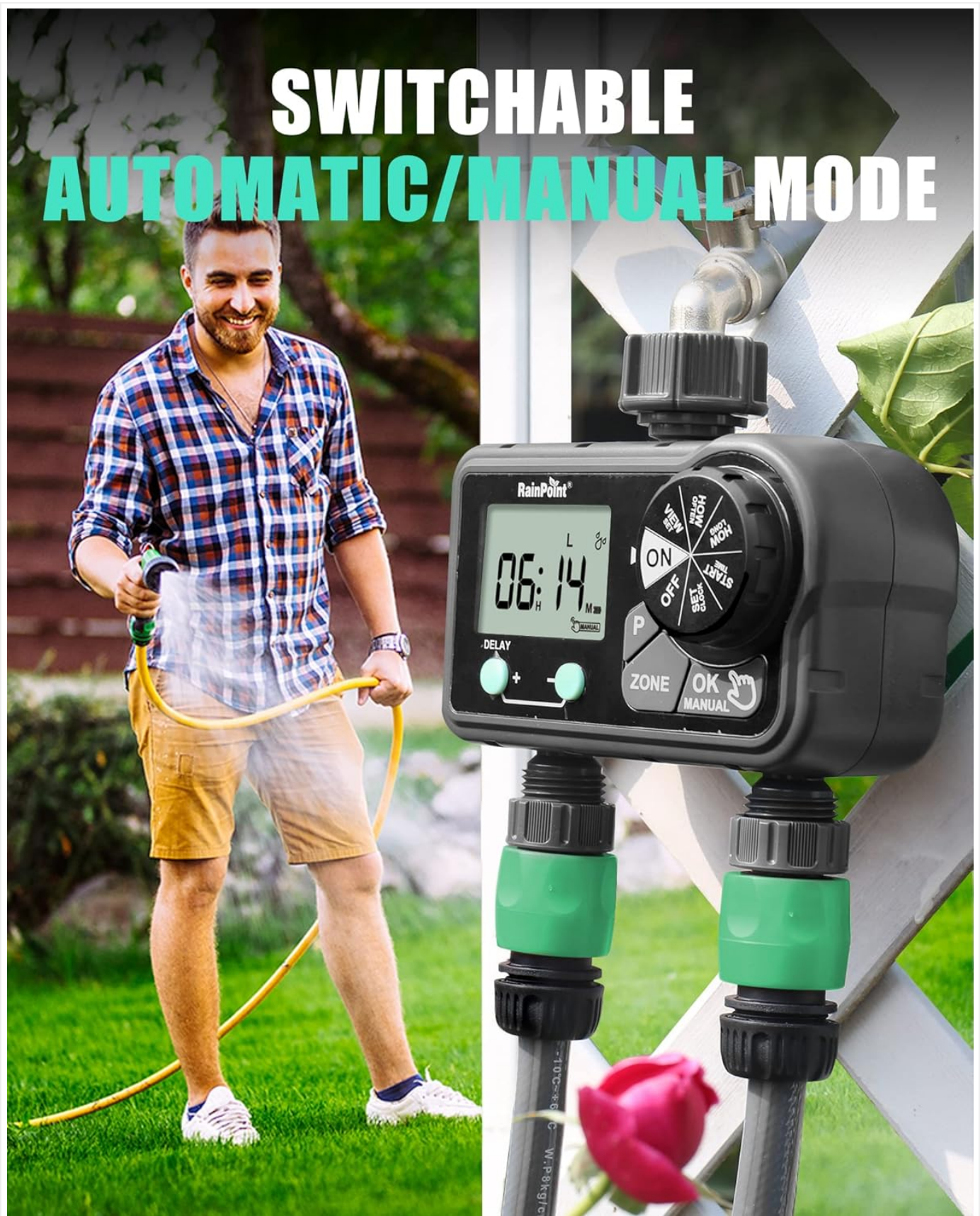
Image: A user demonstrating the manual watering mode of the RainPoint Sprinkler Timer.

Your browser does not support the video tag.