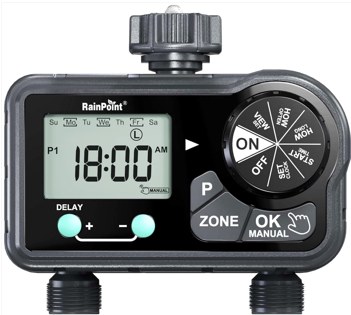
Image: The RainPoint Sprinkler Timer connected to a water faucet with two hoses attached to its outlets.